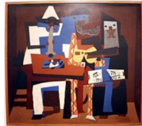
Picasso's Three Musicians