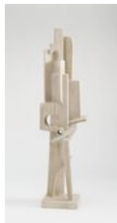
Man with a Guitar

Lipchitz sculpted clay sketches before creating full-size clay or plaster sculptures, which he had others carve from stone.