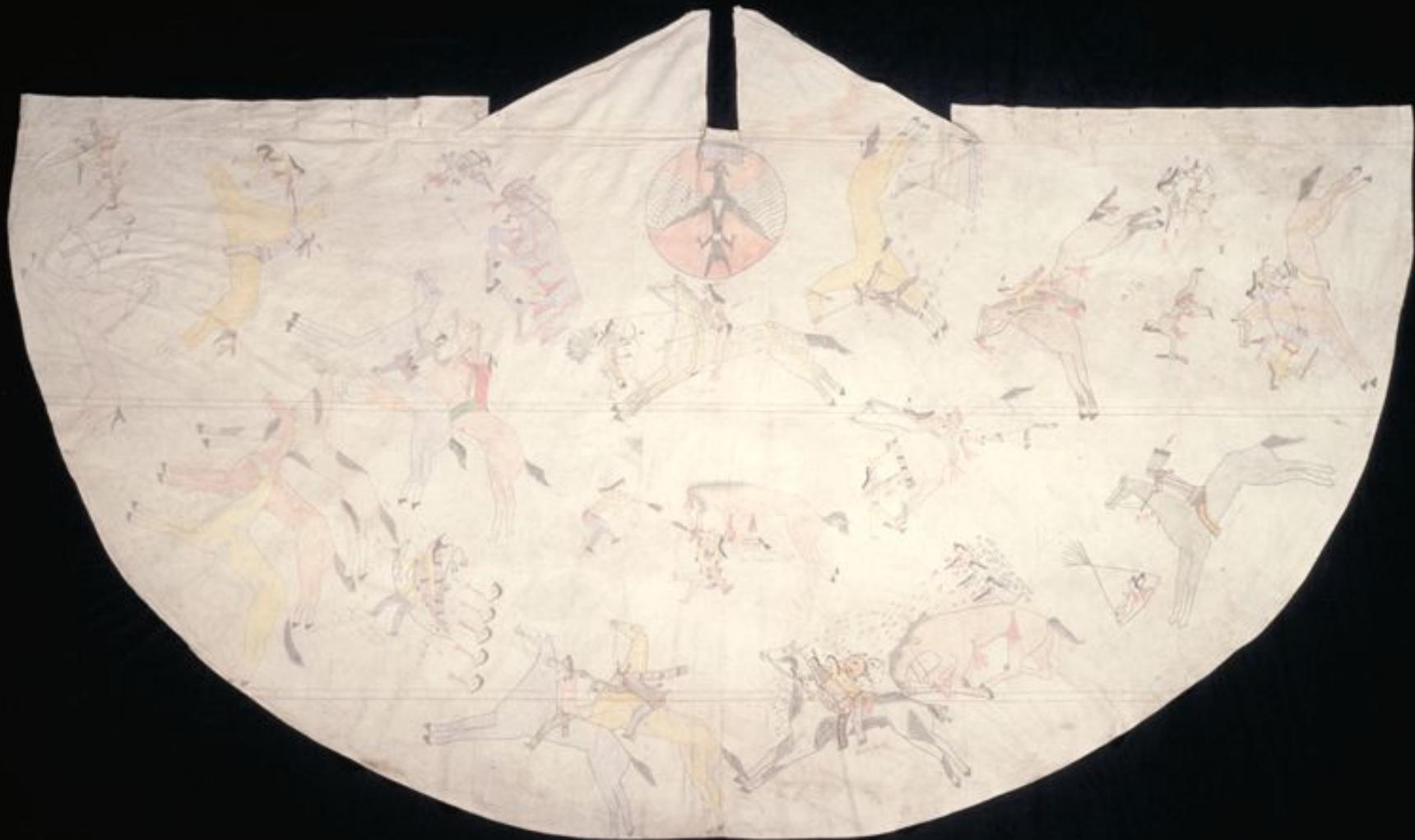
No Two Horns (Hunkpapa Lakota), 19 th -20 th c. Tipi Cover , c. 1915