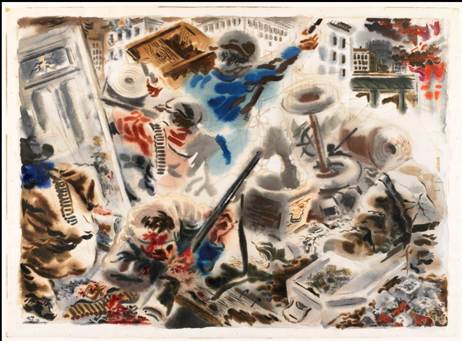
George Grosz, American (b. Germany), 1893-1959. Street Fight in Vienna , 1935. Watercolor over graphite on paper.