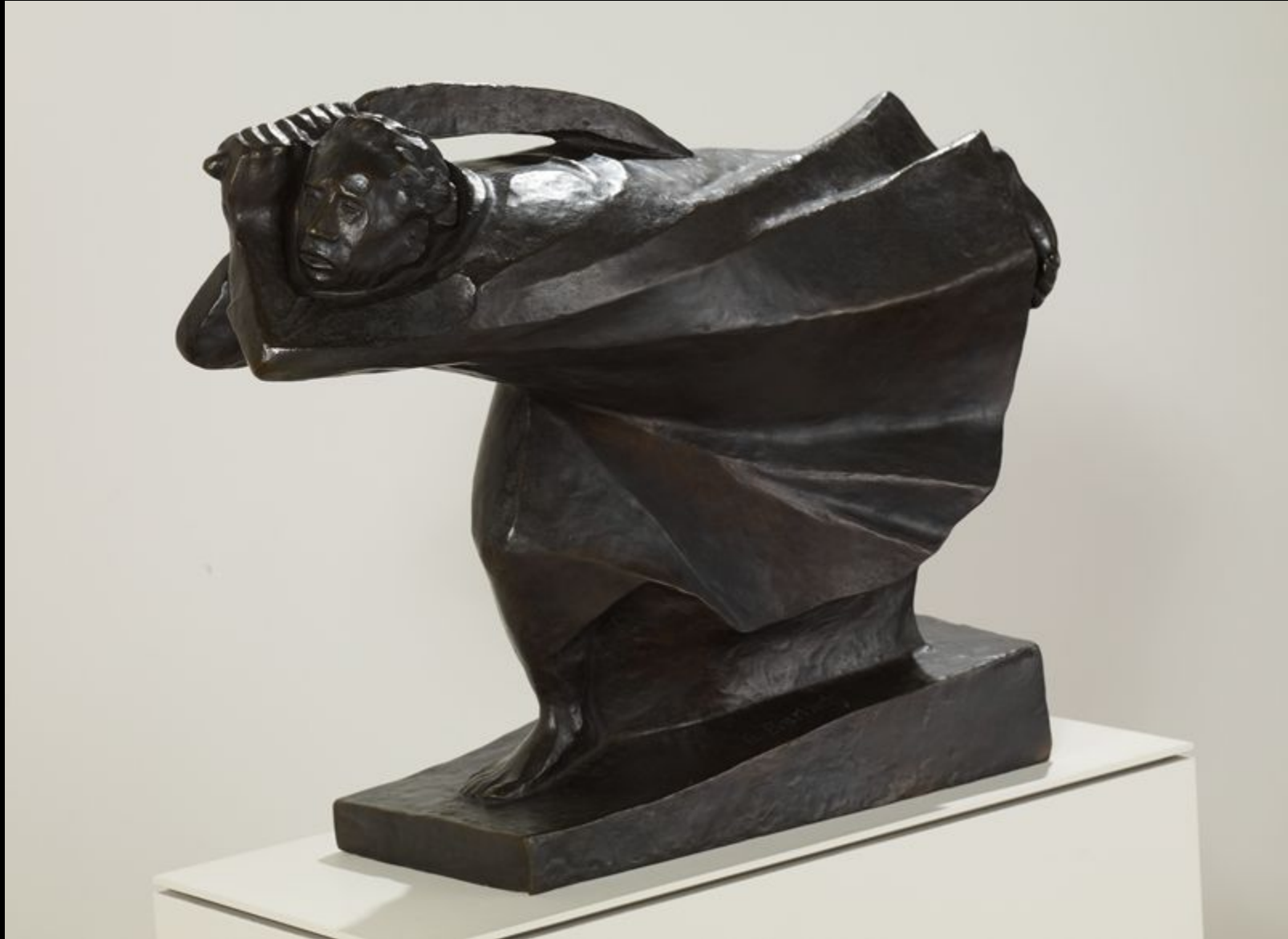
Ernst Barlach, German, 1870-1938. The Avenger (Der Rächer) , 1923. Bronze