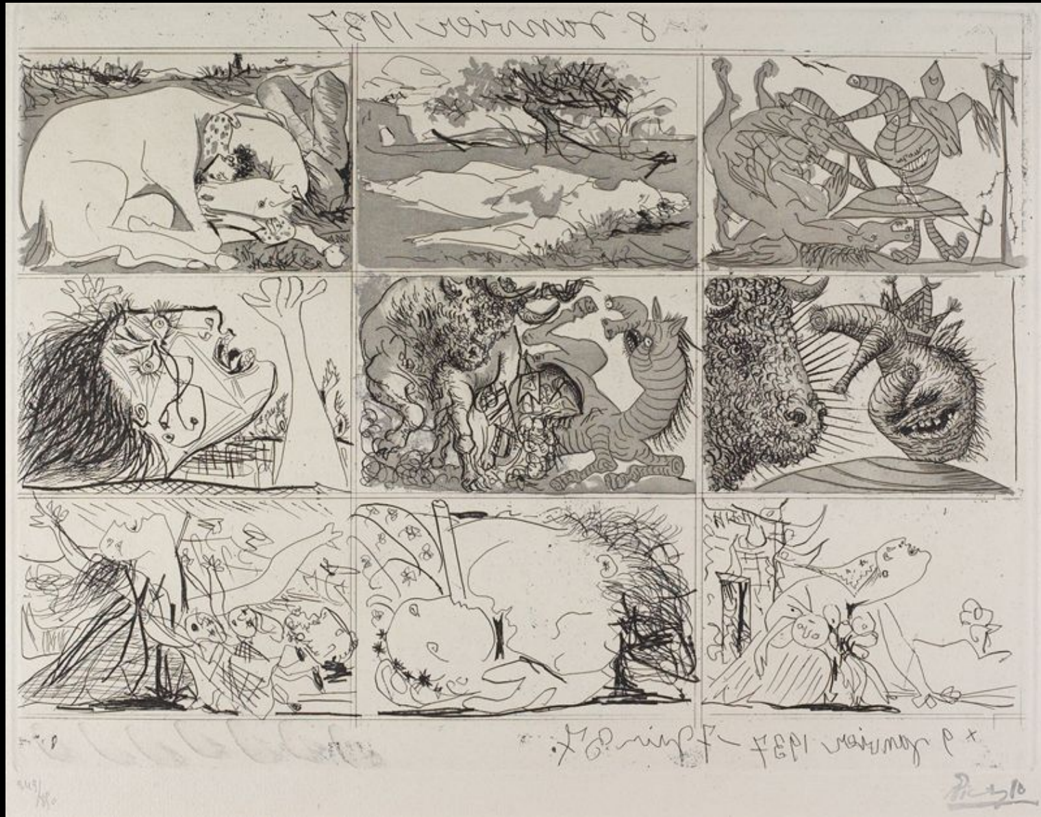
Pablo Picasso, Spanish, 1880-1973. Sueño y Mentira de Franco (Dreams and Lies of Franco) , 1938. Suite of four etchings with aquatint