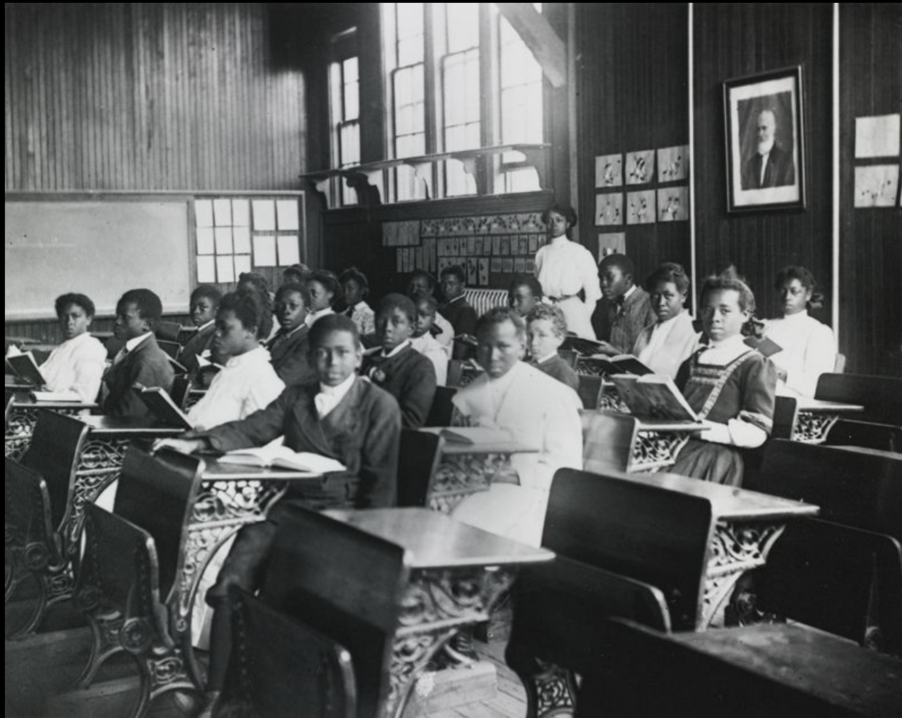
James VanDerZee, American, 1886-1983. Whittier Preparatory School, Phoebus, Virginia, 1907