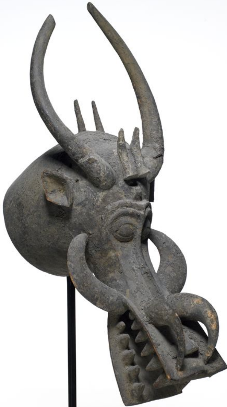
Unknown Artist (Senufo), Ivory Coast. Mask , c.19 th -20 century