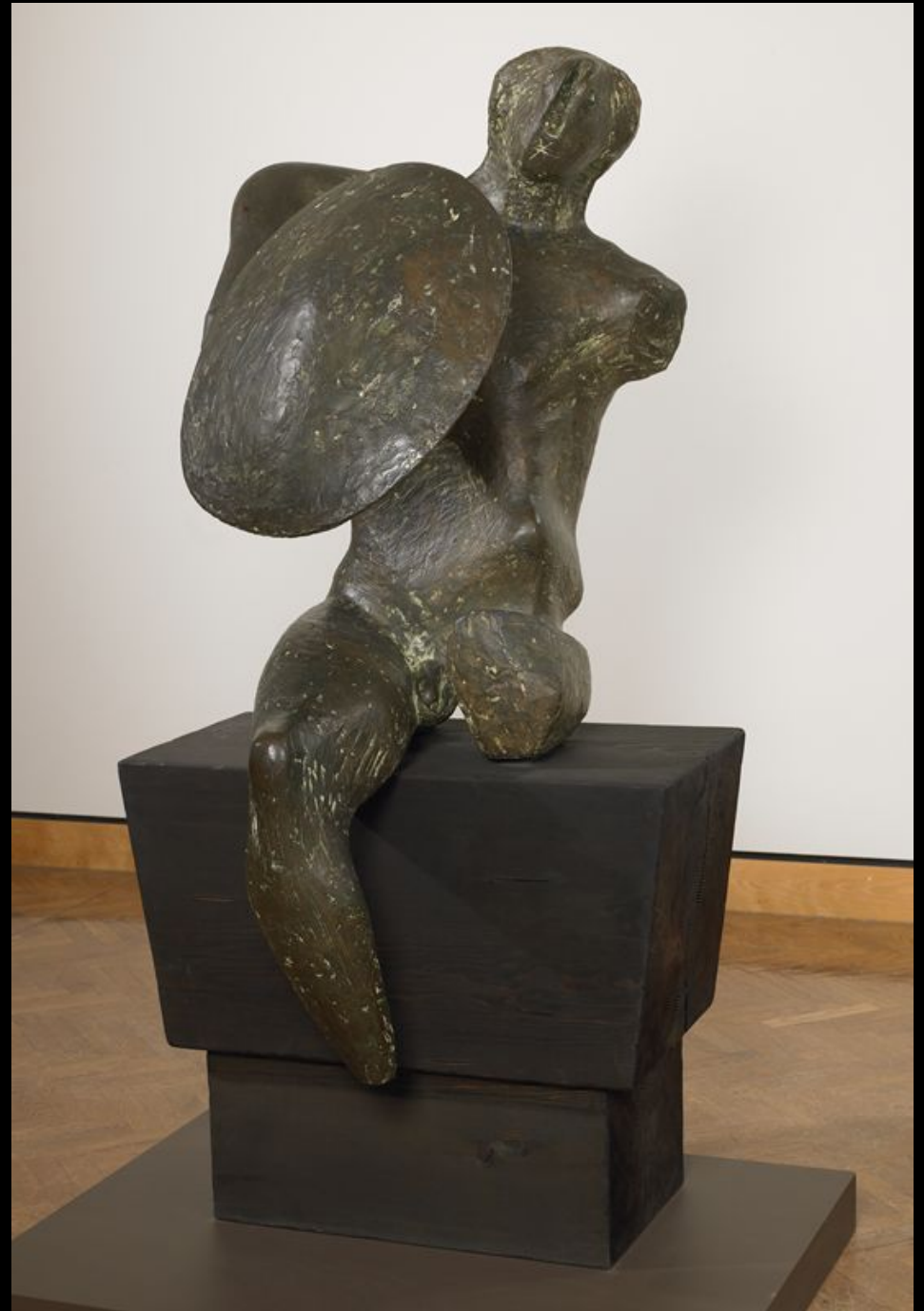
Henry Moore, British, 1898-1986. Warrior with Shield , 1953-1954