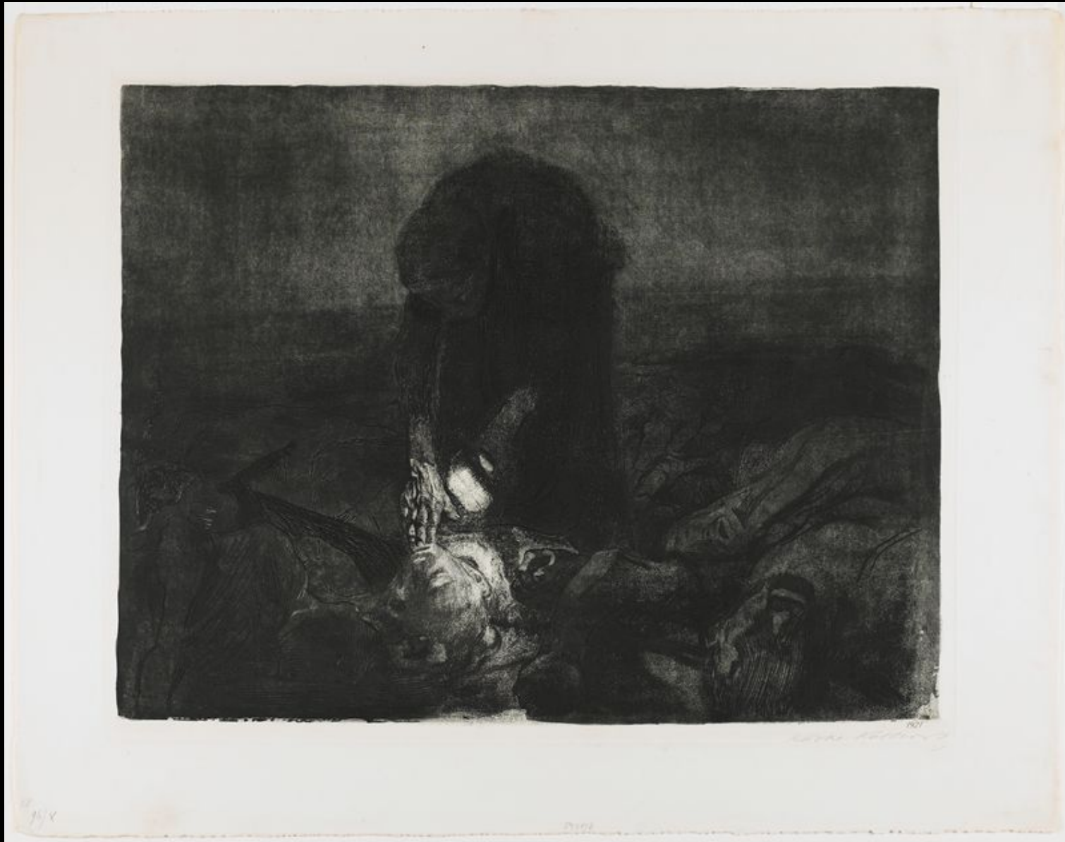
Käthe Kollwitz, German, 1867-1945. Battlefield , 1907 (1921 edition), Etching and soft-ground etching in green-black ink