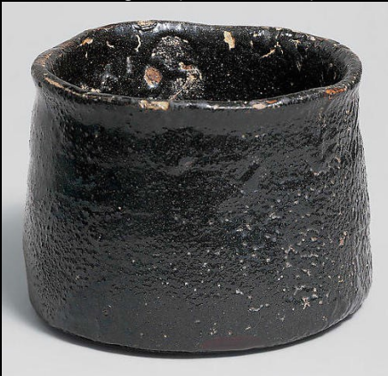
Metropolitan Museum of Art (Burke)