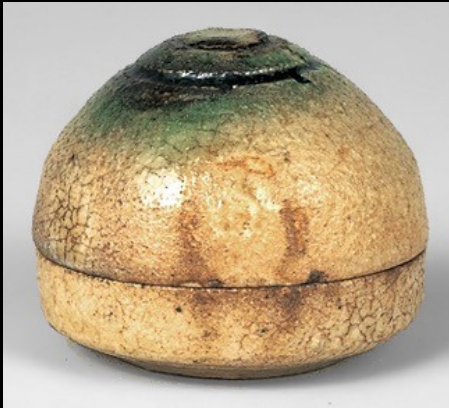
Nezu Museum, Tokyo