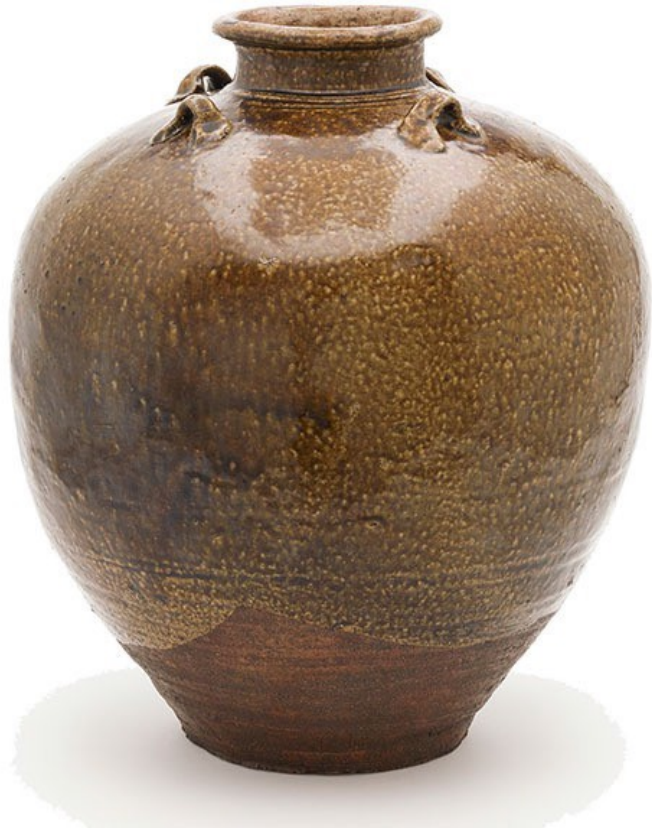
Tea Leaf Storage Jar Chinese, 13th century Freer Gallery