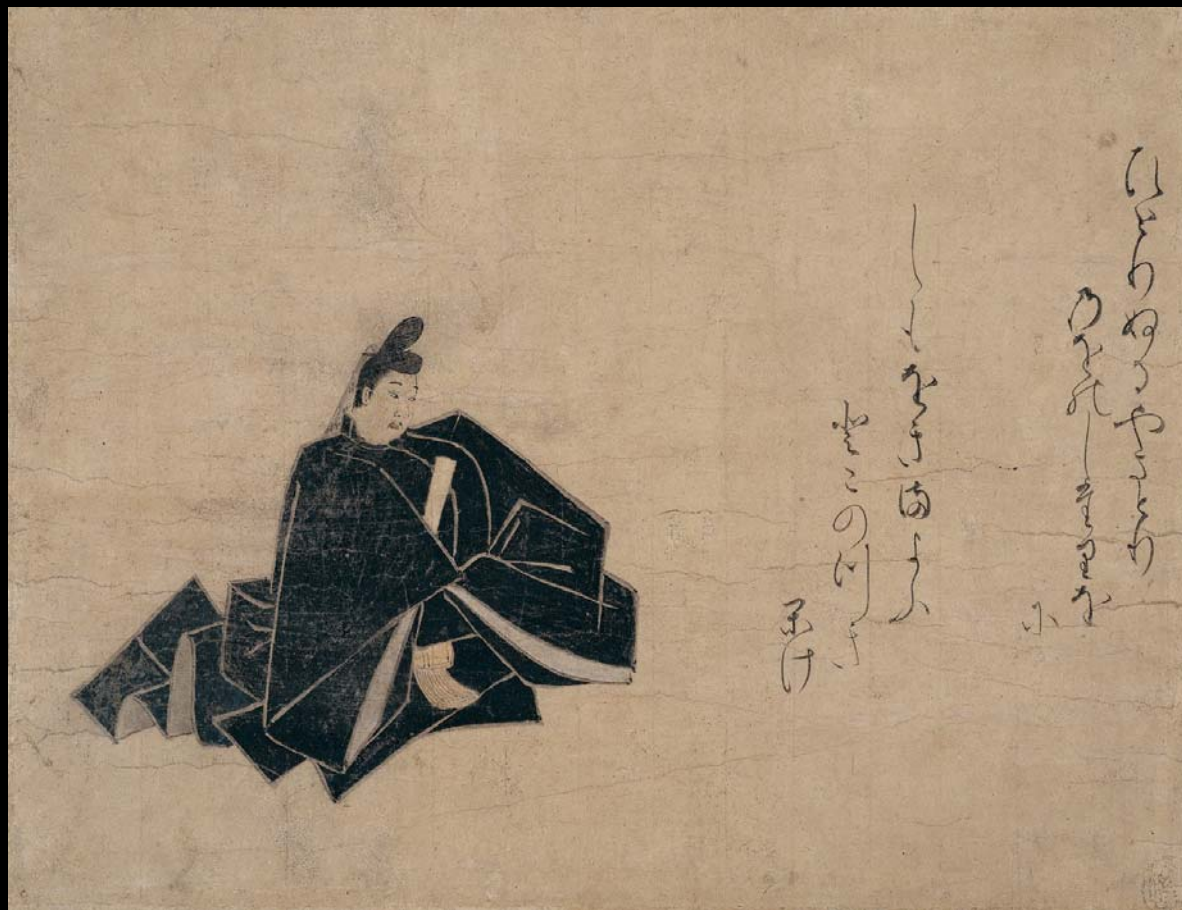
Fujiwara Teika, from One Poet One Poem (Ikkasen isshu), early 14th century Fragment of a handscroll, mounted as a hanging scroll; ink and color on paper Mary Griggs Burke Collection, gift of the Mary and Jackson Burke Foundation L2015.33.21