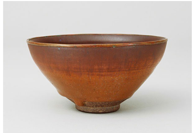
Tea Bowl Chinese, 13th century Tokugawa Museum of Art