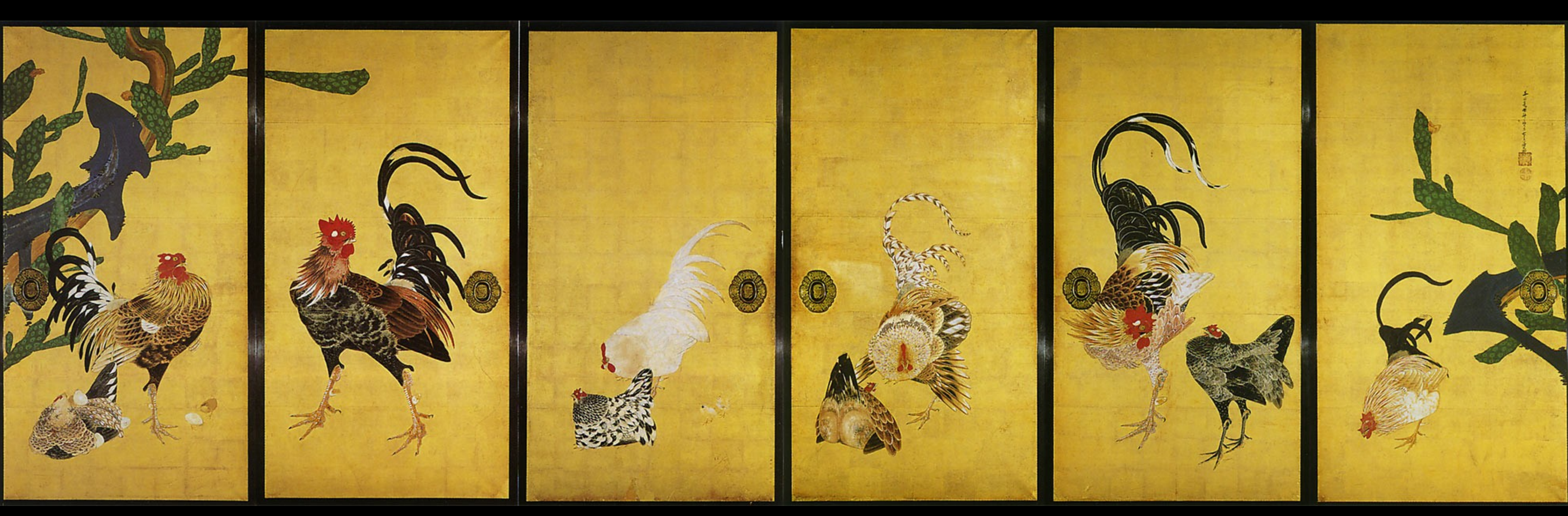
Itō Jakuchū, 1716–1800 Roosters, ca. 1789 Sliding door panels; ink, color, and gold on paper Saifukuji, Osaka