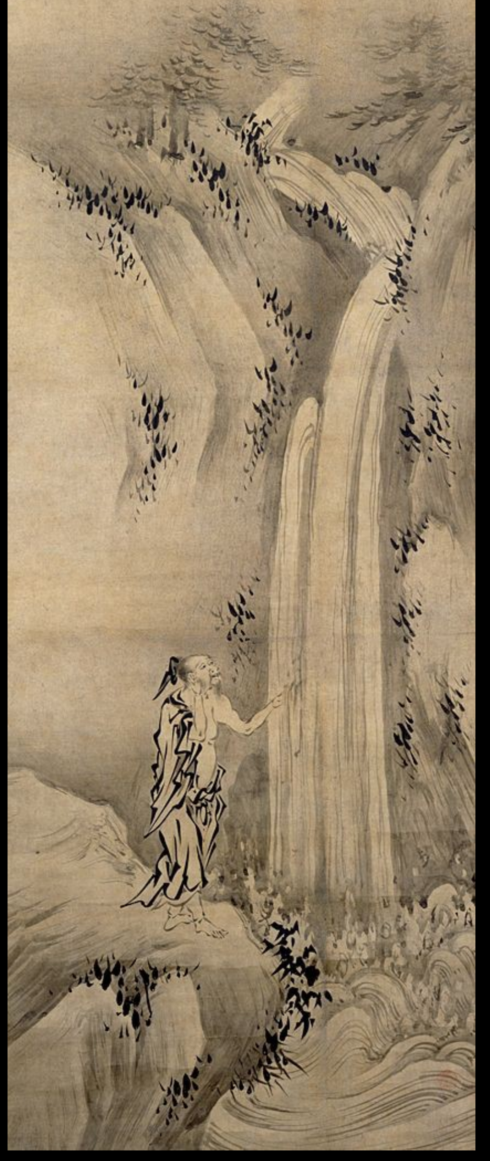
Kano Eitoku, 1543–1590 Xuyou and Chaofu, late 16th century Pair of hanging scrolls; ink on paper Tokyo National Museum