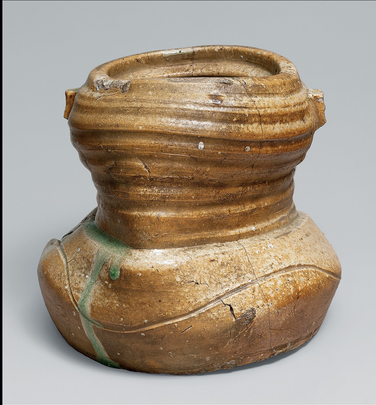
Burst-bag-type freshwater jar , late 16th to early 17th century Iga ware; stoneware with natural ash glaze; lacquer cover Mary Griggs Burke Collection, gift of the Mary and Jackson Burke Foundation L2015.33.303a,b