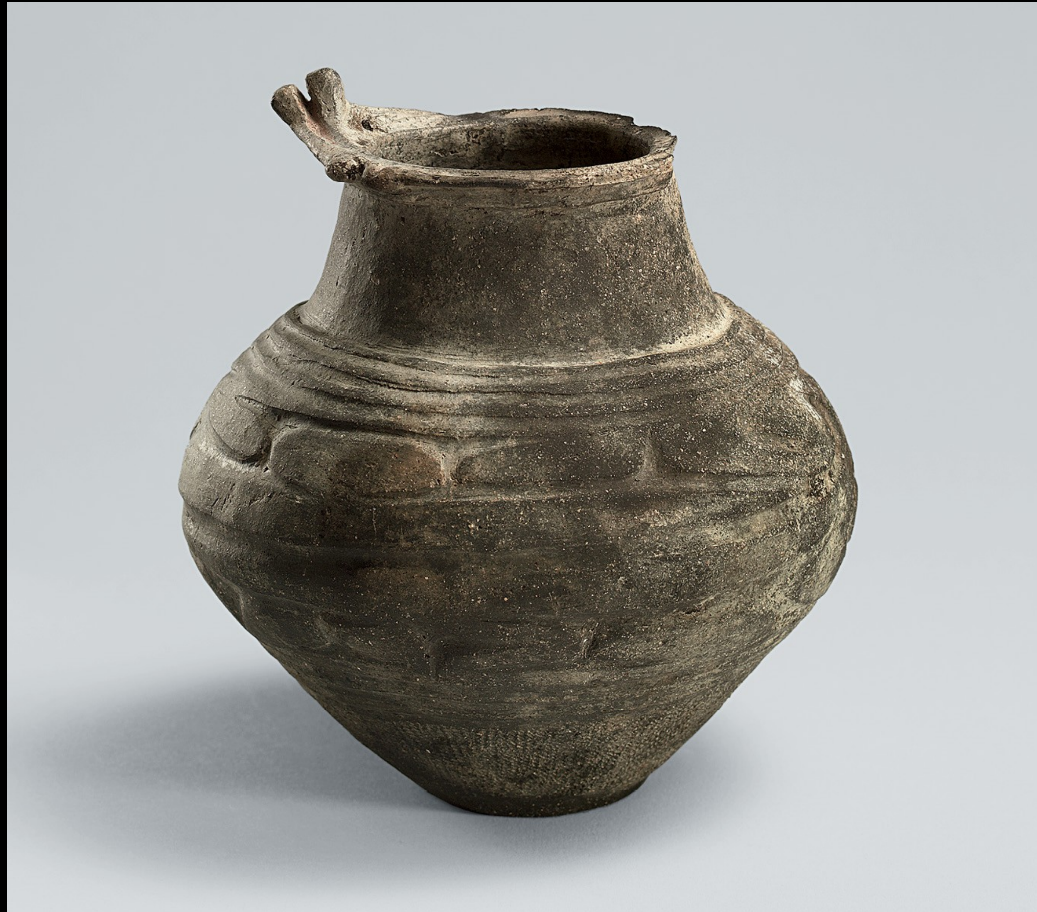
Jar with broken rim, 11th to 5th century BCE