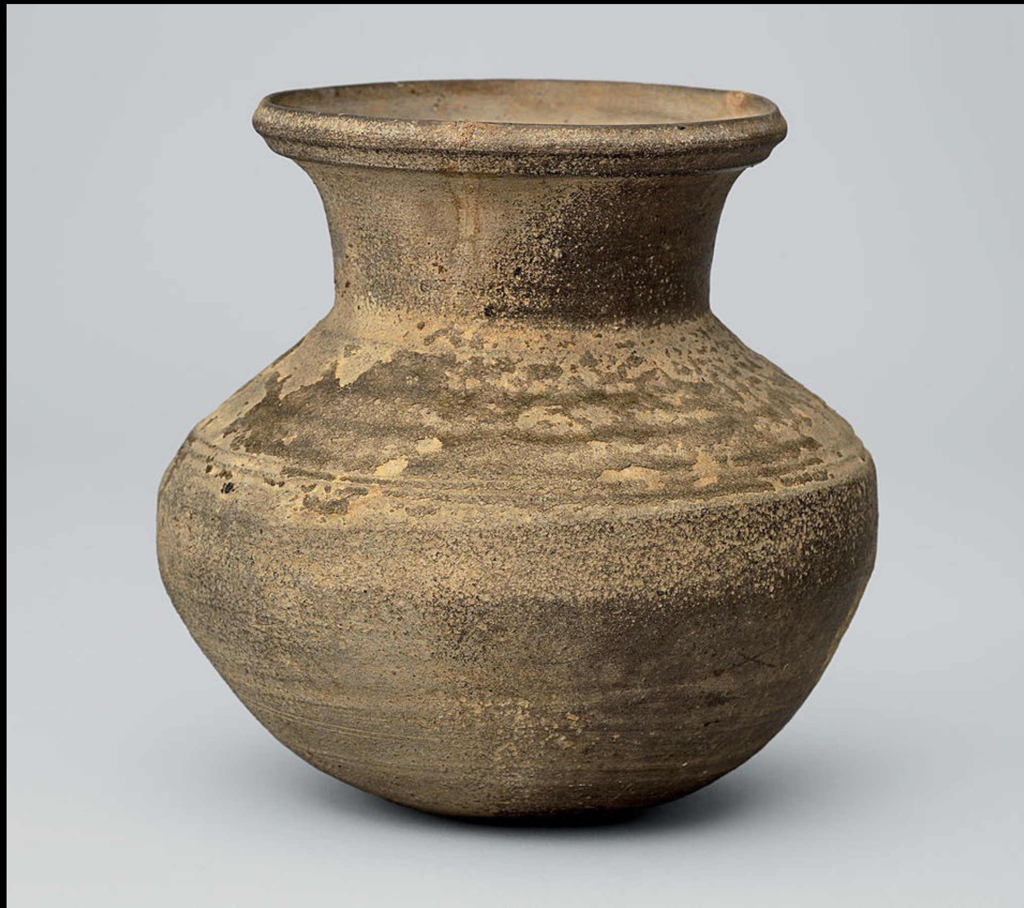
Jar with flared mouth, 5th century