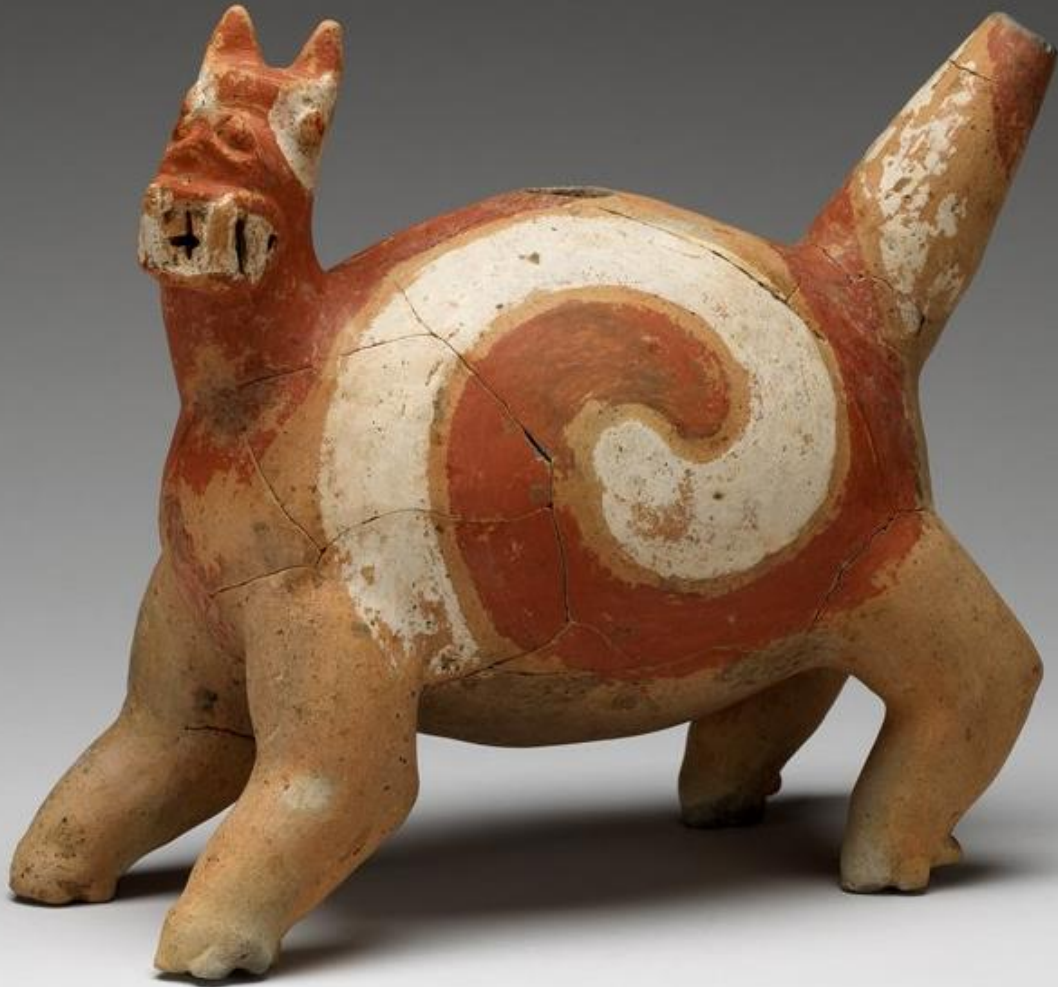
Bear Effigy Pot, Casas Grandes culture, c. 1160- 1260, 83.90.1