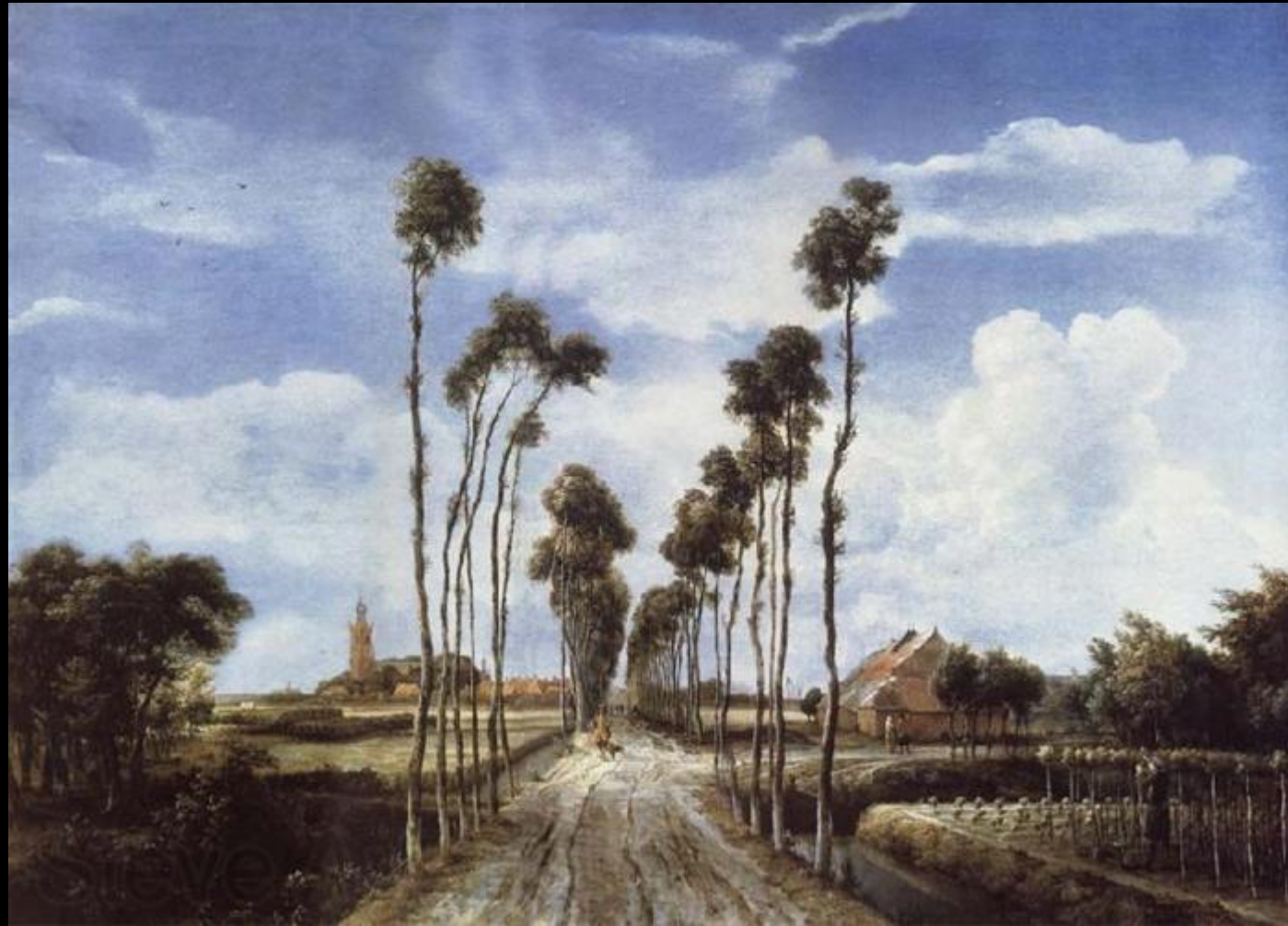
Meyndert Hobbema, The Avenue, Middelharnis , 1689, oil on canvas, National gallery, London