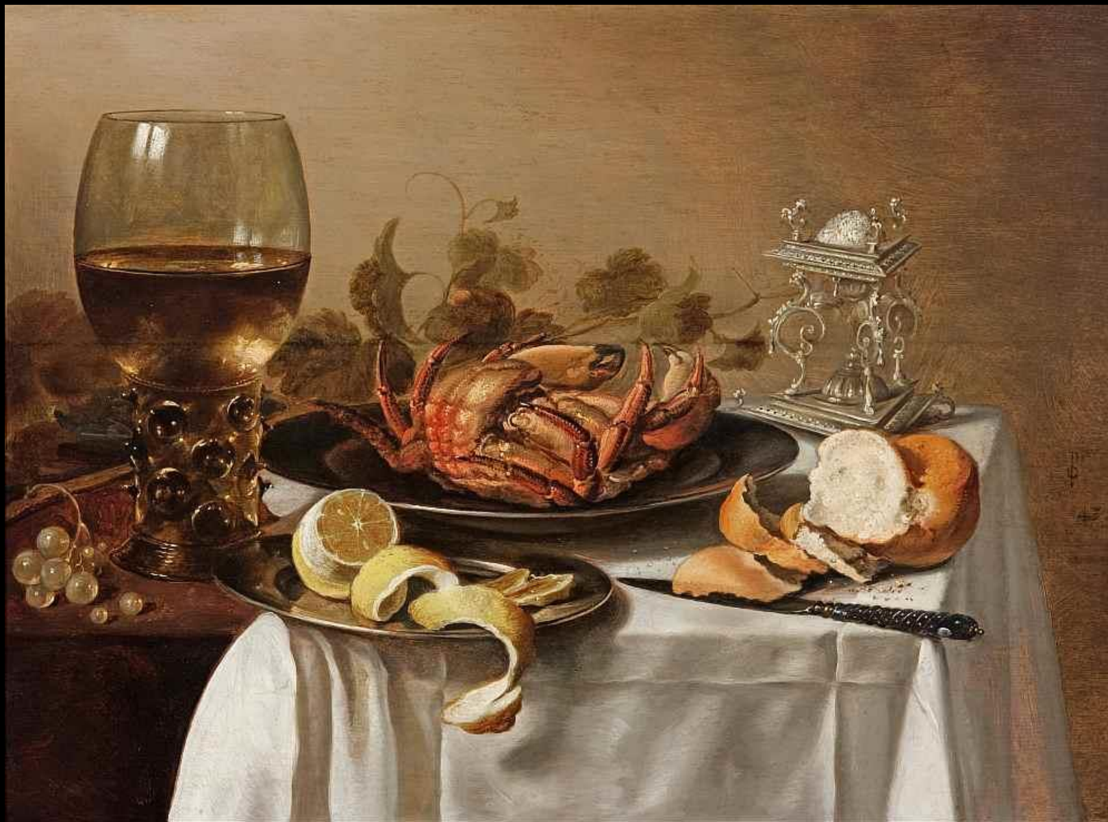
Pieter Claesz, A Still Life with a Roemer, A Crab and a Peeled Lemon , 1643, private collection