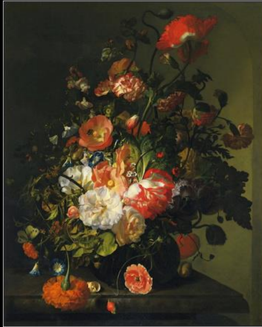
Rachel Ruysch, Flower Still life , after 1700, oil on canvas, The Toledo Museum of Art, Ohio