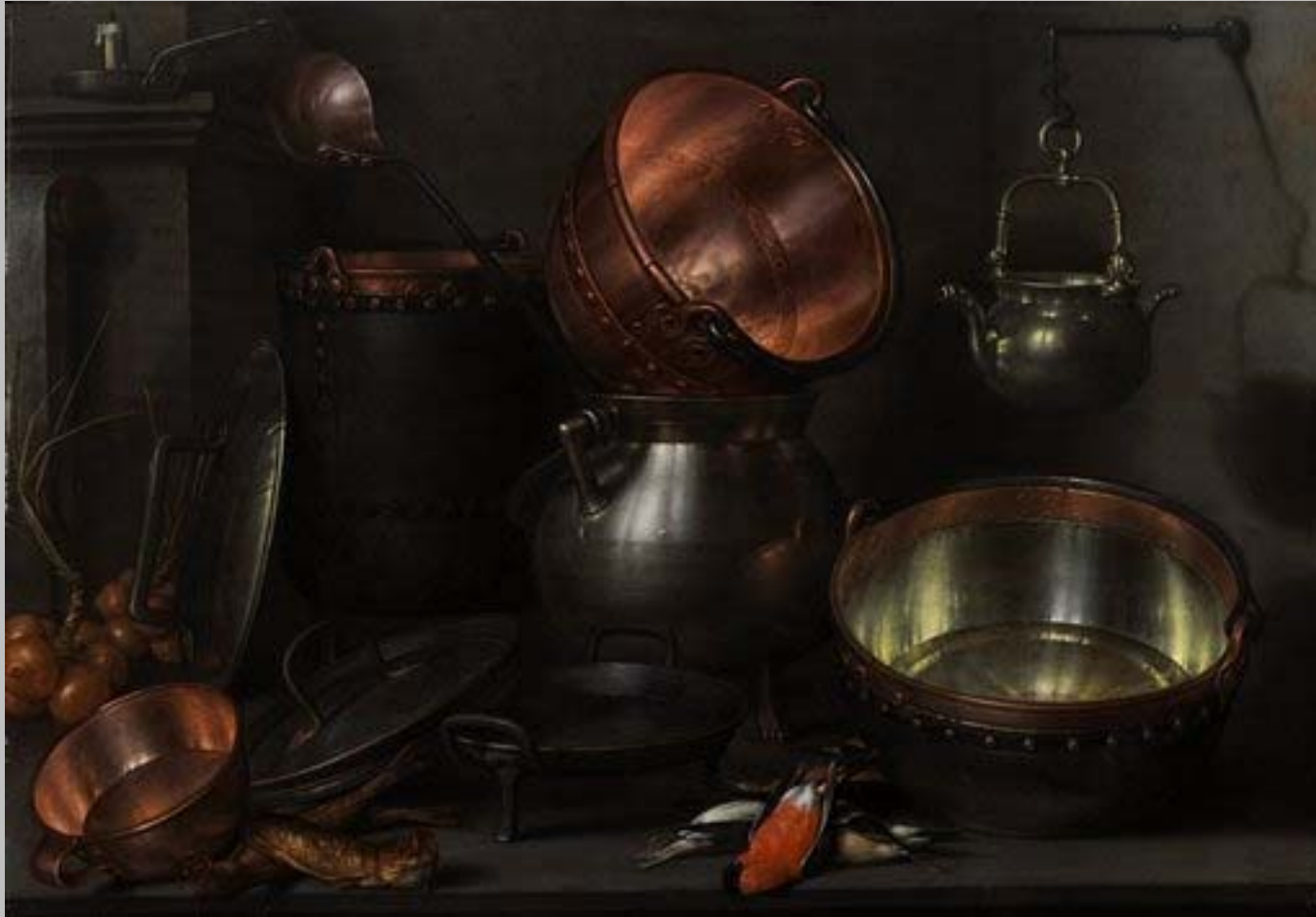
Cornelis Jacobsz Delff, Allegory of the Four Elements, oil on panel, about 1600, 2002.151

Subject matter became specialized and new categories of painting developed – landscape, genre, and still life.