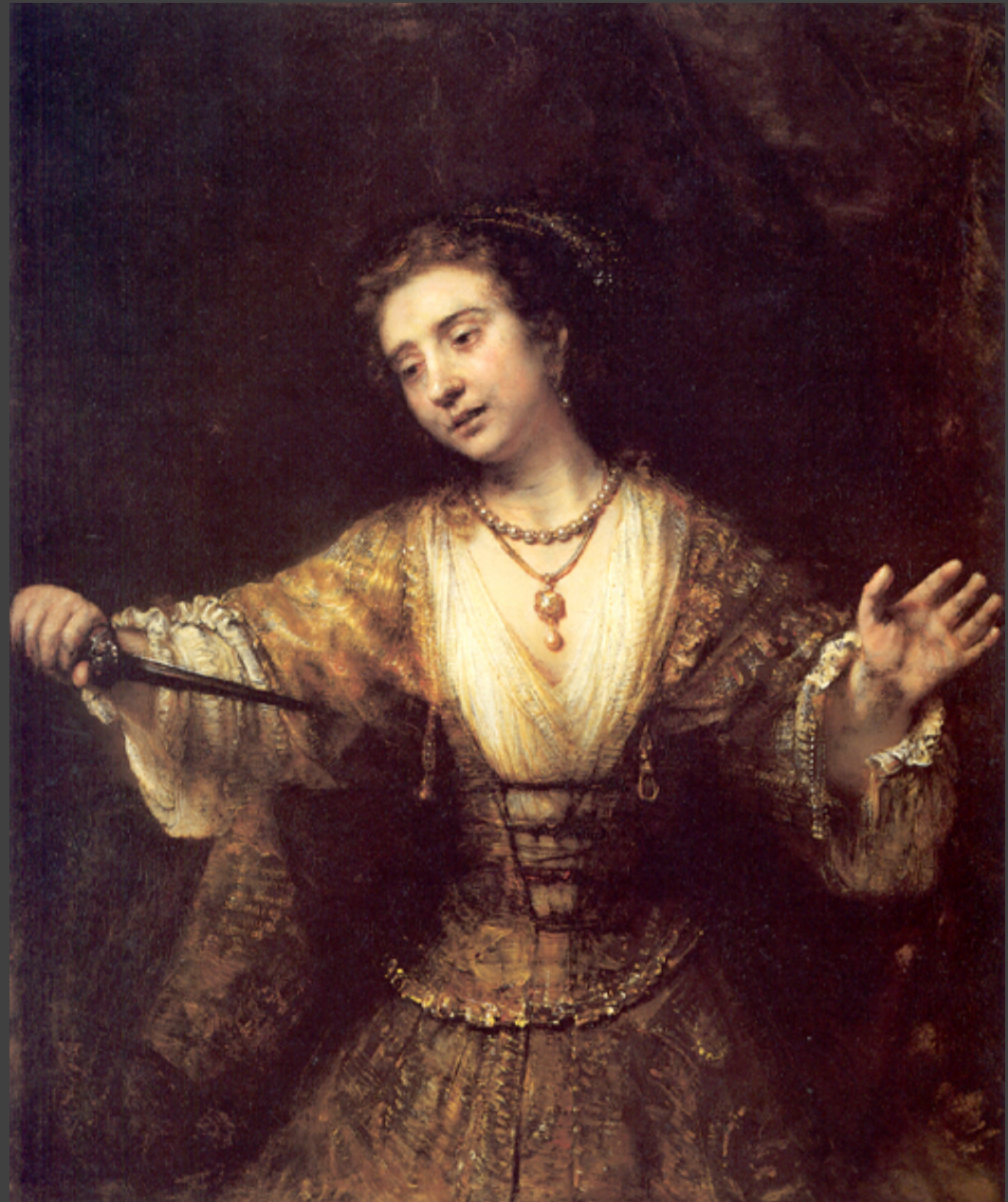
Rembrandt van Rijn, Lucretia , 1664, oil on canvas, National Gallery of Art, Washington