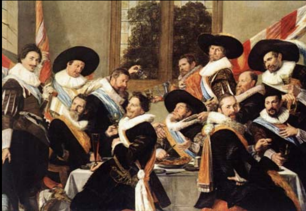
Frans Hals, Officers of the Haarlem Militia Company of Saint Adrian , Dutch, 1627