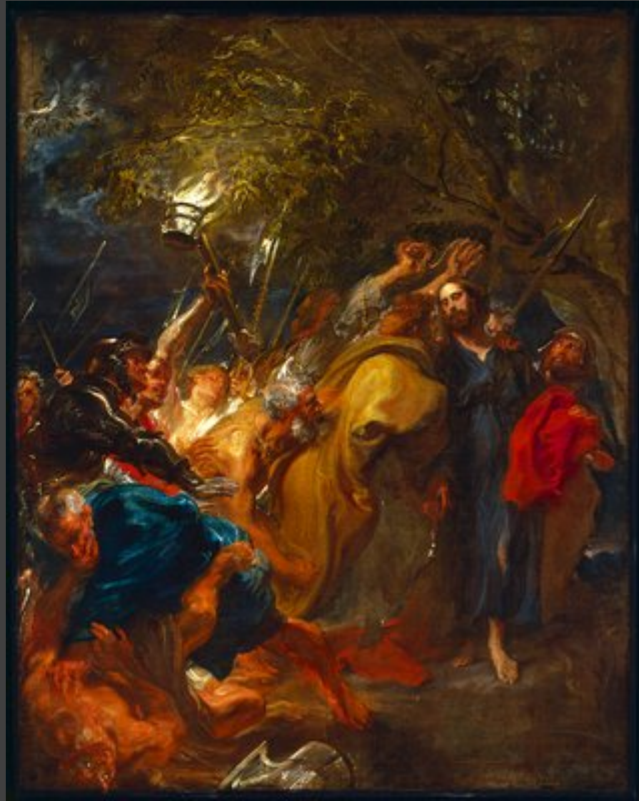
Anthony van Dyck, The Betrayal of Christ , about 1618-20