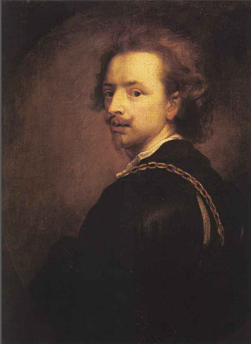
Anthony Van Dyck, Self portrait , 1630, oil on canvas, Galleria degli Uffizi, Florence