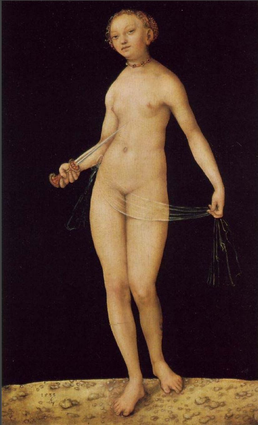
Lucas Cranach the Elder. Lucretia , 1533, oil on panel, Staatliche Museum, Berlin