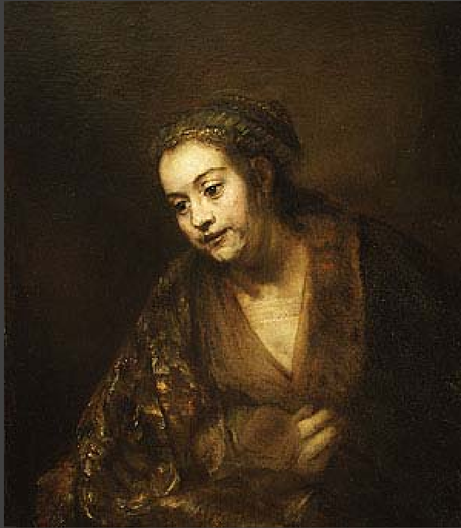
Rembrandt, Hedrickje Stoffels , 1660