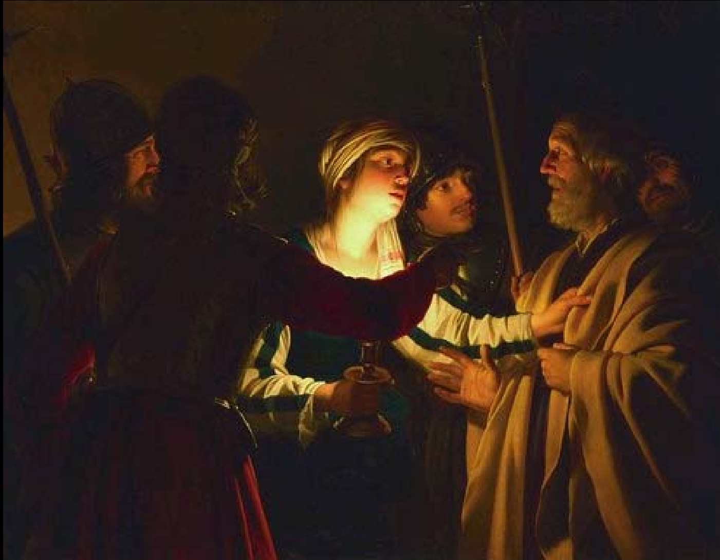
Gerrit van Honthorst, The Denial of Saint Peter , (Utrecht), about 1620-25