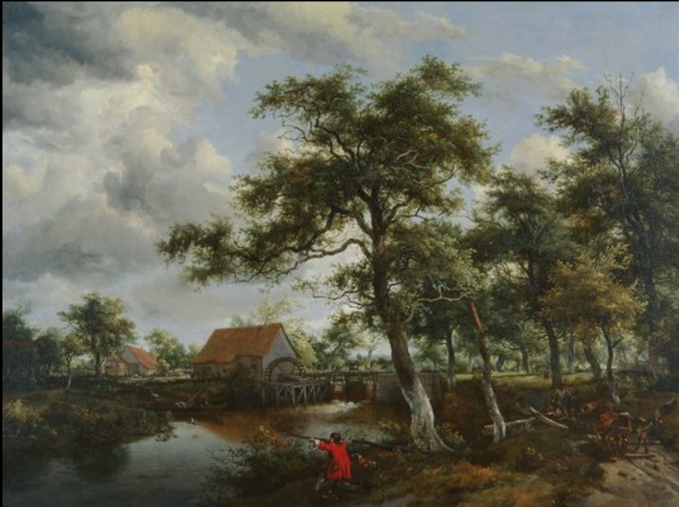
Meindert Hobbema, Wooded Landscape with Water Mill , Amsterdam, about 1750