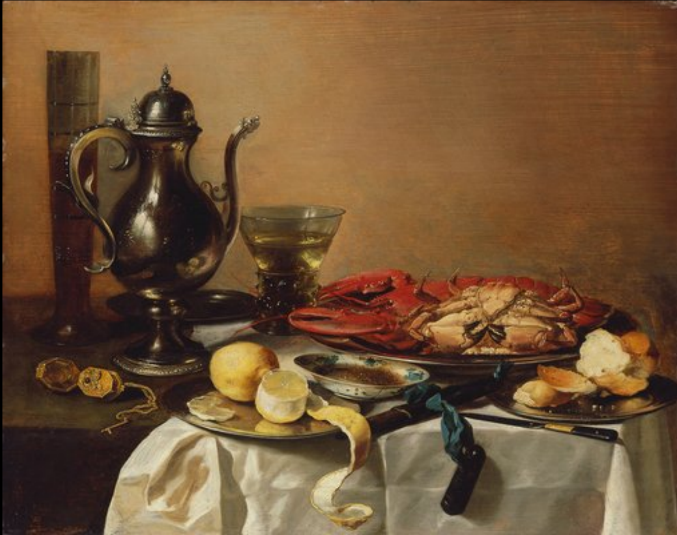
Pieter Claesz, Still Life , 1643