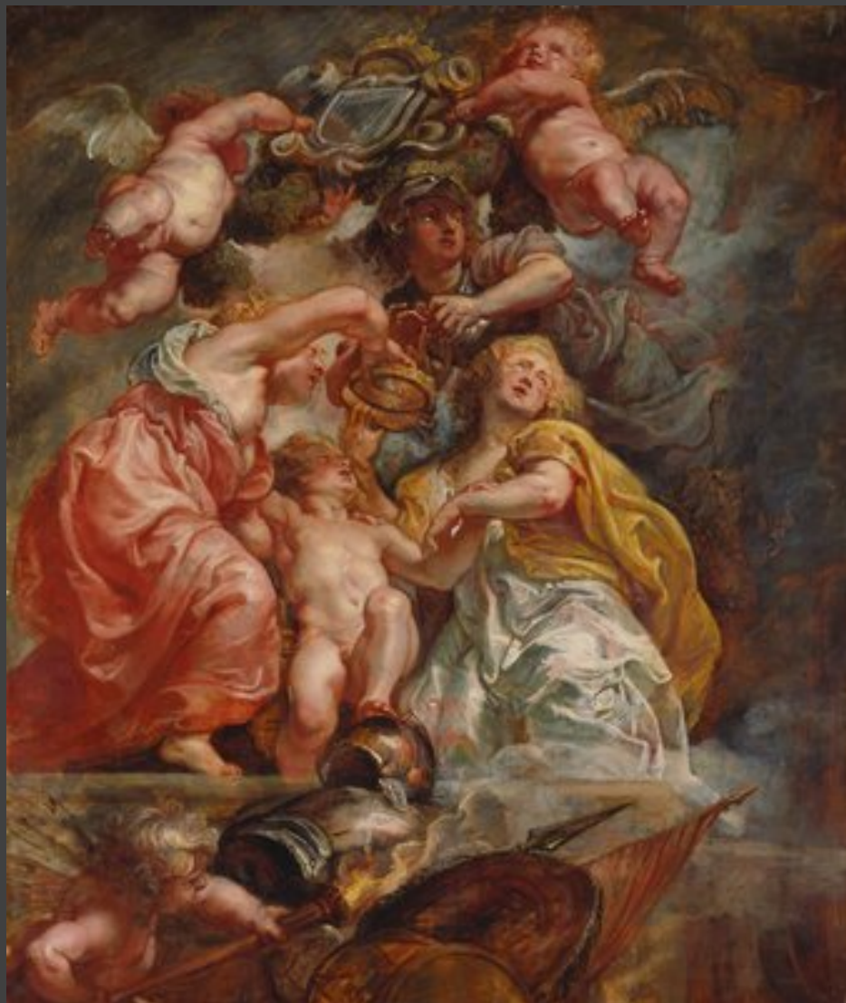
Peter Paul Rubens, The Union of England and Scotland , oil sketch, 1630