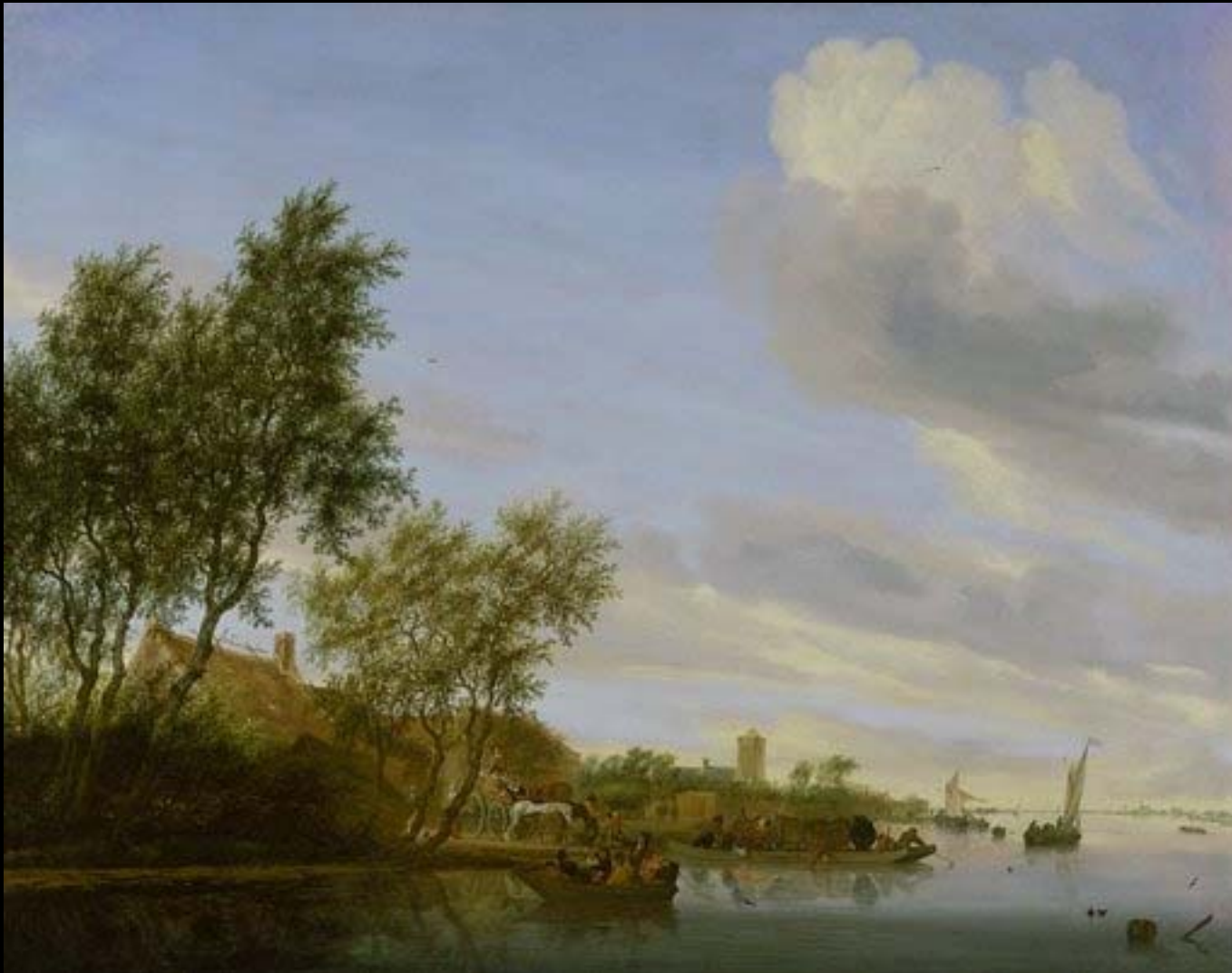
Salomon van Ruysdael, River Landscape with a Ferry, 1656, oil on canvas, 45.9