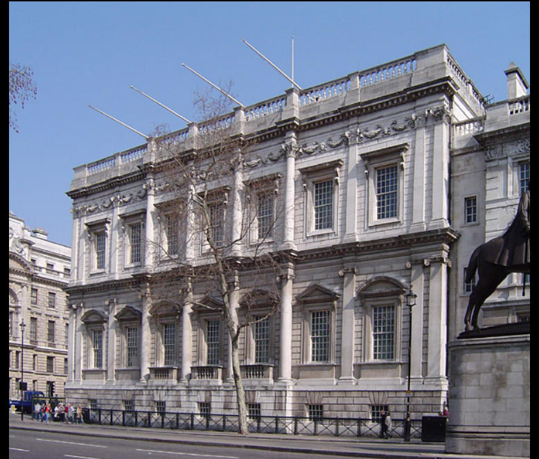
Banqueting Hall, Whitehall Palace, London