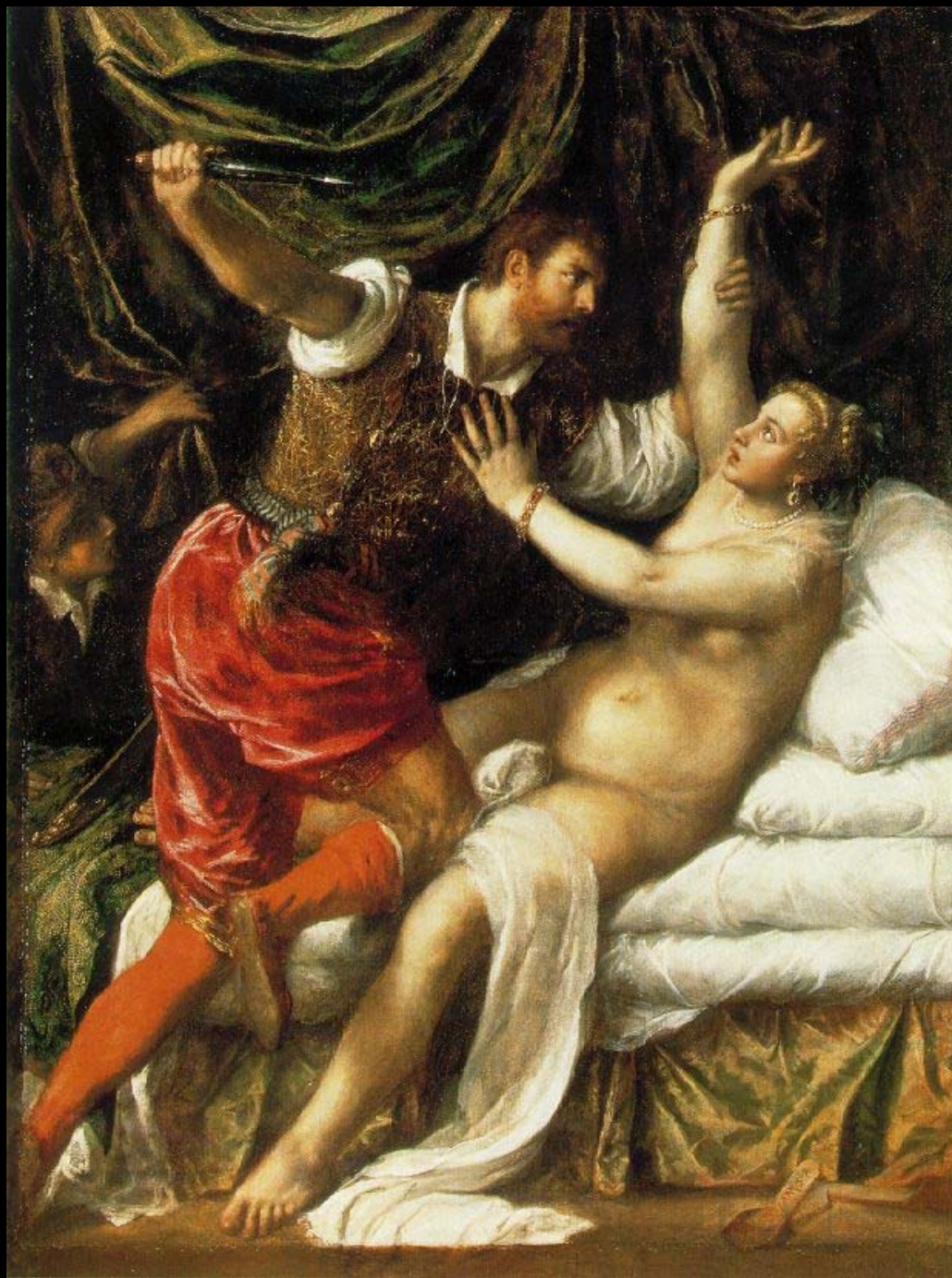
Titian, Tarquin and Lucretia , 1571, oil on canvas, Fitzwilliam Museum, Cambridge