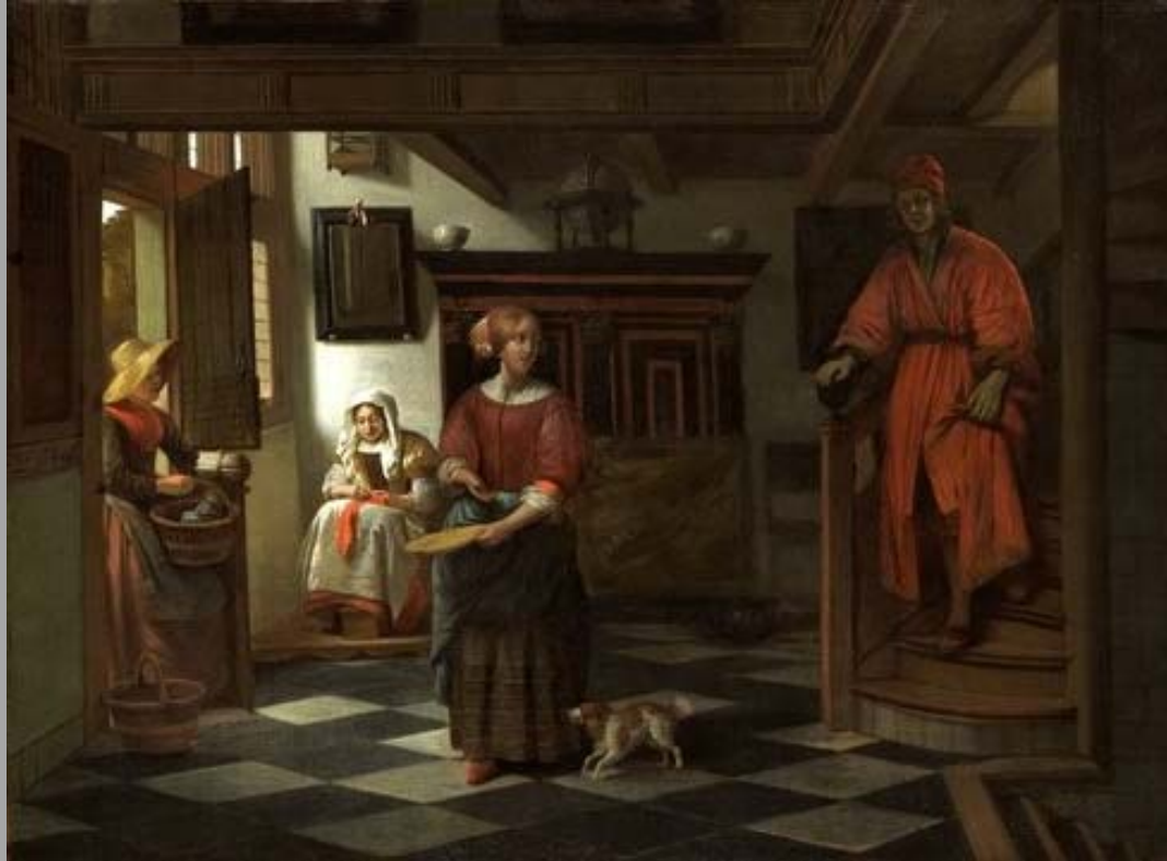
Pieter de Hooch, The Asparagus Vendor , 1675–80, oil on canvas, 82.46

Patronage shifted from the church to Dutch citizens, who delighted in their homes and collected art which reflected their lifestyle, values, and cultural prosperity.