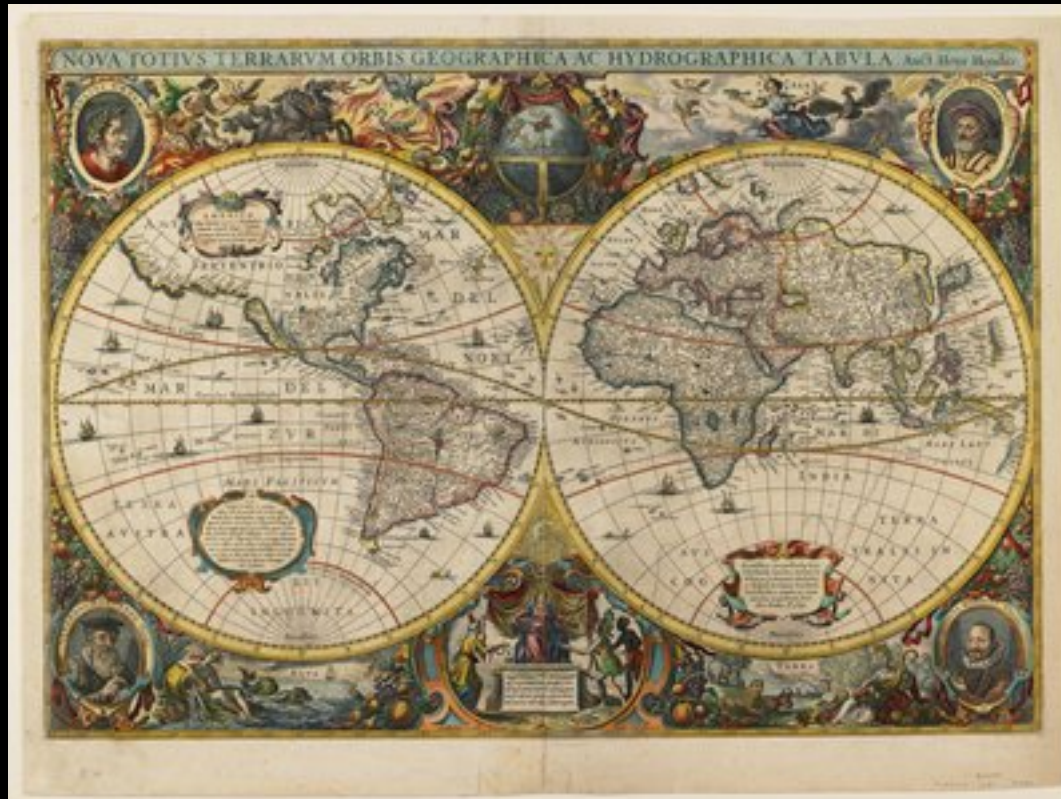
New Map of the World, from Hendrik Hondius and Jan Jansson's "Atlas Novus," Amsterdam, 1641, P.14,612

The 17 th century was the golden age of Holland. As the center of trade and industry it held a position of strength and power.