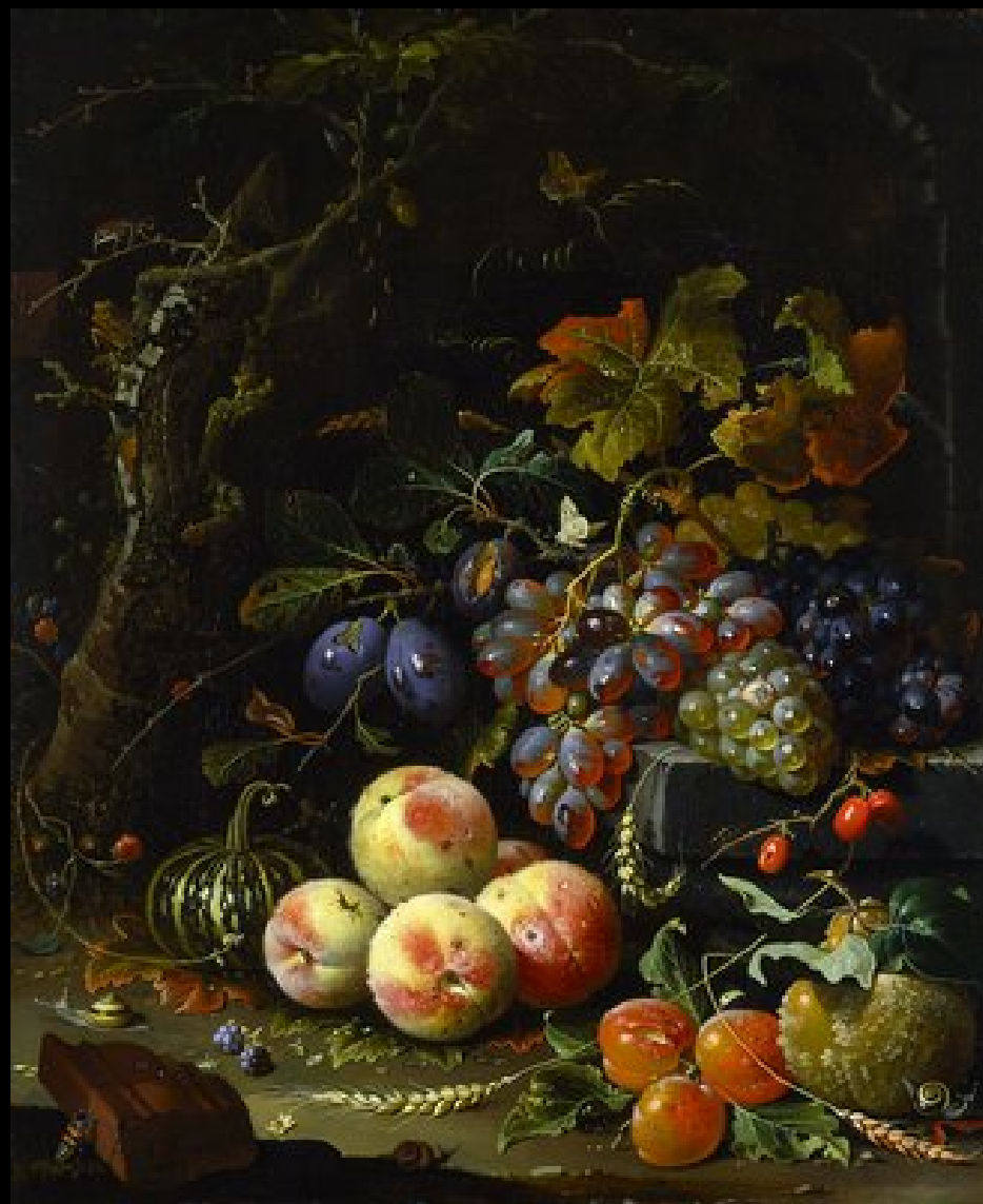
Abraham Mignon, Still Life with Fruit, Foliage and Insects , about 1669