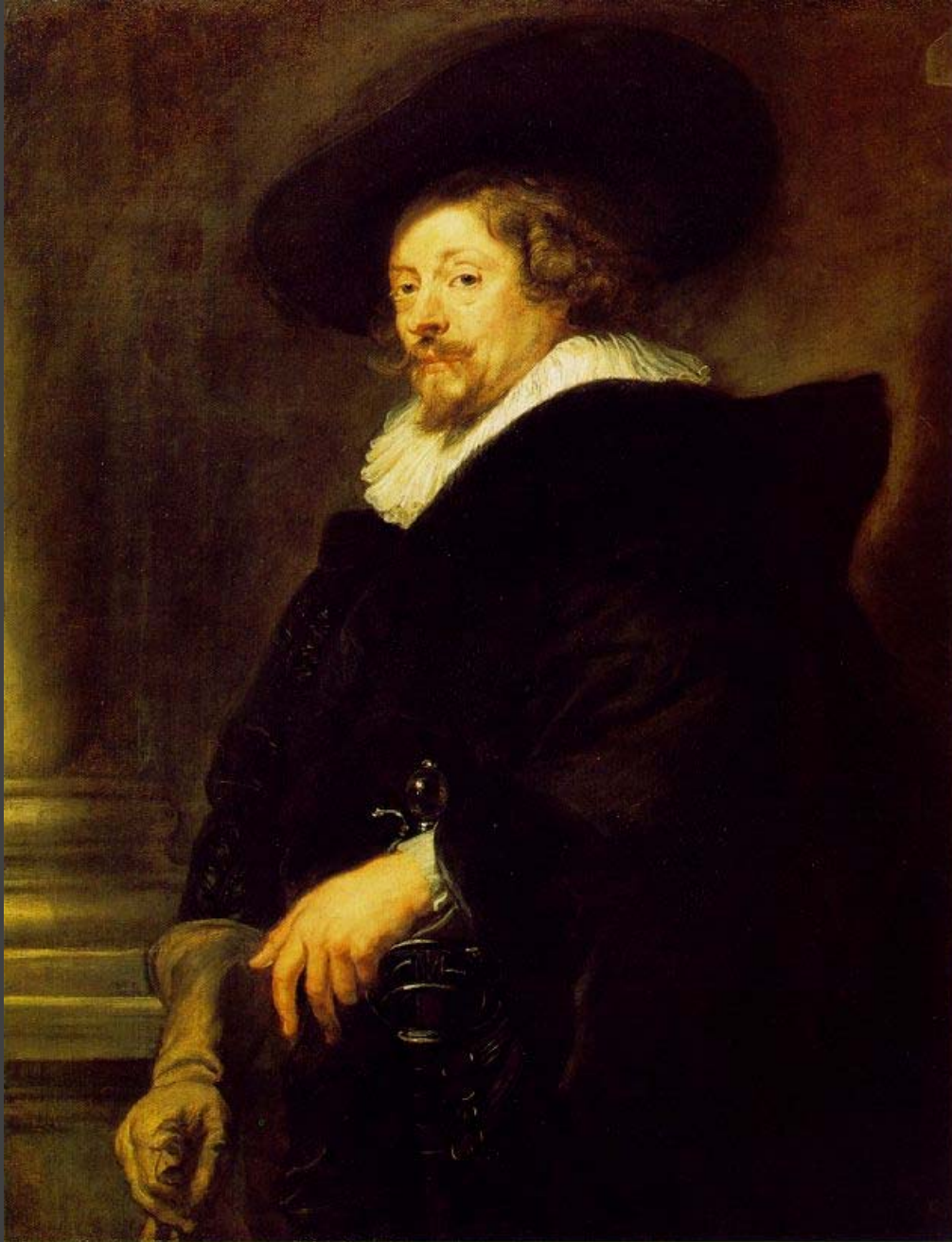
Peter Paul Rubens, Self portrait , c. 1638-40, oil on canvas Kunsthistorisches Museum, Vienna