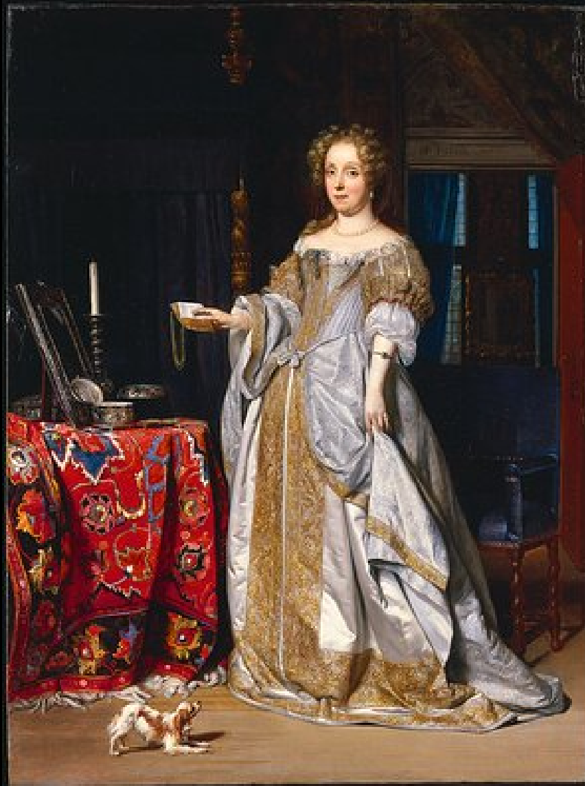
Gabriel Metsu, Portrait of a Lady , 1667