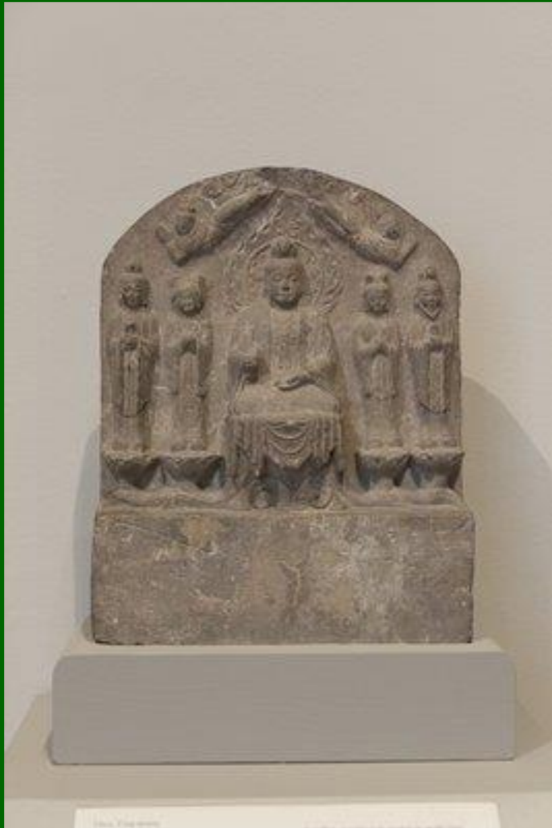
Daoist Stele of Five Deities, 722, 2003.30