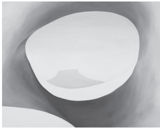
Pedernal—From the Ranch #1 Georgia O'Keeffe