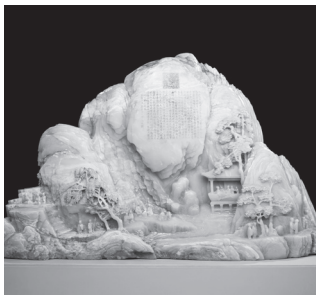
Jade Mountain China