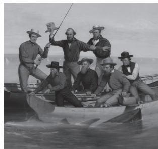
A Fishing Party Off Long Island Junius Brutus Stearns