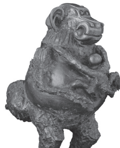
Baboon and Young Pablo Picasso