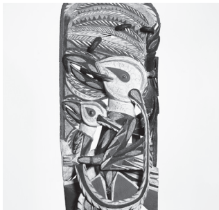
Frieze from a Malagan ceremony Papua New Guinea