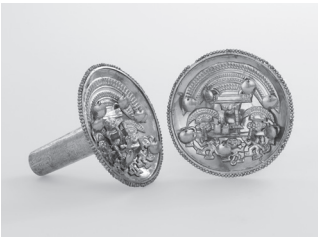
Ear spoons Chimú, Peru