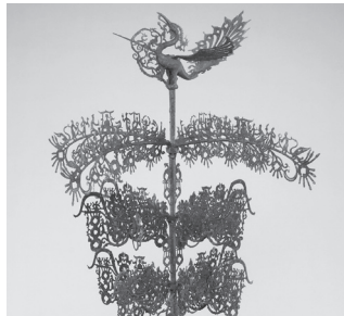
Money tree China