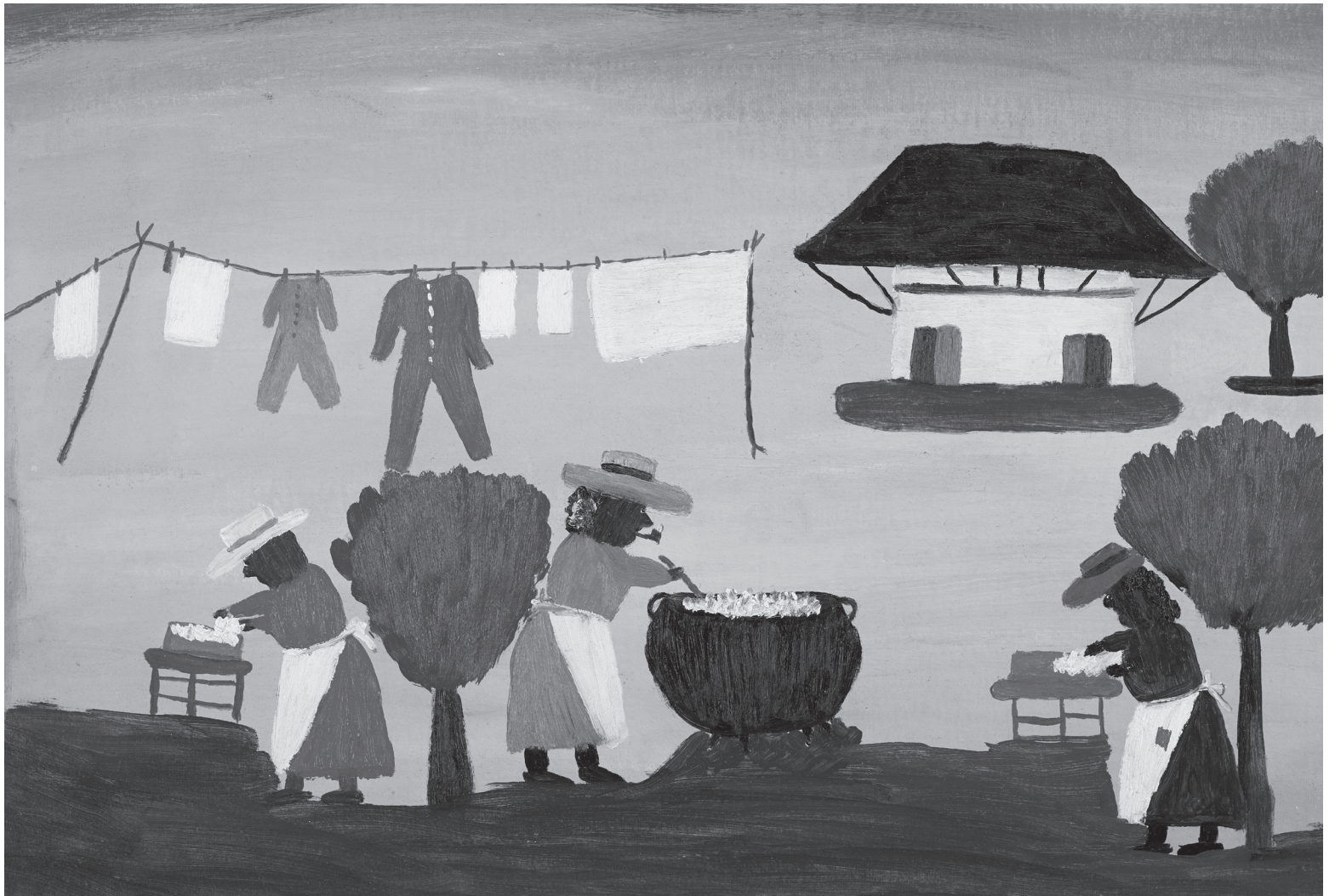
Clementine Hunter, United States, 1885–1988 The Wash , 1950s, oil on board The Ethel Morrison Van Derlip Fund, 91.88.2 18 x 24 in. (45.7 x 61.0 cm)