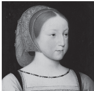
Portrait of Princess Charlotte of France Jean Clouet the Younger