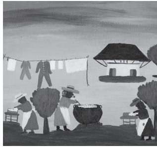
The Wash Clementine Hunter