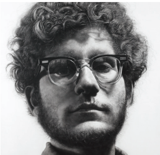
Frank Chuck Close