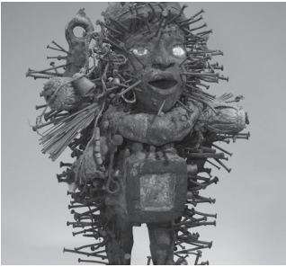
Power figure Kongo, Africa