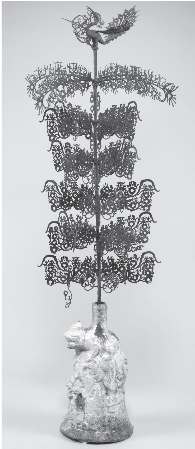
China, Money tree, 1st-2nd century, bronze and green glazed earthenware Gift of Ruth and Bruce Dayton, 2002.47a-rrr 58 x 24 ½ x 24 ½ in. (147.3 x 62.2 x 62.2 cm)