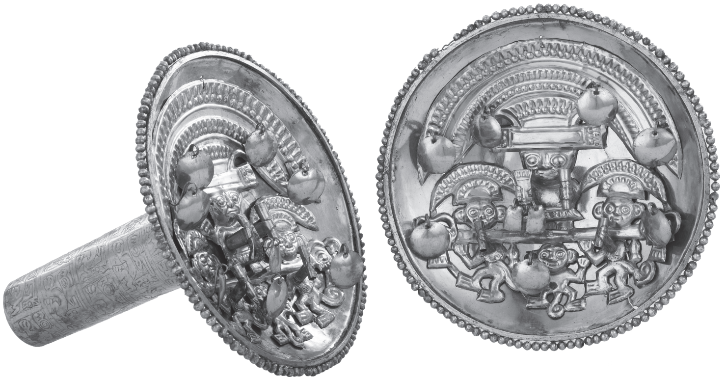
Chimú, Peru, South America Ear spools, 1150-1450, gold alloy The William Hood Dunwoody Fund, 43.4.1 5 3/8 x 5 in. (13.65 x 12.7 cm)