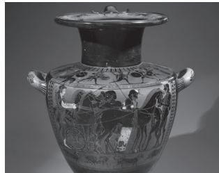
Hydria Antimenes Painter Greece