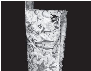
Cradle board cover Dakota United States