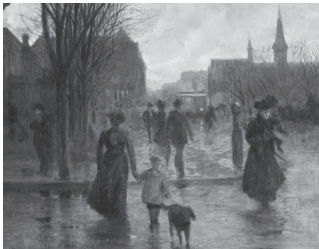
Rainy Evening on Hennepin Avenue Robert Koehler