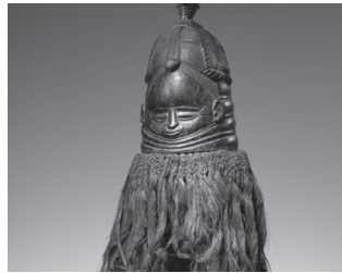
Sande Society mask Mende, Sierra Leone