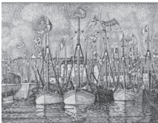
Blessing of the Tuna Fleet at Groix Paul Signac