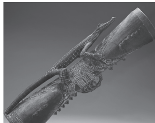
Hand drum ( Kundu ) Iatmul, Papua New Guinea