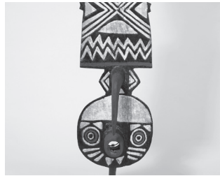
Plank mask Bwa, Burkina Faso