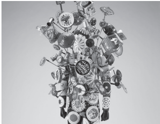
Soundsuit Nick Cave