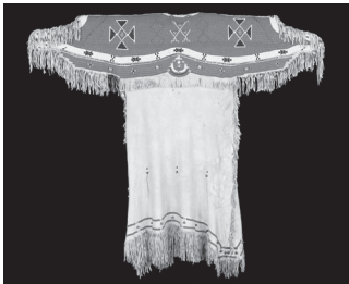
Woman's dress Lakota