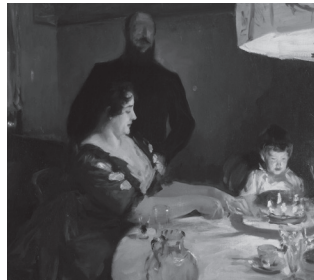
The Birthday Party John Singer Sargent