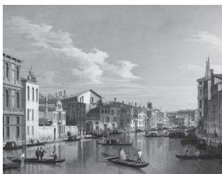
The Grand Canal in Venice from Palazzo Flangini to Campo San Marcuola Giovanni Antonio Canal (Canaletto)