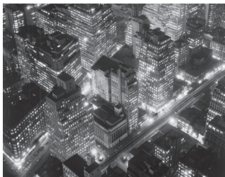
New York at Night Berenice Abbott