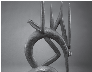
Tyiwara headcrest Bamana (Mali)