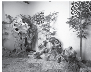
Rock garden China