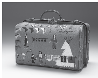
Suitcase Nellie Two Bears Gates