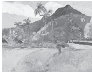
Tahitian Landscape Paul Gauguin