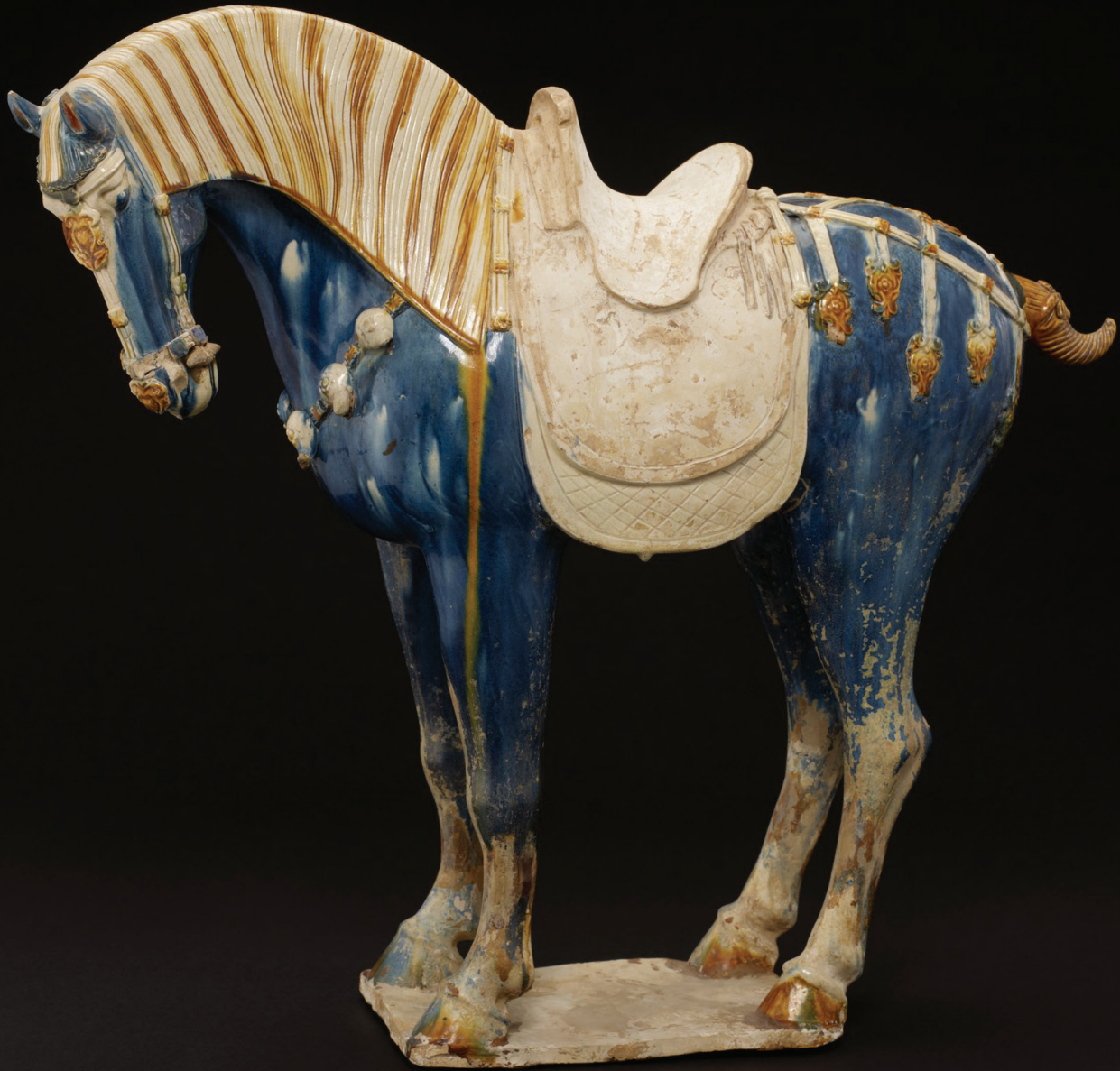
China, Asia Horse, 8th century, earthenware with polychrome glaze The Ethel Morrison Van Derlip Fund, 49.1.6 20 ½ x 20 ¼ in. (52.07 x 51.44 cm)