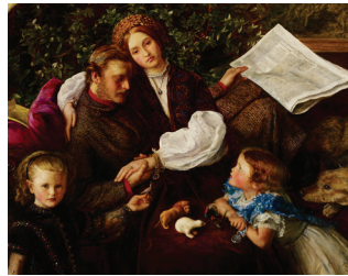
Peace Concluded Sir John Everett Millais