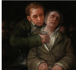
Self-portrait with Dr. Arrieta Francisco Goya