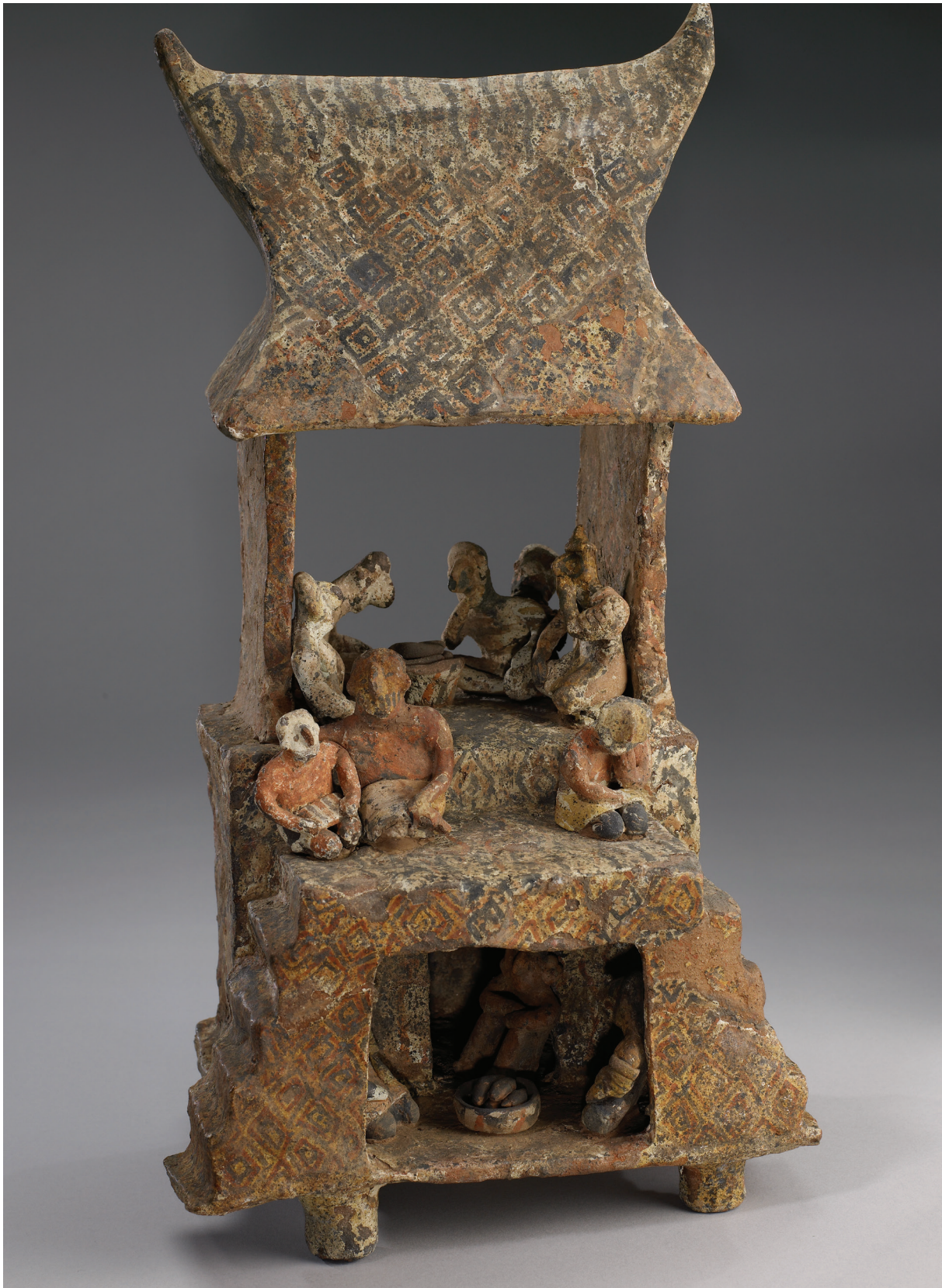
Nayarit, Mexico, Central America House group, 100–400 CE, clay, pigments The John R. Van Derlip Fund, 47.2.37 18 x 9 ¾ x 7 in. (45.7 x 24.8 x 17.8 cm)