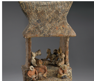
House group Nayarit, Mexico