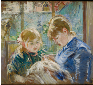
The Artist's Daughter, Julie, with Her Nanny Berthe Morisot