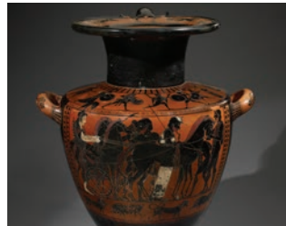
Hydria Antimenes Painter Greece