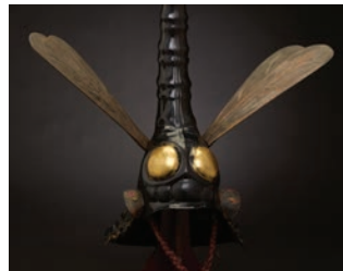
Helmet in dragonfly shape Japan