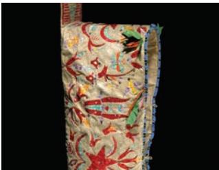
Cradle board cover Dakota United States