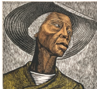
Sharecropper Elizabeth Catlett