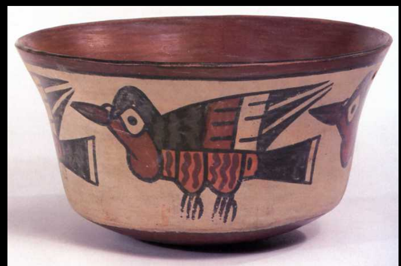
Nasca ceramic bowl with pre-fire slips and burnished shine Early Intermediate Period, c. 0 – 450 CE