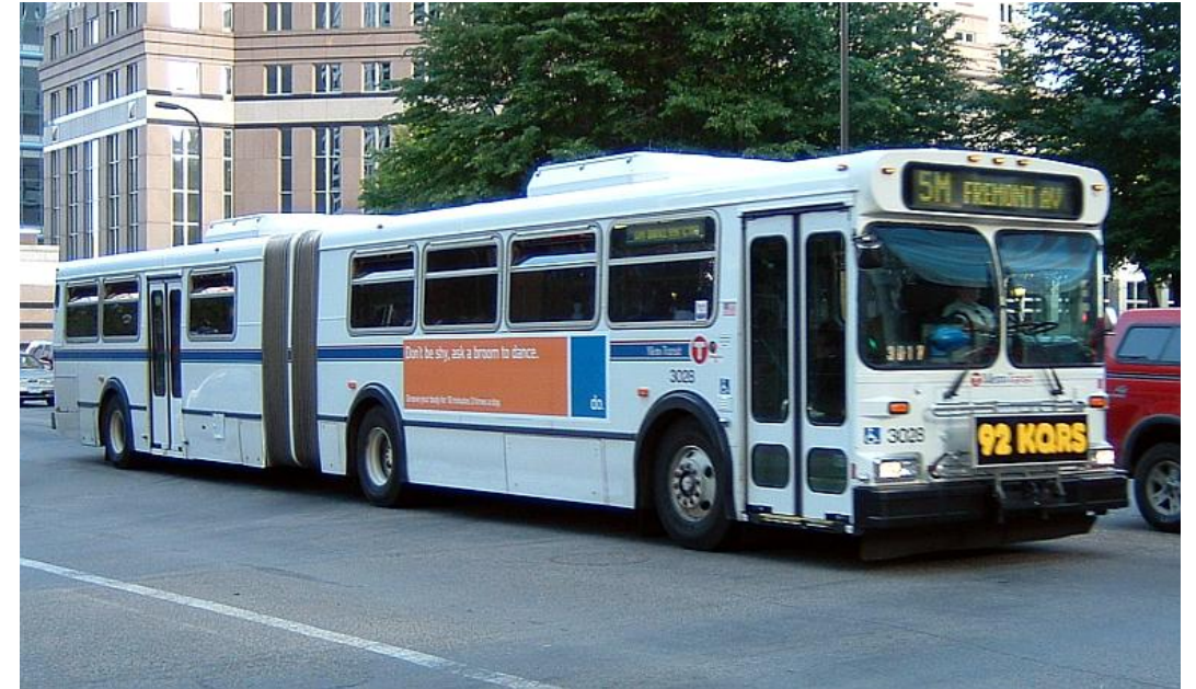
Metro Transit Route #11