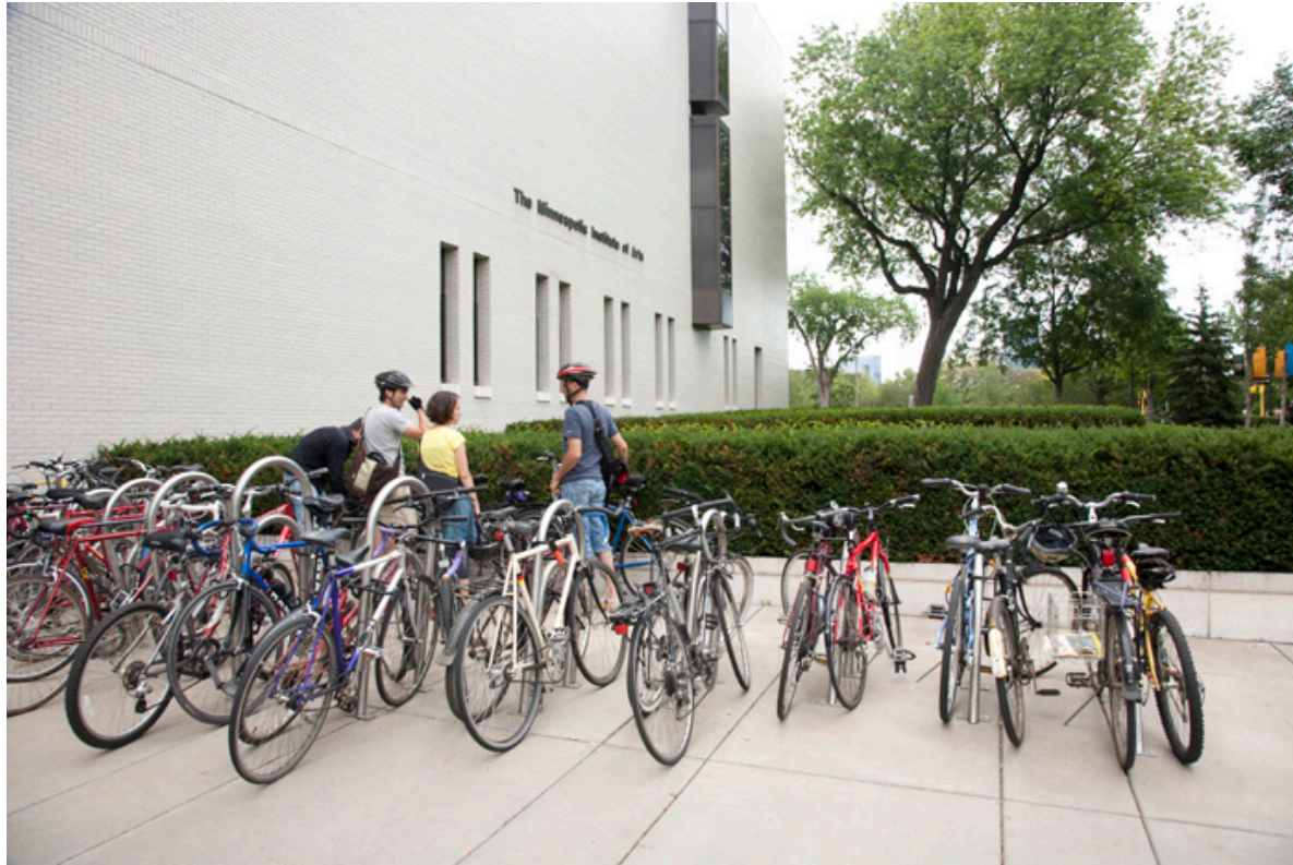
24 th Street and 3rd Avenue