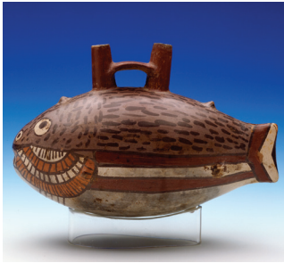
Vessel in the form of a fish Nazca, Peru