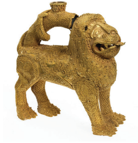
Gold lion statuette Hispano-Moorish Europe