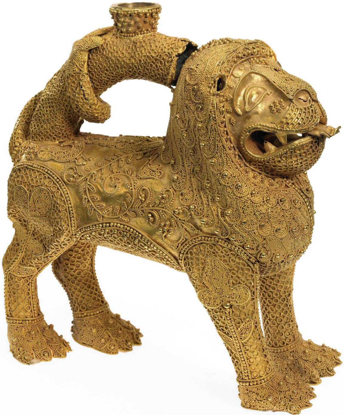
Hispano-Moorish, Europe Statuette, 11th-12th century, gold The Katherine Kettridge McMillan Memorial Fund, 72.12 4 ¾ x 4 x 2in. (12.1 x 10.2 x 5.1cm)