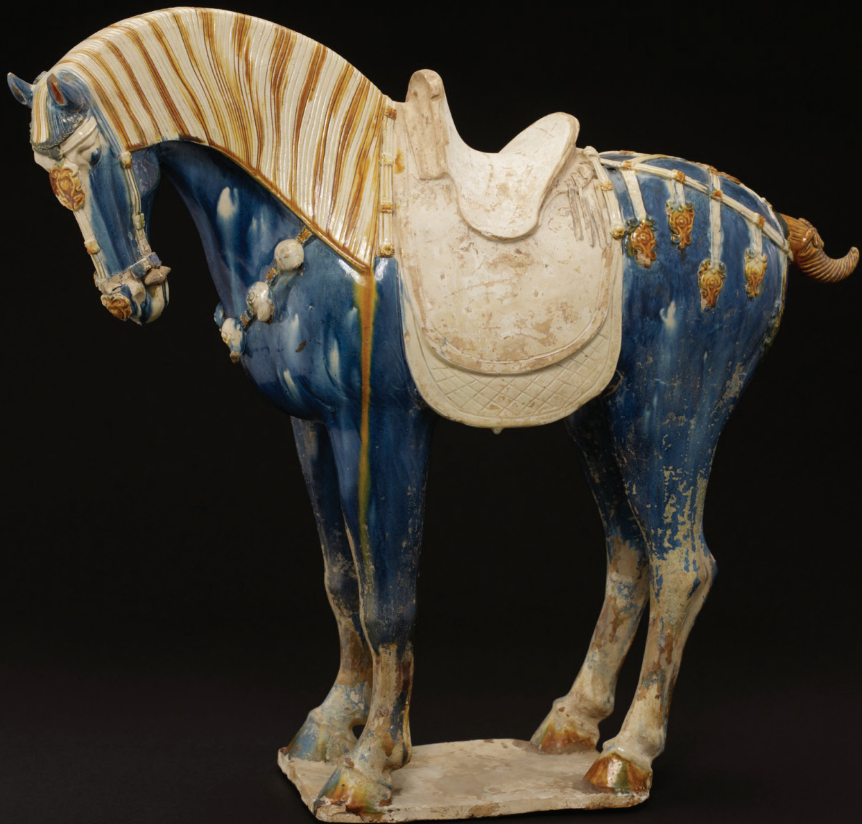
China, Asia Horse, 8th century, earthenware with polychrome glaze The Ethel Morrison Van Derlip Fund, 49.1.6 20 ½ x 20 ¼ in. (52.07 x 51.44 cm)