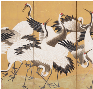
Flock of Cranes Ishida Yūtei