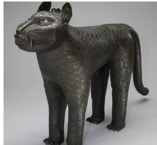
Water pitcher in the form of a leopard Edo, Nigeria