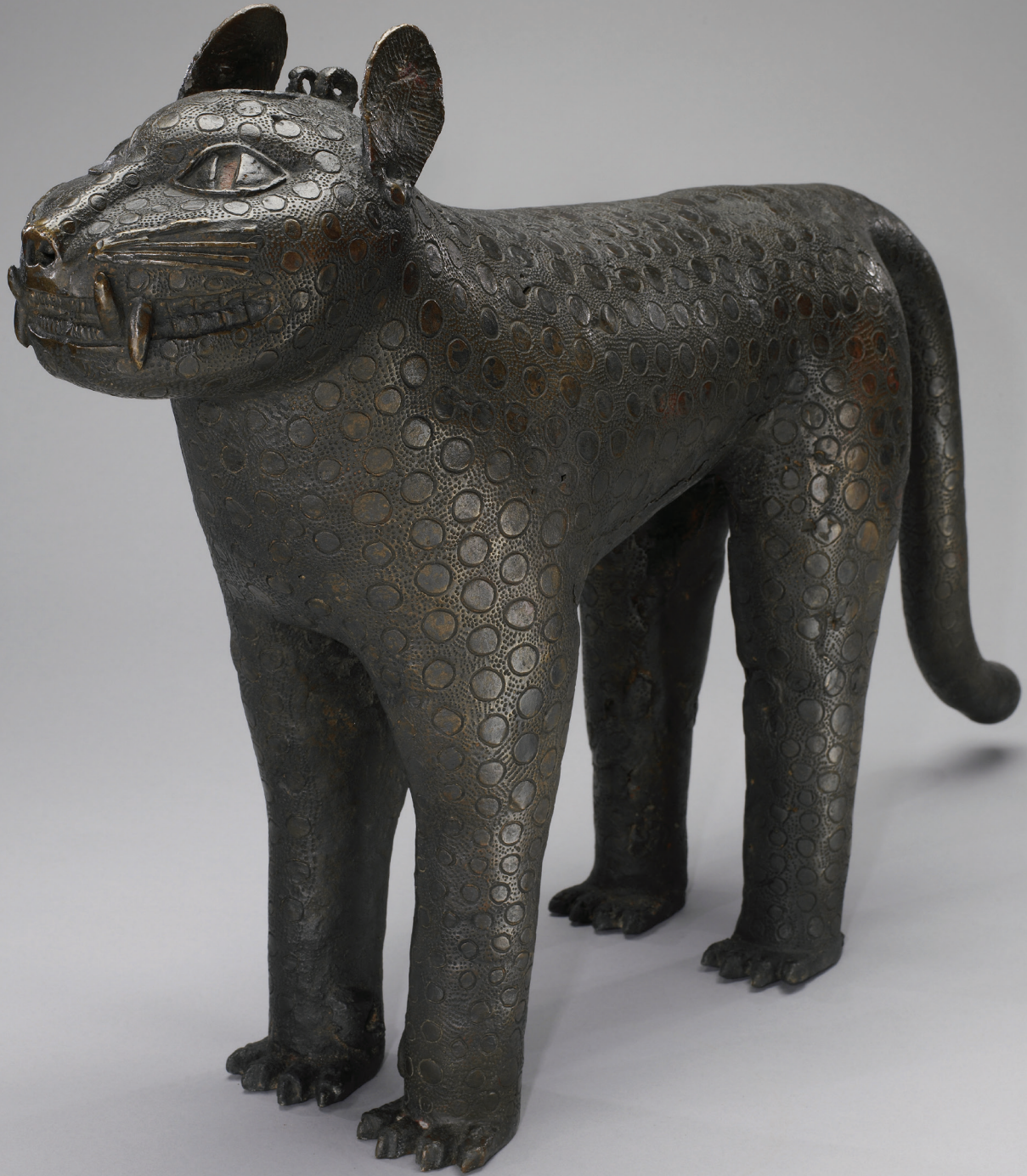
Edo, Nigeria, Africa Leopard water pitcher, 18th century, bronze The Miscellaneous Works of Art Purchase Fund, 58.9 17 x 26 in. (43.18 x 66.04 cm)