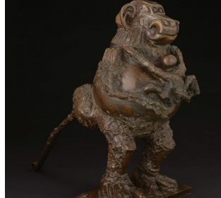
Baboon and Young Pablo Picasso