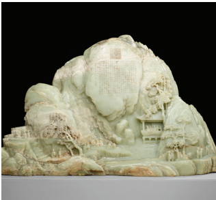
Jade Mountain China