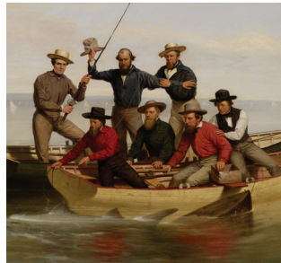
A Fishing Party Off Long Island Junius Brutus Stearns