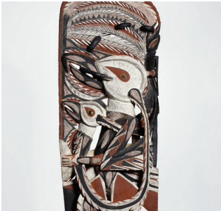
Frieze from a Malagan ceremony Papua New Guinea