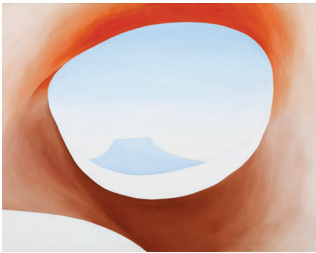
Pedernal—From the Ranch #1 Georgia O'Keeffe