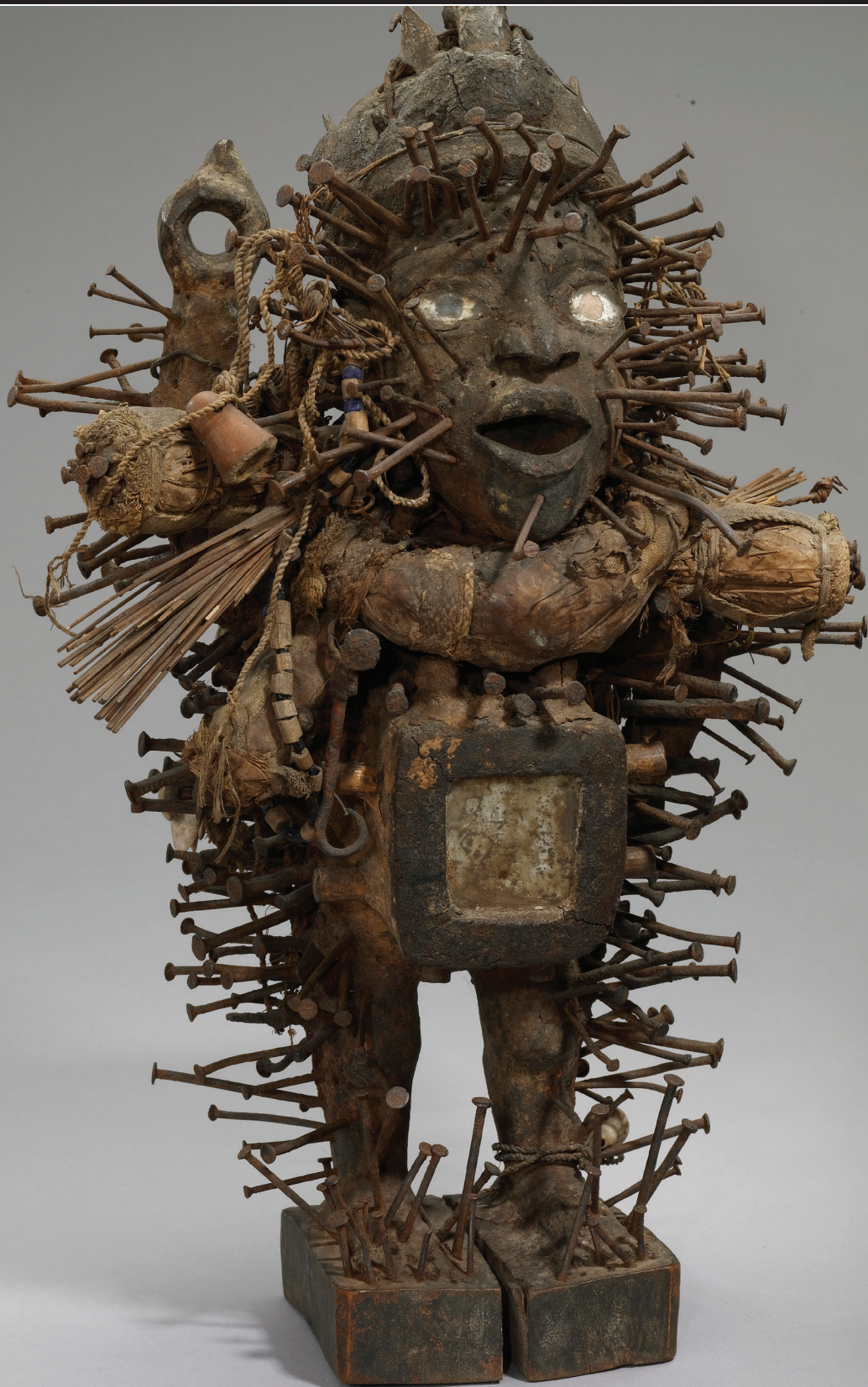
Kongo, Democratic Republic of Congo, Africa Power figure, 20th century, wood, natural fibers, glass, metal, undetermined materials The Christina N. and Swan J. Turnblad Memorial Fund, 71.3 15 3/4 x 9 3/4 x 7 1/4 in. (40.0 x 24.8 x 18.4 cm)