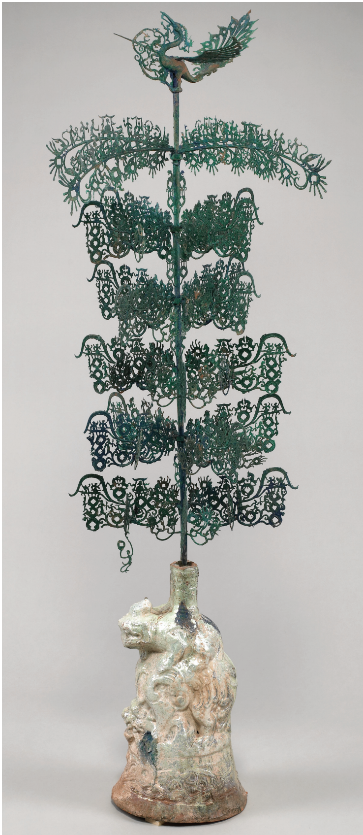
China, Money tree, 1st-2nd century, bronze and green glazed earthenware Gift of Ruth and Bruce Dayton, 2002.47a-rrr 58 x 24 ½ x 24 ½ in. (147.3 x 62.2 x 62.2 cm)