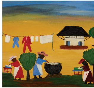
The Wash Clementine Hunter