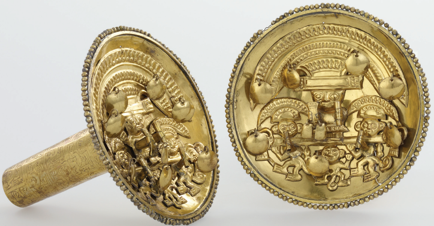
Chimú, Peru, South America Ear spools, 1150-1450, gold alloy The William Hood Dunwoody Fund, 43.4.1 5 3/8 x 5 in. (13.65 x 12.7 cm)