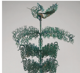
Money tree China