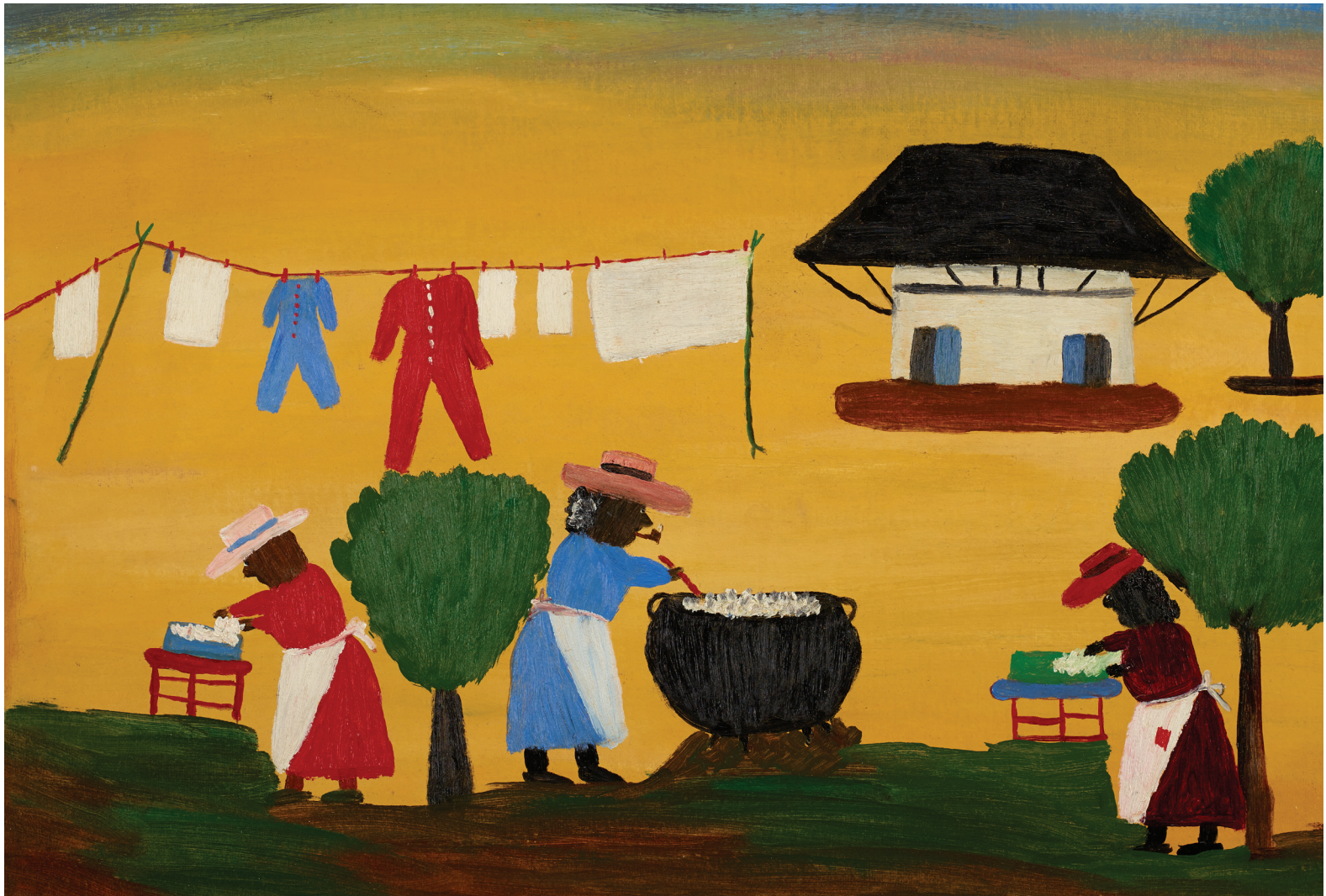
Clementine Hunter, United States, 1885–1988 The Wash , 1950s, oil on board The Ethel Morrison Van Derlip Fund, 91.88.2 18 x 24 in. (45.7 x 61.0 cm)