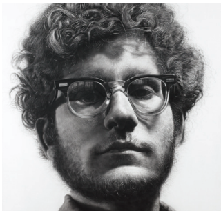
Frank Chuck Close