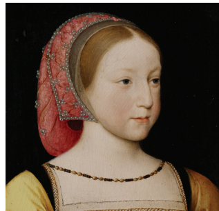
Portrait of Princess Charlotte of France Jean Clouet the Younger