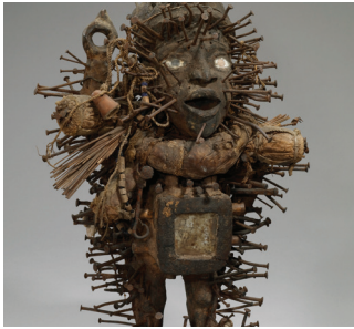
Power figure Kongo, Africa