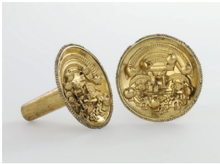
Ear spoons Chimú, Peru