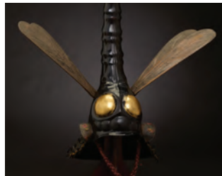
Helmet in dragonfly shape Japan