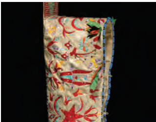
Cradle board cover Dakota United States