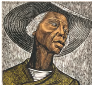
Sharecropper Elizabeth Catlett