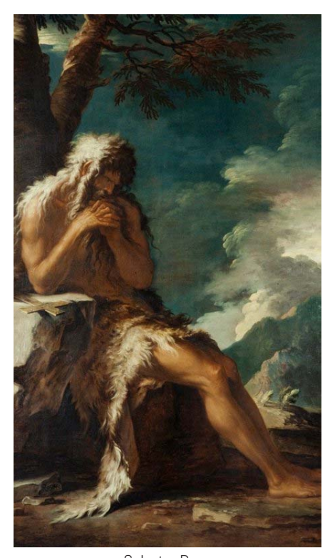
Salvator Rosa Saint Humphrey (Onuphrius), c. 1660 Oil on canvas The John R. Van Derlip Fund 64.2 G330

This beard with its ravines and knobs and peaks? Its pathless woods and oak openings, prairies and cliffs? Its hollows and ponds? Corky white elm trees are in it, and a young eagle eating a blue jay. The nest of a pigeon is in it, cursed crowfoot, shepherd's purse, and spotted frogs hopping, slopping their water along my jaw, and the eyes of a fish perishing in its head. Snakes thick on the hillside and wood ticks are in my beard, a lumberman's shanty and a lumber man in an unbecoming squat. A penciled packing list for the trip: half-thick coat, best pants, compass, writing paper, twine, and spy-glass. A separate scrap of paper giving the different pockets in which I have placed my money, and a meadow in which I sought and finally found the wild apple tree with a long tap-root growing down I declare! into the bluish-green clay of my heart.