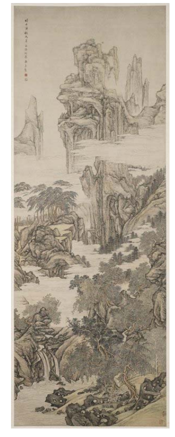
Cai Jia Landscape with Scholar Viewing a Waterfall, 1722 Ink and color on paper Gift Of Ruth And Bruce Dayton 2002.94 G203