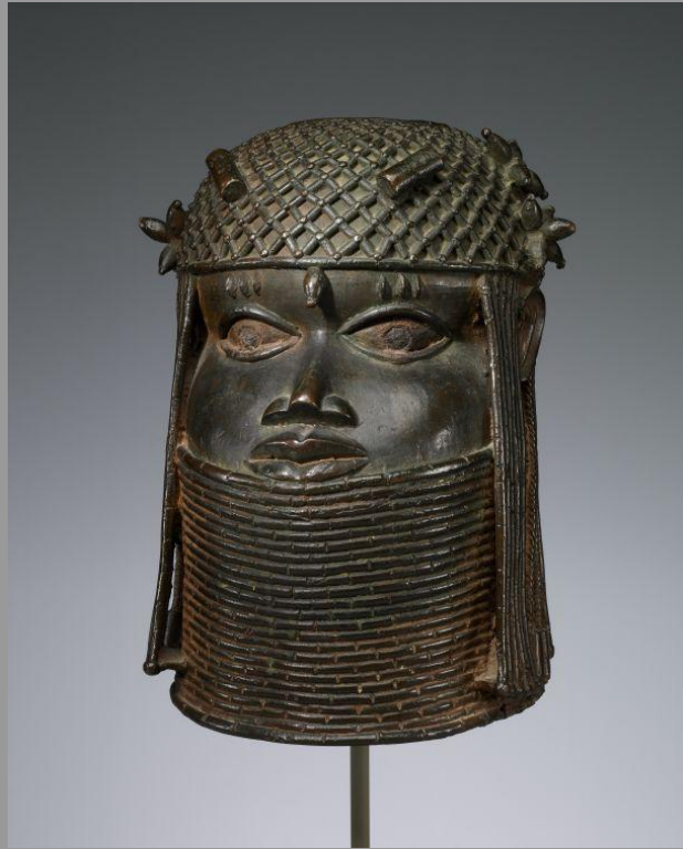
Edo, memorial head, Nigeria, 2017.13