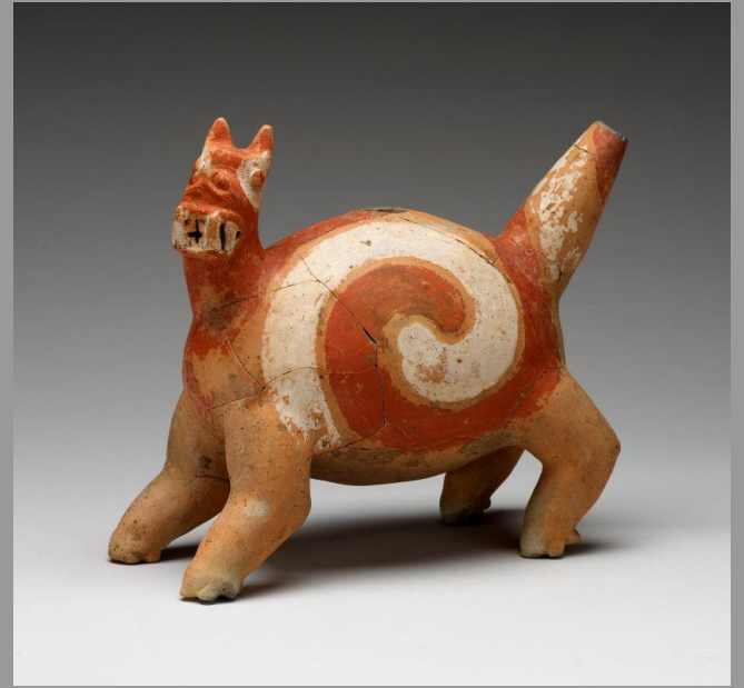
Ugahxpa (Quapaw), Vessel (Underwater Panther), c. 1500