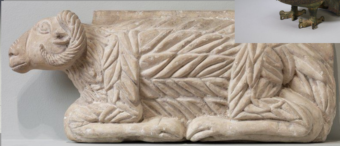
Figure of a ram, 5th century, Graeco-Egyptian, Limestone, 62.53