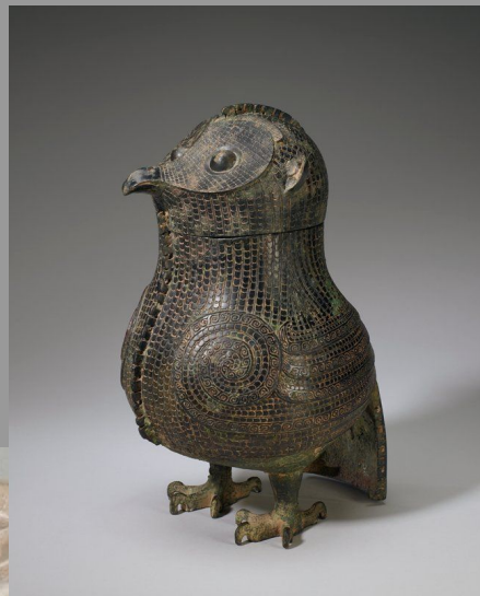
Zun wine vessel in the shape of an owl, 13th-12th century BCE Bronze, 50.46.116