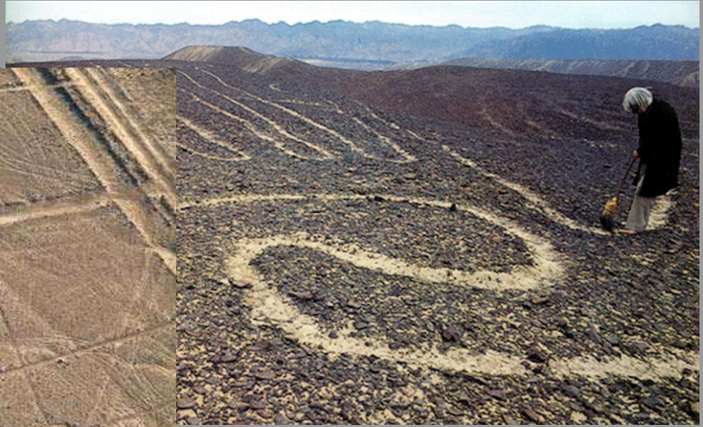
Nazca lines, Peru