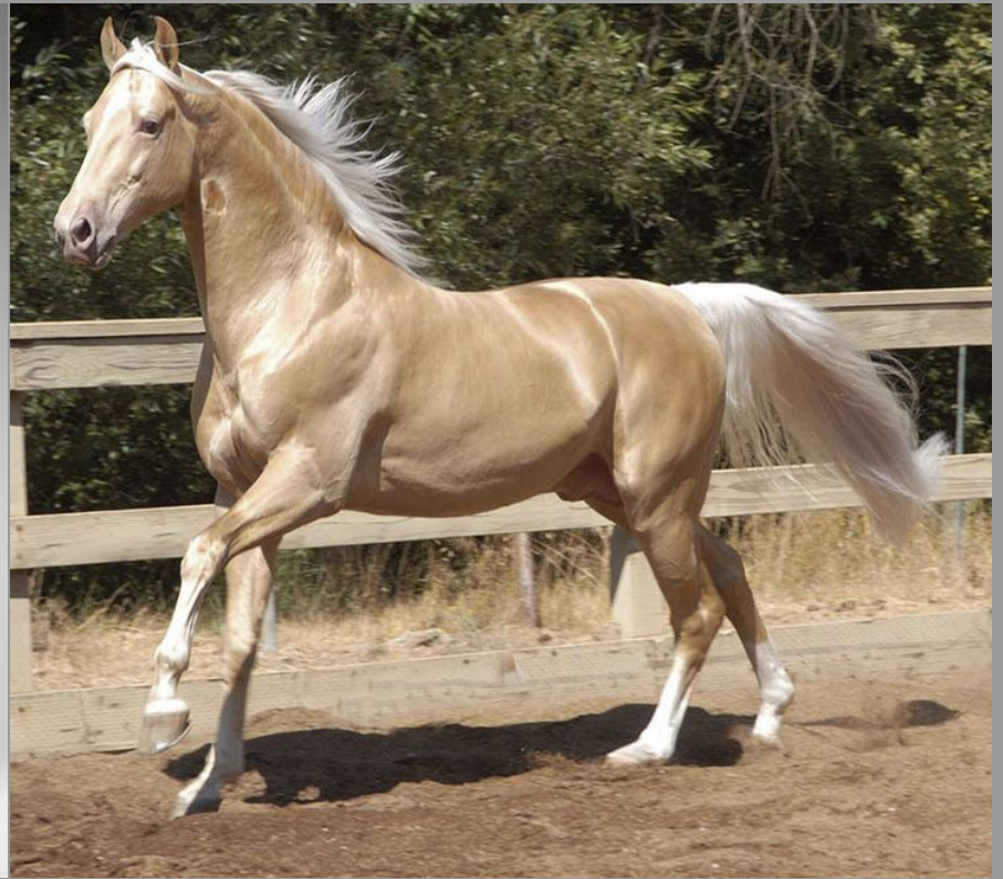
China, Han dynasty, Prancing Horse, 1st-3rd century