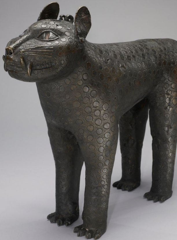
Nigeria, Edo, Benin Kingdom, Leopard, bronze, 18th century