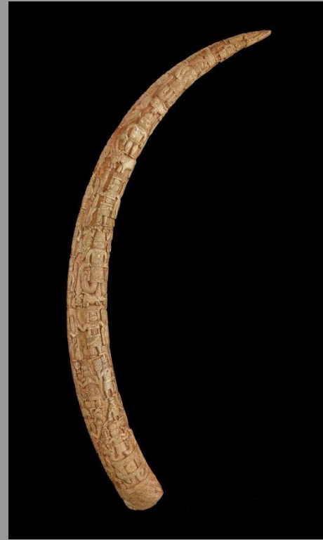
Edo, Tusk, 1775-1777, ivory, 56.33