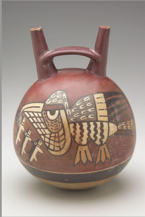
Nazca Double Bridge Spout vessel (Pelican with mythical whales) c.200 BCE - 600 CE