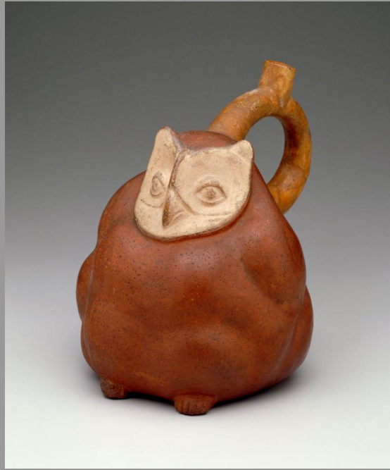
Moche Vessel (Owl), c. 200 BCE - 600 CE,