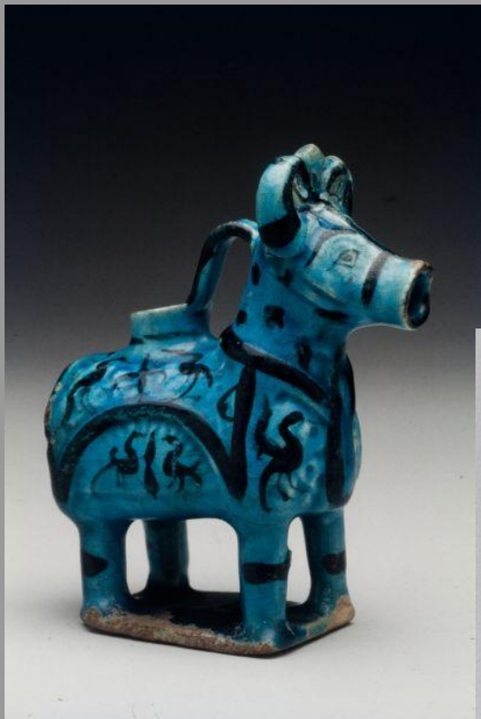
Aquamanile (Ram-shaped Ewer), 13th-14th century, Iran, Kashan ware, 50.46.451