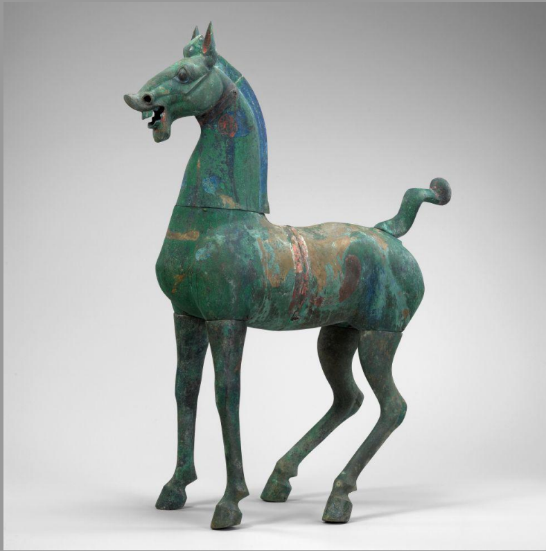
china, Han dynasty, Celestial Horse, 25-220