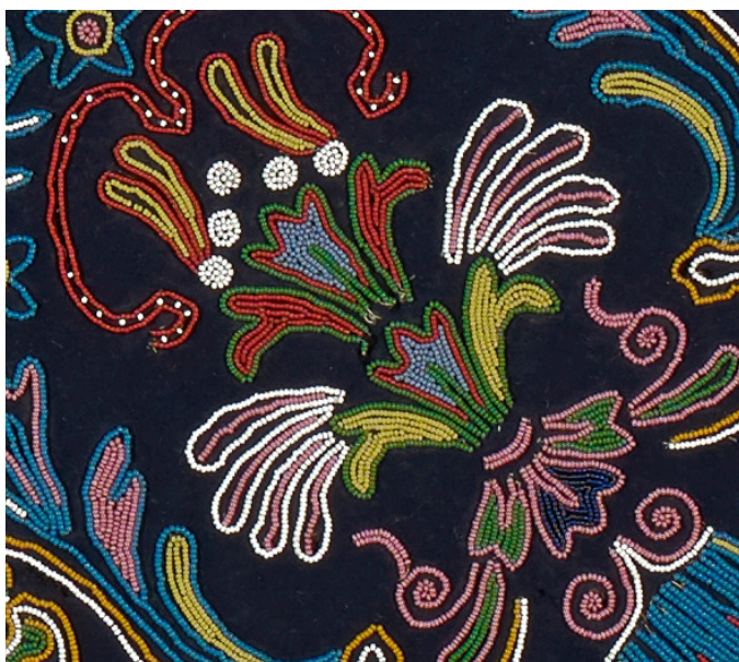
Anishinaabe (Ojibwe) or Dakhóta artists Dance Blanket, c. 1840–50 Anishinaabe (Ojibwe) or Dakhóta artists Wool, silk, beads; needlework 53 × 62 × 7/8 inch (134.622 × 157.48 × 2.22 cm) The Robert J. Ulrich Works of Art Purchase Fund 2007.1