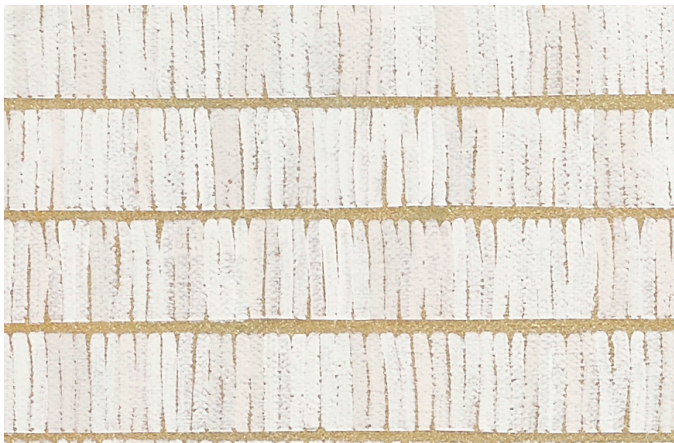
Dyani White Hawk (Sičhánǵu Lakǵóta [Brulé]), b. 1976 Untitled (Quiet Strength I) , 2016 Acrylic on canvas 42 × 42 × 2¼ in. (106.68 × 106.68 × 5.72 cm) Gift of funds from Nivin MacMillan 2016.74