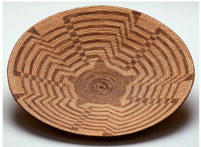
Akimel O'odham (Pima) artist Basket, 19th–20th century Natural plant fibers 3¼ × 16½ in. (8.26 × 41.91 cm) The Ethel Morrison Van Derlip Fund 90.69.4

Compare the designs on the Hohokam bowl with the Pima basket designs. What do they have in common? How are they different?