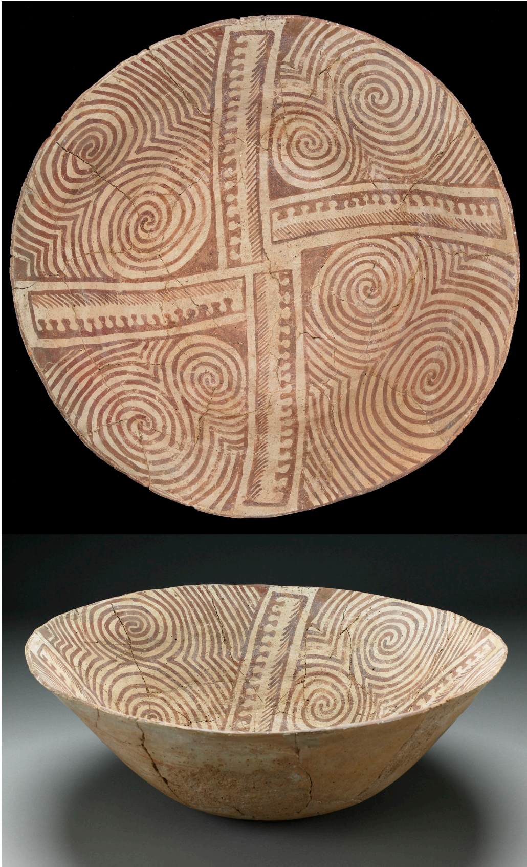
Hohokam artist Bowl, c. 900-1200 Clay and pigments 6 \frac{3}{8} × 18 \frac{3}{4} × 18 \frac{3}{4} in. (16.19 × 47.63 × 47.63 cm) The Director's Discretionary Fund 2004.71