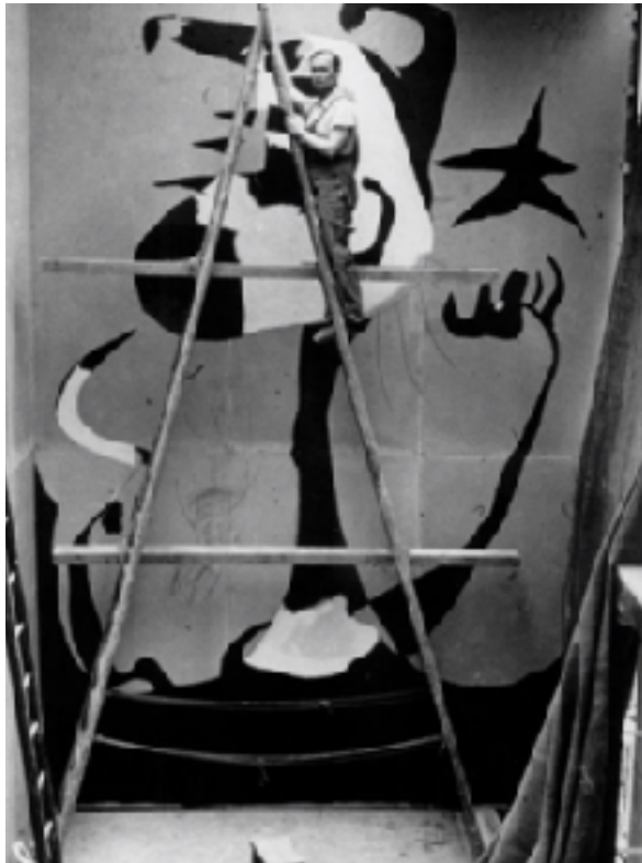
EL SEGADOR (THE REAPER), JOAN MIRO

3. Fun Fact: Miro created a mural, El Segador (The Reaper) that hung next to Picasso's Guernica at the 1939 Paris Exposition.