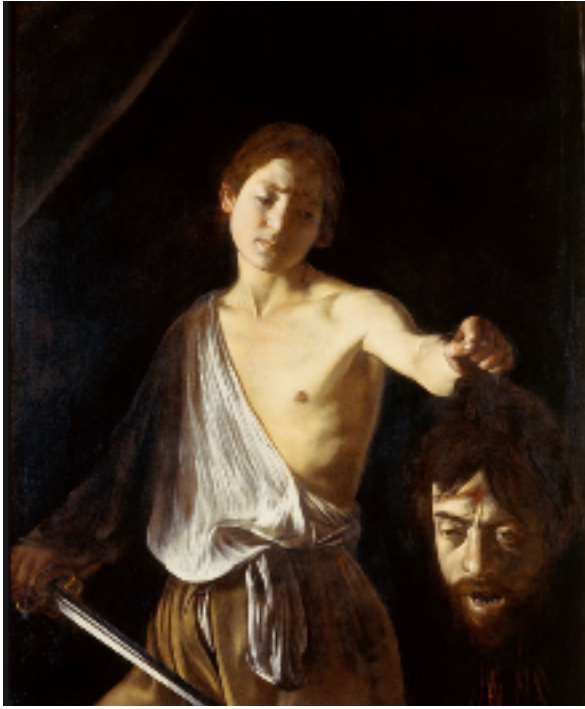
DAVID WITH THE HEAD OF GOLIATH, CARRAVAGIO