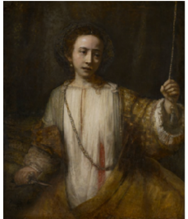
LUCRETIA BY REMBRANDT