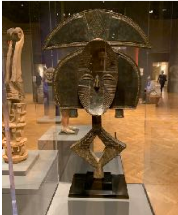
Reliquary figure, late 1800s L2017.12B