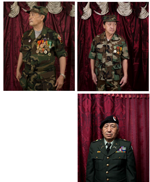
Hmong Veteran, 2012 Inkjet print, hand-painted archival glaze 50 x 40 in.

Courtesy the artist and Bockley Gallery United States; Minneapolis MN