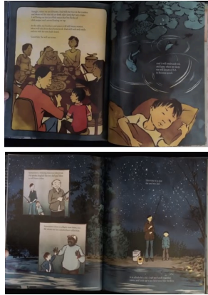
Thi Bui Two spreads from: A Different Pond Four spreads from: The Best We Could Do