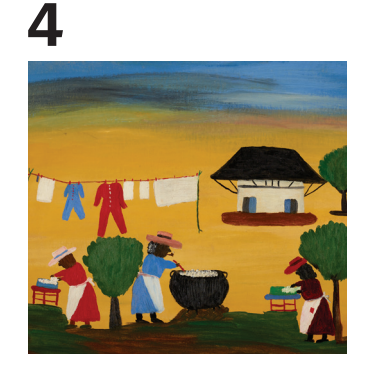
The Wash Clementine Hunter