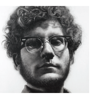
Frank Chuck Close