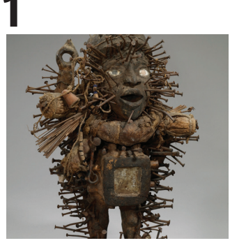
Power figure Kongo, Africa