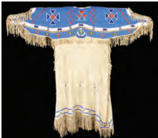
Woman's dress Lakota