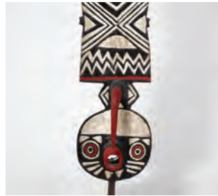
Plank mask Bwa, Burkina Faso