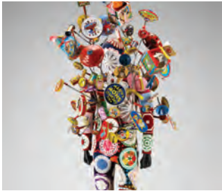
Soundsuit Nick Cave