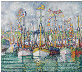
Blessing of the Tuna Fleet at Groix Paul Signac