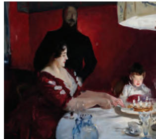
The Birthday Party John Singer Sargent