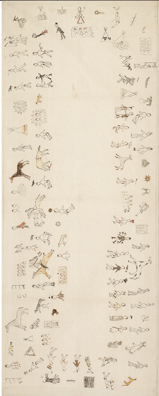
Lakota, United States, North America Winter count, 1900s, pigment on canvas Gift of the Weiser Family Foundation, 2002.163 26 1/4 x 67 1/8 in. (66.68 x 170.5 cm)