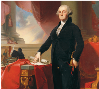
Portrait of George Washington Thomas Sully