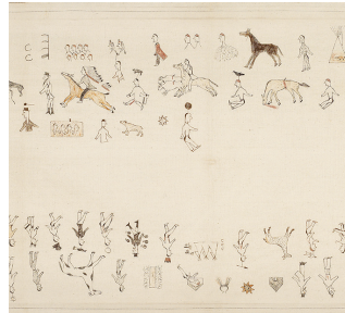
Winter count Lakota