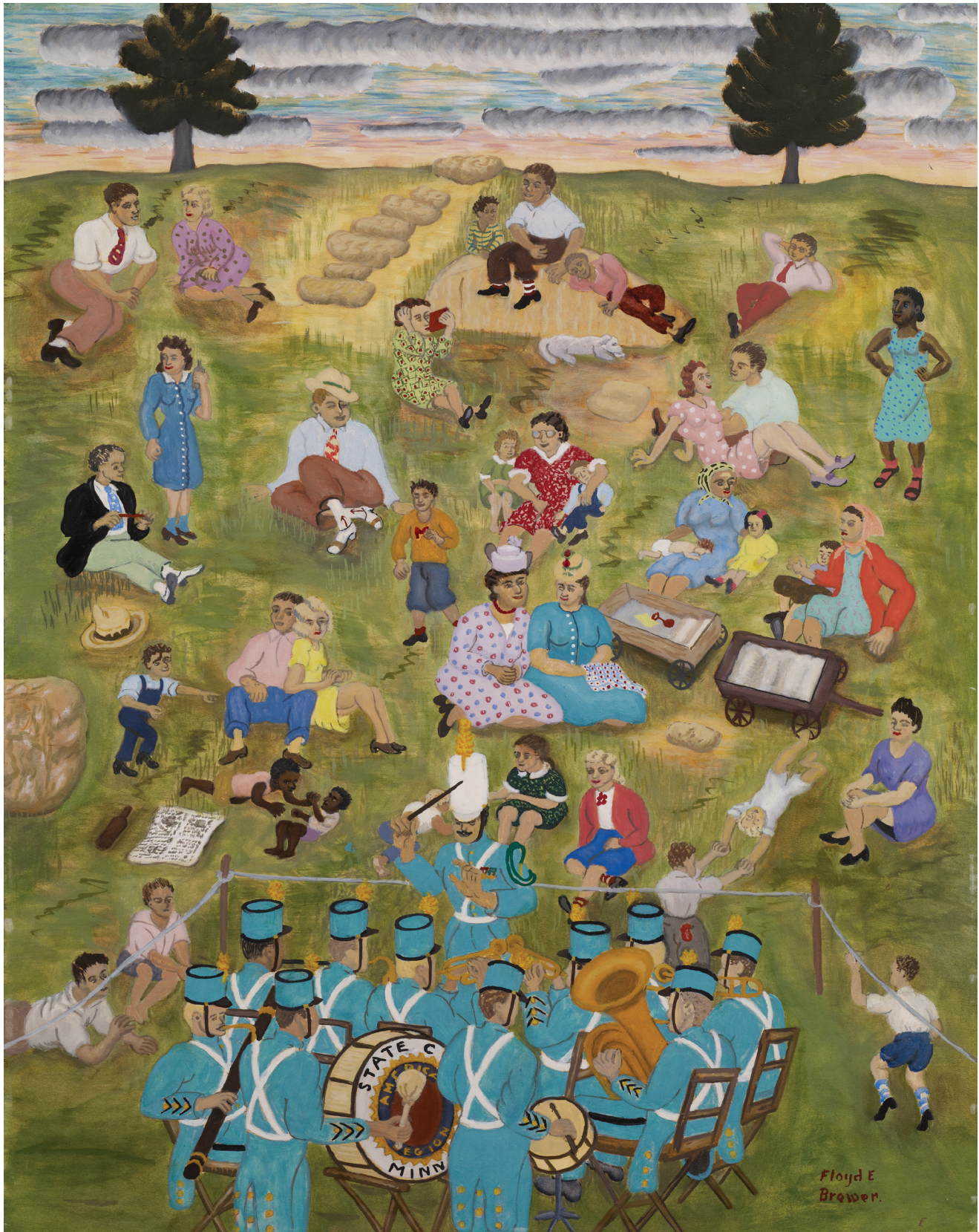
Floyd E. Brewer, United States, 1899–1984 Evening Concert, 20th century, oil on canvas The William Hood Dunwoody Fund, 46.29, Copyright of the artist, artist's estate, or assignees 25 ¼ x 20 in. (64.14 x 50.8 cm)