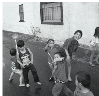
Kids Playing, Frogtown Wing Young Huie