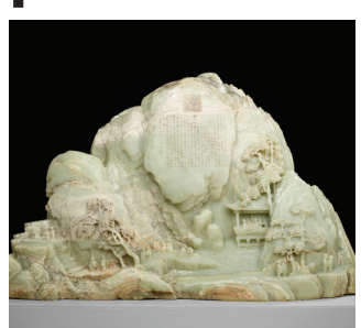
Jade Mountain China