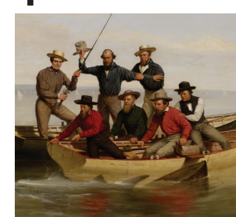
A Fishing Party Off Long Island Junius Brutus Stearns