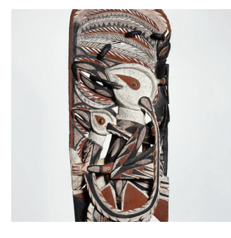
Frieze from a Malagan ceremony Papua New Guinea