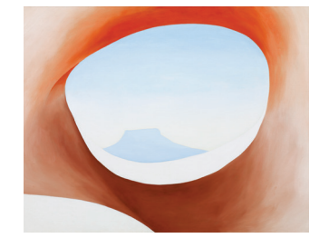
Pedernal—From the Ranch #1 Georgia O'Keeffe