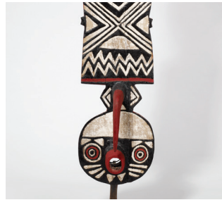
Plank mask Bwa, Burkina Faso