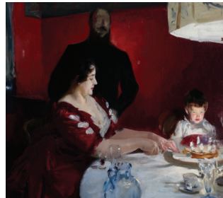
The Birthday Party John Singer Sargent