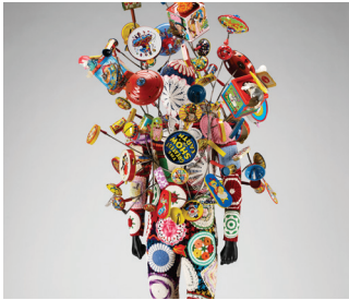
Soundsuit Nick Cave