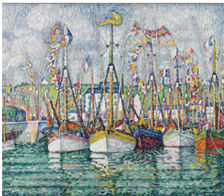
Blessing of the Tuna Fleet at Groix Paul Signac