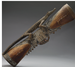
Hand drum ( Kundu ) latmul, Papua New Guinea