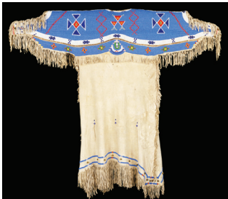
Woman's dress Lakota