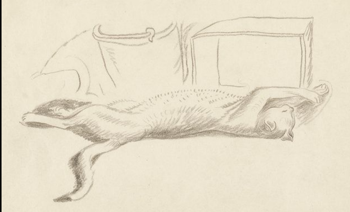
Wanda Gág, Reclining Cat, 1920s, Graphite, 78.61.1