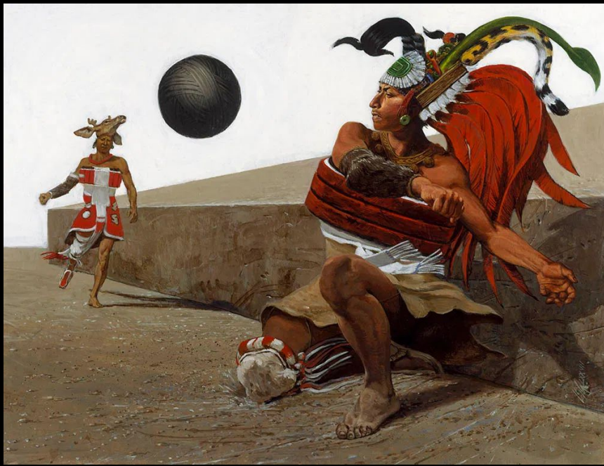
Nopiloa (Veracruz), Mexico, North America, Figure, 600–750 CE, Clay, pigments, The John R. Van Derlip Fund, 47.2.9. Above, Mayan players, National Geographic Education Blog