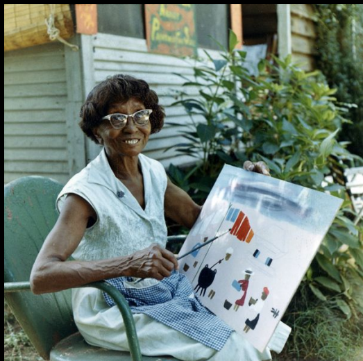
Clementine Hunter, United States, 1885–1988, Picking Cotton, 1950s, Oil on board, The Ethel Morrison Van Derlip Fund, 91.88.1.