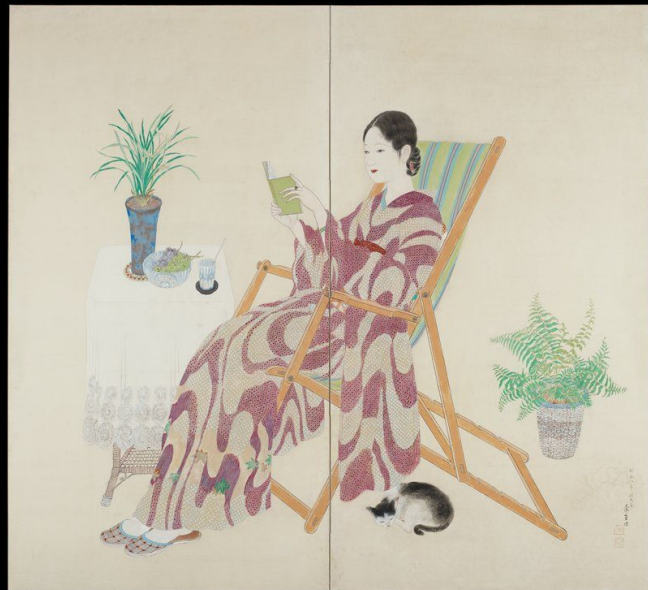
Yasuma Soda, Woman and Cat , 1933, 2009.41