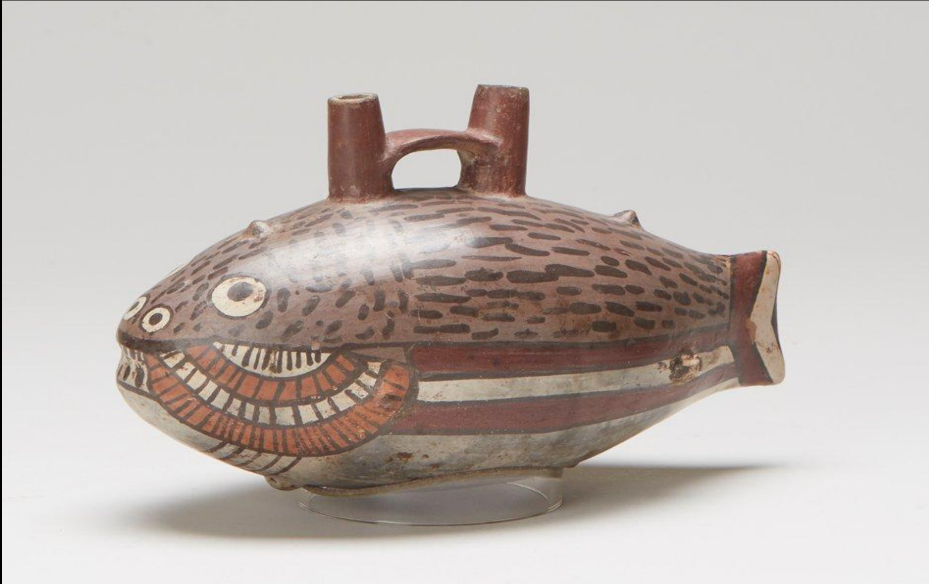
Nasca, Peru, South America, Vessel in the Form of a Fish, 100 BCE–600 CE, Clay, pigments, The Ethel Morrison Van Derlip Fund, 44.3.59