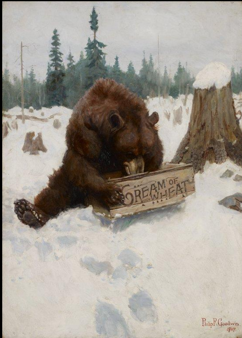
Philip R. Goodwin, United States, 1882–1935, A "Bear" Chance , 1907, Oil on canvas, Gift of the National Biscuit Company, 70.64