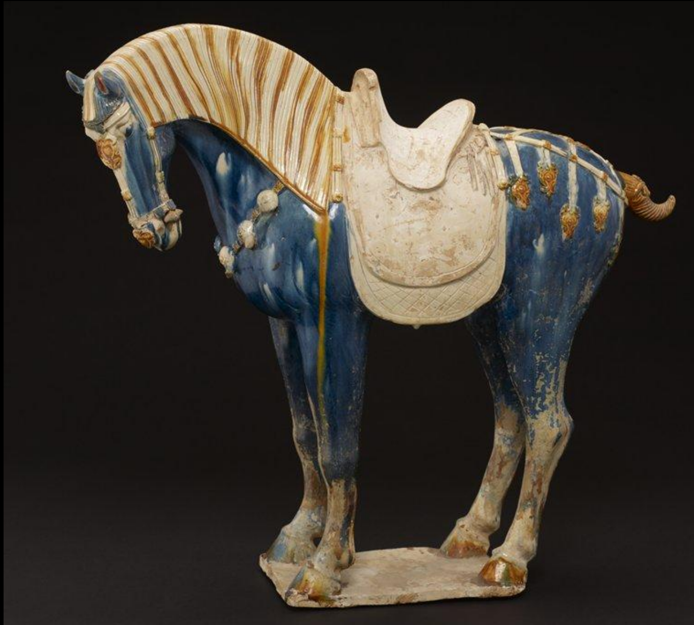
China, Asia, Horse, 8th century, Earthenware with polychrome glaze, The Ethel Morrison Van Derlip Fund, 49.1.6