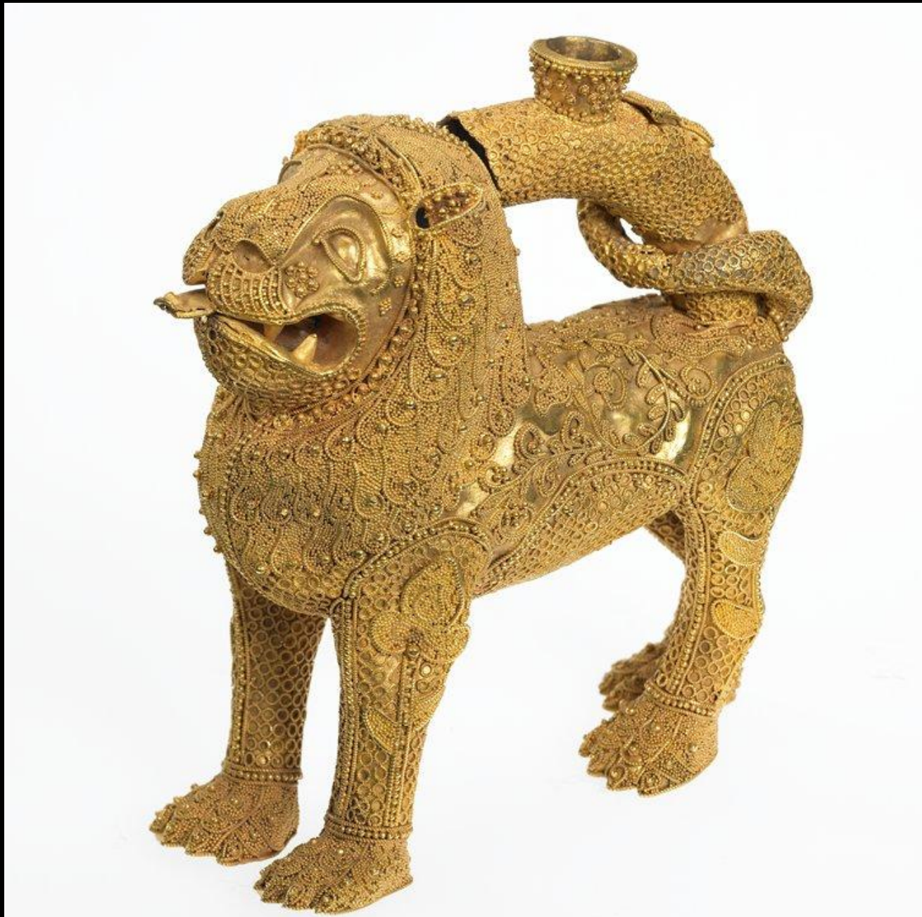
Hispano-Moorish, Europe, Statue of a lion, 11th–12th century, Gold, The Katherine Kettridge McMillan Memorial Fund, 72.12