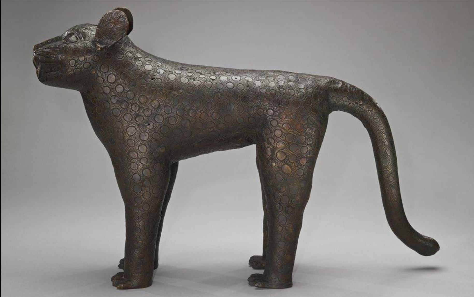
Edo, Nigeria, Africa, Water pitcher, 18th century, Bronze, The Miscellaneous Works of Art Purchase Fund, 58.9