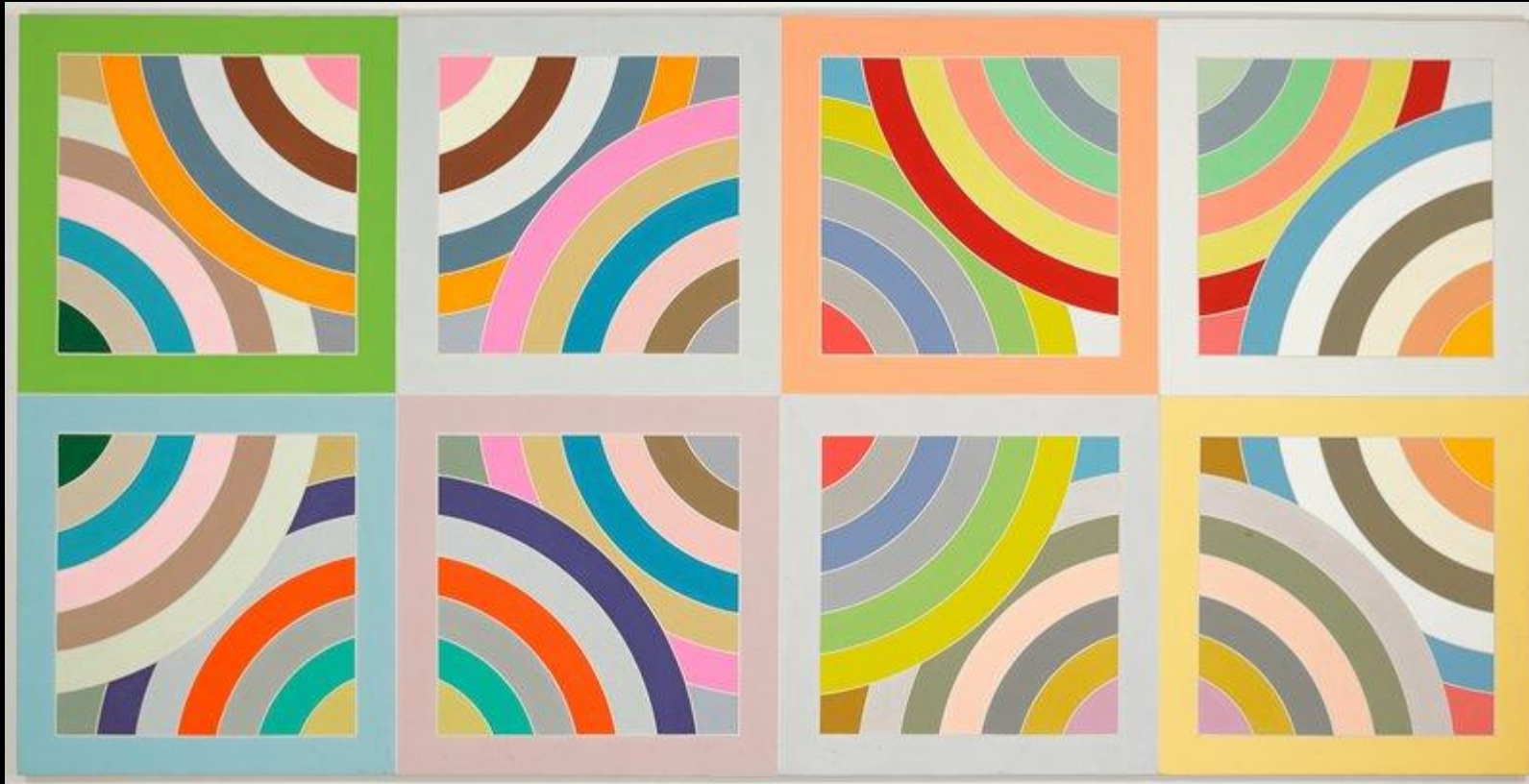
Frank Stella, United States, 1936, Tahkt-I-Sulayman Variation II , 1969, Acrylic on canvas, Gift of Bruce B. Dayton, 69.132, Tahkt-I-Sulayman Variation II , 1969 © Frank Stella / Artists Rights Society (ARS), New York