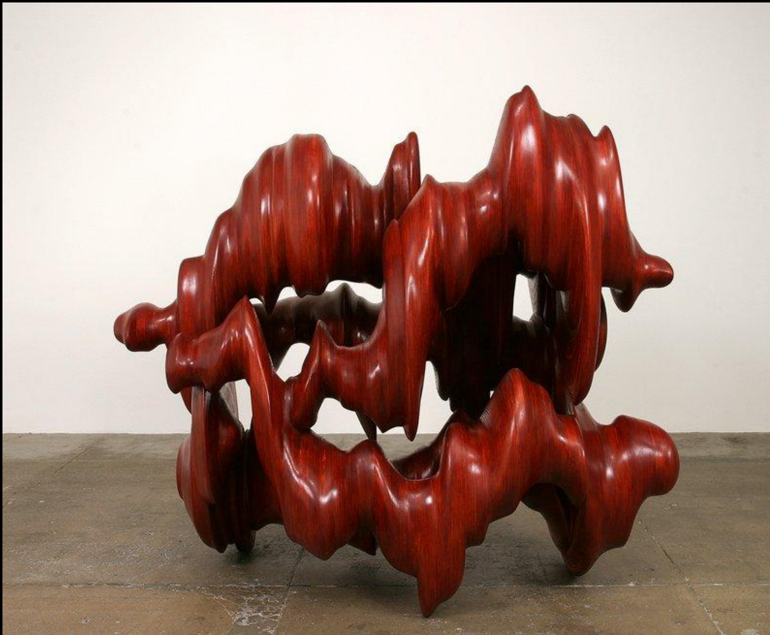
Tony Cragg, Germany, 1949, Pulse, 2003, Wood (kerto), The Ethel Morrison Van Derlip Fund and the David and Ruth Waterbury Endowment for Contemporary Craft, 2014.18