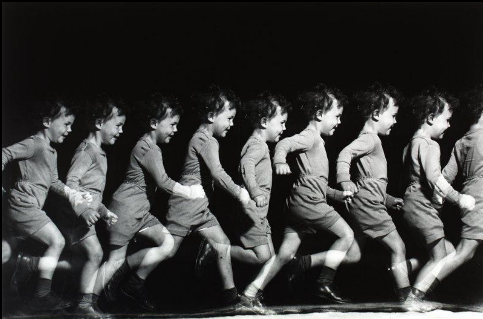
Harold E. Edgerton, United States, 1903–90, Child Running, 1939, Gelatin silver print, Gift of the Harold and Esther Edgerton Family Foundation, 96.149.20