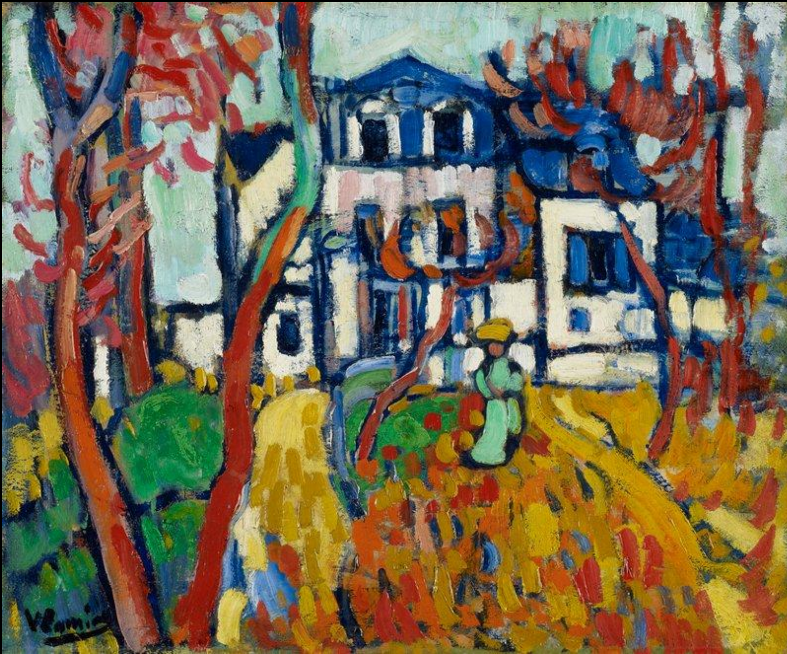
Maurice de Vlaminck, France, 1876–1958, The Blue House , 1906, Oil on canvas, Bequest of Putnam Dana McMillan, 61.36.17, © Artists Rights Society (ARS), New York / ADAGP, Paris