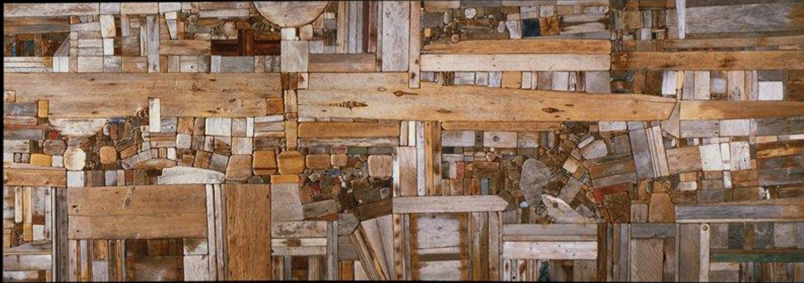
George Morrison, United States, 1919–2000, Collage IX: Landscape , 1974, Wood, The Francis E. Andrews Fund, 75.24, © Estate of George Morrison / Briand Morrison