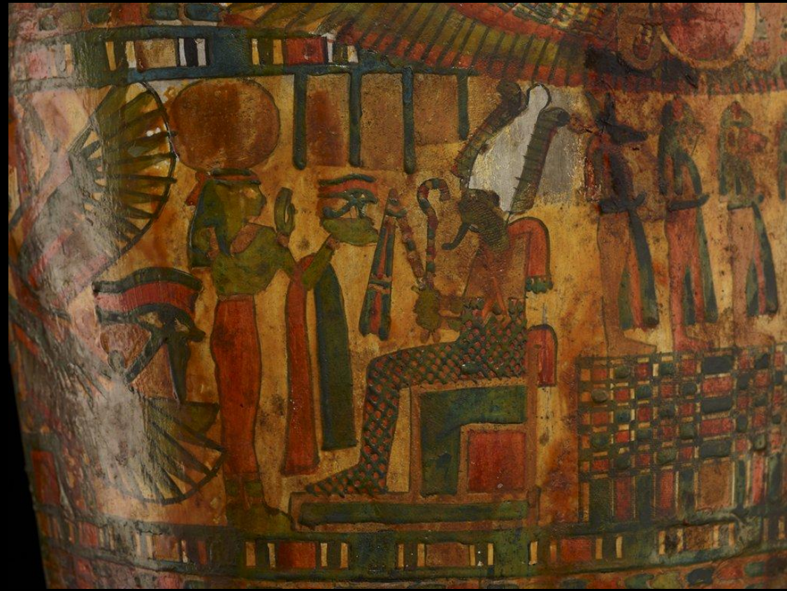
G250: Ancient Egyptian, Egypt, Africa, Coffin and Cartonnage of Lady Tashat, 945–712 BCE, Painted and varnished linen, The William Hood Dunwoody Fund, 16.414