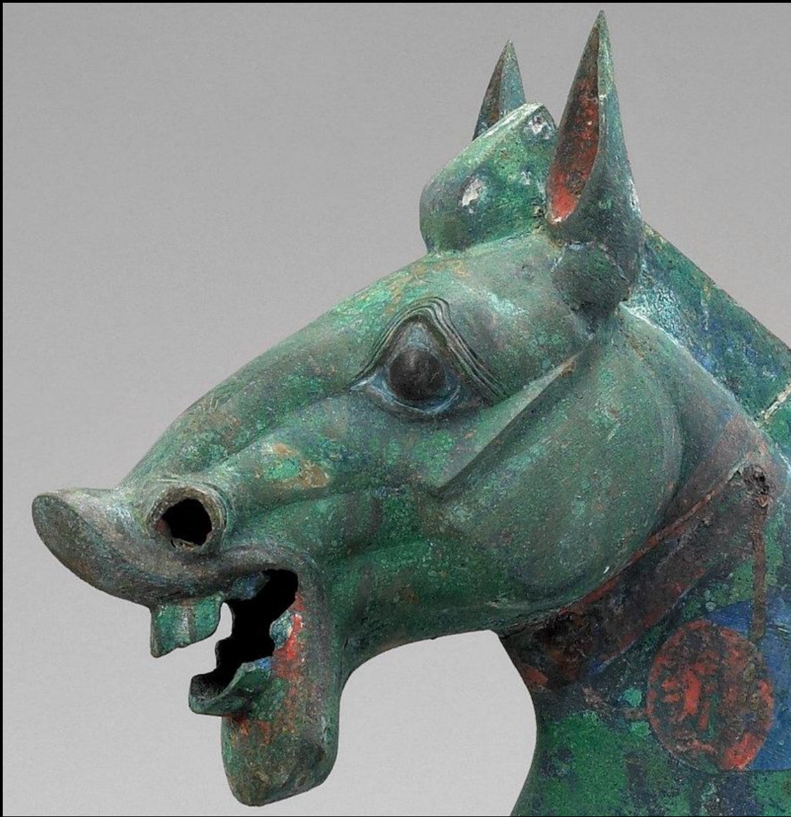
China, Asia, Celestial Horse, 25–220, Bronze with traces of polychrome, Gift of Ruth and Bruce Dayton, 2002.45