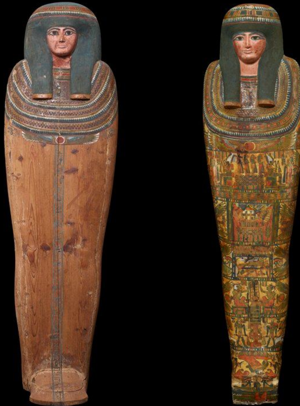
G250: Ancient Egyptian, Egypt, Africa, Coffin and Cartonnage of Lady Tashat, 945–712 BCE, Painted and varnished linen, The William Hood Dunwoody Fund, 16.414