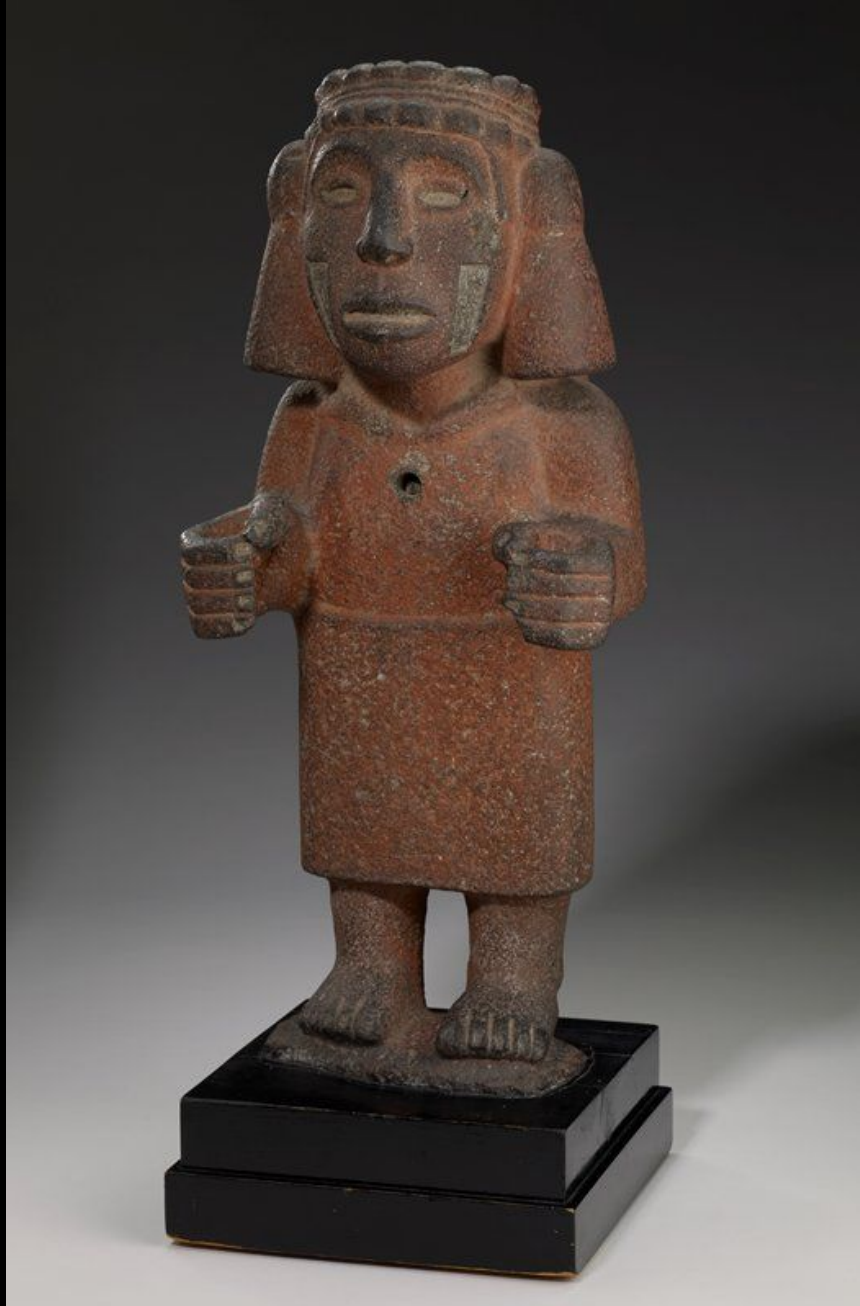
Aztec, Mexico, North America, Chalchiuhtlicue, 1200–1521, Gray basalt, red ochre, Gift of Curtis Galleries, Minneapolis, MN, 2009.33