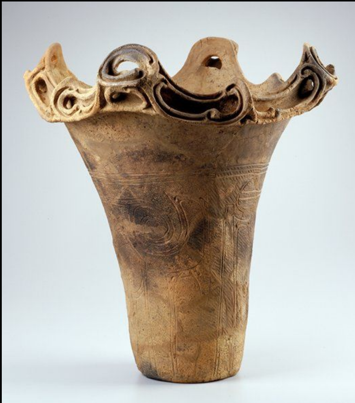
Unknown Japanese, Japan, Asia, Deep Bowl with Four Projections, 2500–1500 BCE, Earthenware, The Ethel Morrison Van Derlip Fund, 82.9.1