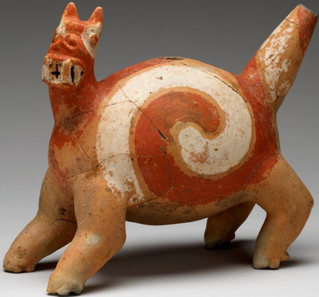
Ugahxpa (Quapaw), United States, North America Vessel, 1500, Clay, pigments The William Hood Dunwoody Fund, 2004.33