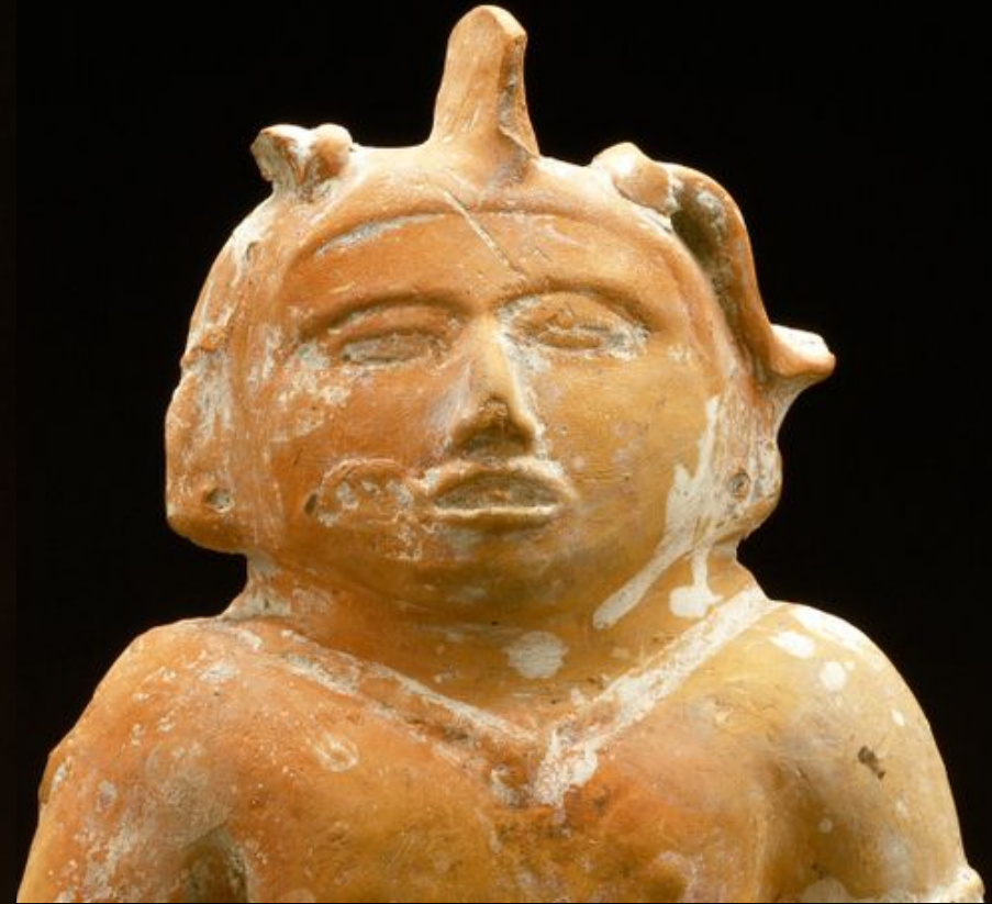
G260: Nopiloa (Veracruz), Mexico, North America, Figure, 600–750 CE, Clay, pigments, The John R. Van Derlip Fund, 47.2.9