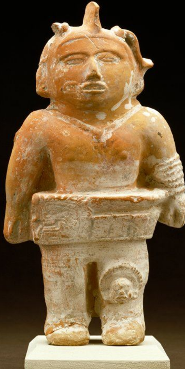
Nopiloa (Veracruz), Mexico, North America, Figure, 600–750 CE, Clay, pigments, The John R. Van Derlip Fund, 47.2.9