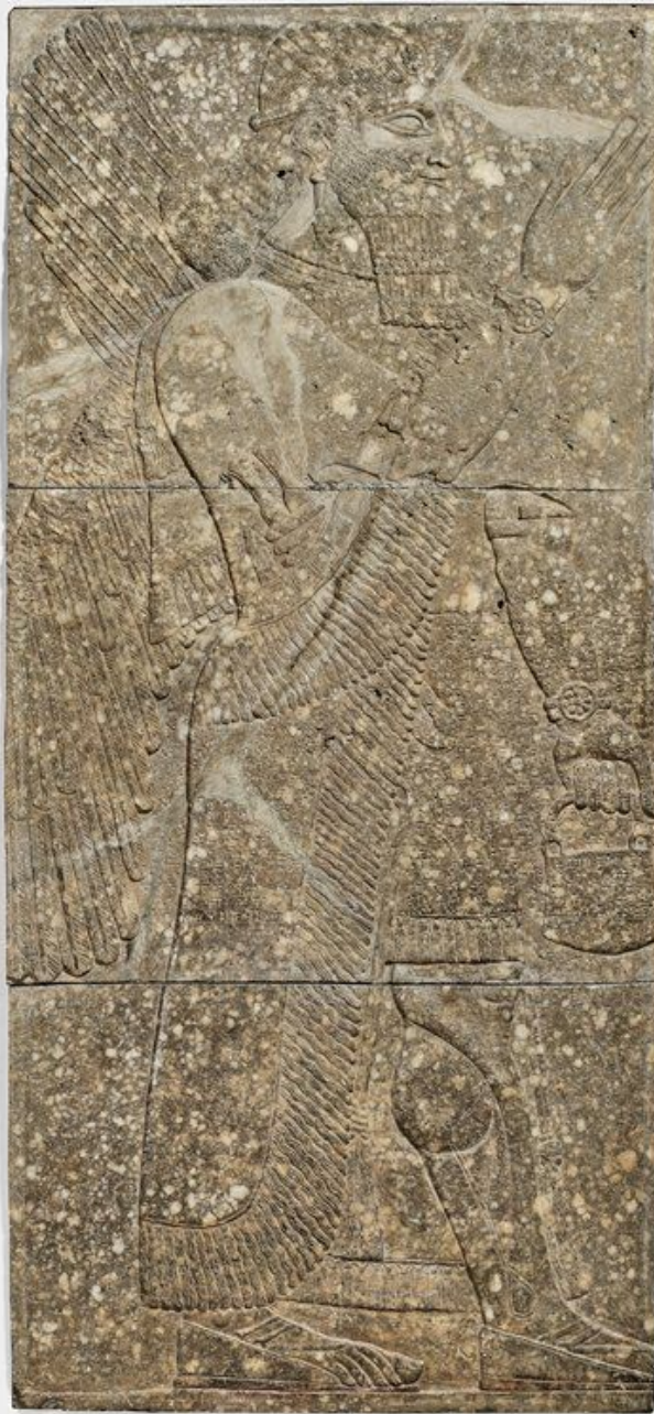
G240: Assyrian, Iraq, Asia, Winged Genius, 883–859 BCE, Limestone, The Ethel Morrison Van Derlip Fund, 41.9