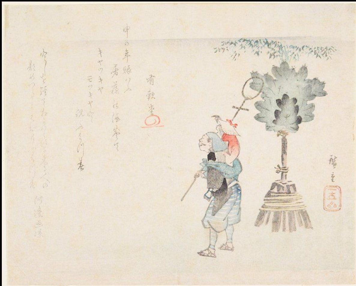
Utagawa Hiroshige, Japan, 1797–1858 Monkey trainer, 1848, Woodblock print (surimono); ink and color on paper The Ethel Morrison Van Derlip Fund, P.77.34

https://collections.artsmia.org/art/61686/monkey-trainer-utagawa-hiroshige