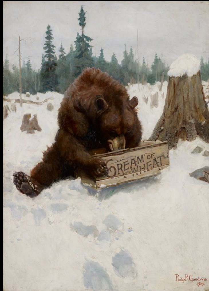
Philip R. Goodwin, United States, 1882–1935 A "Bear" Chance, 1907, Oil on canvas Gift of the National Biscuit Company, 70.64

https://collections.artsmia.org/search/beer%20chance