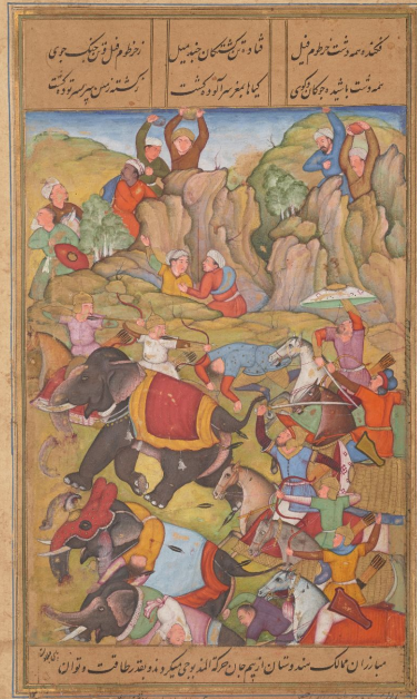
Bhora, India The Armies of Timur Combat the Forces of Nasir al-Din Mahmud Tughluq, from the Zafarnama, 1595–1600, Opaque colors and gold on paper The Katherine Kittredge McMillan Memorial Fund, 2014.101

https://collections.artsmia.org/art/120430/the-armies-of-timur-combat-the-forces-of-nasir-al-din-mahmud-tughluq-bhora