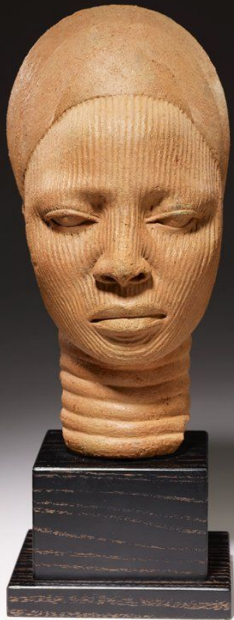
Ancient Yoruba, Nigeria, Africa Shrine head, 12th–14th century, Terracotta The John R. Van Derlip Fund, 95.84