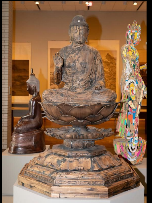
Minneapolis Institute of Art