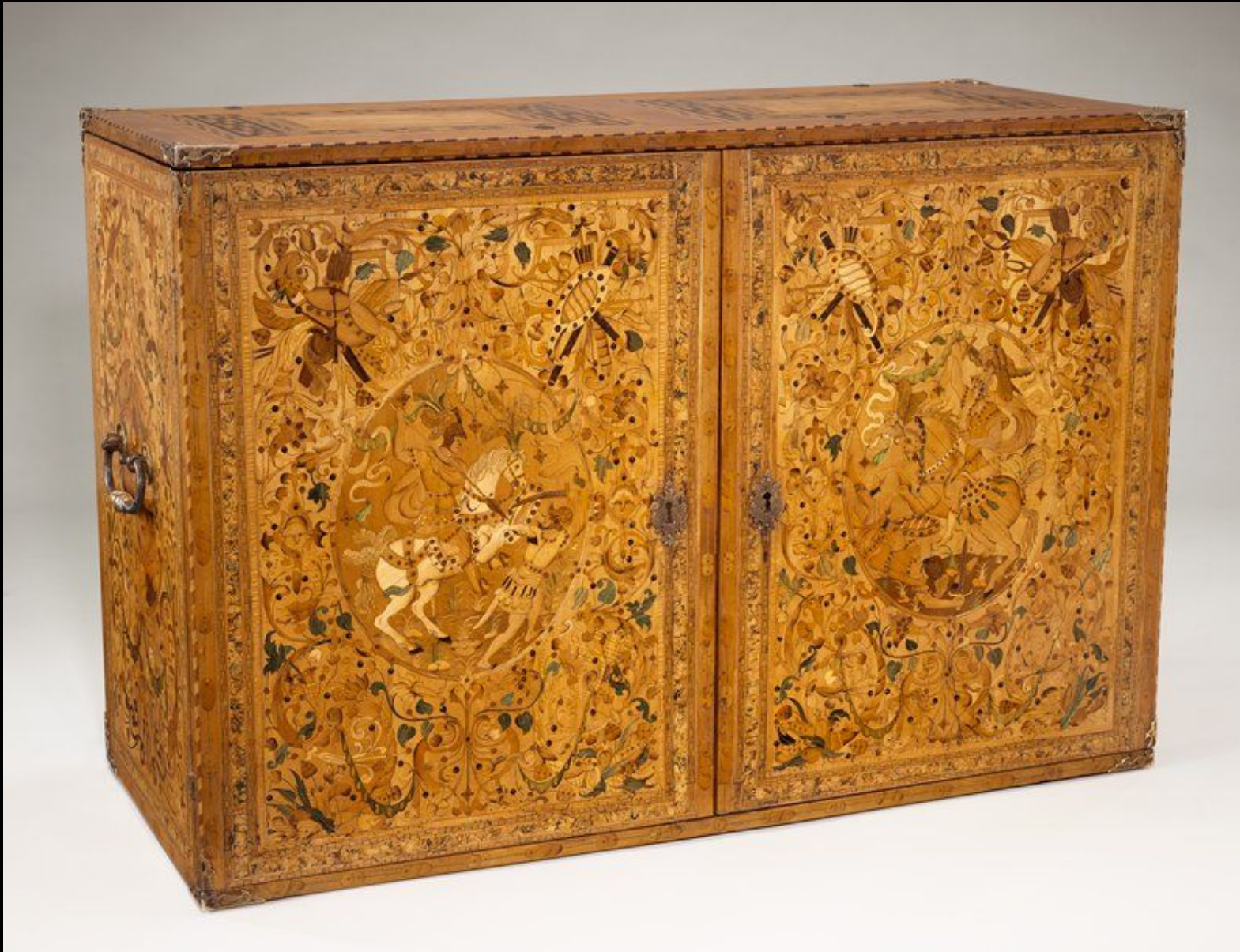
Germany, Europe Table cabinet, 1560–70, Oak and pine veneered with partly stained and ebonized maple, plum, ash, with etched, blued, and parcel gilt iron fittings The John R. Van Derlip Fund, the John and Ruth Huss Fund for Decorative Arts, and the Walter C. and Mary C. Briggs Trust Fund, 2018.15a-x