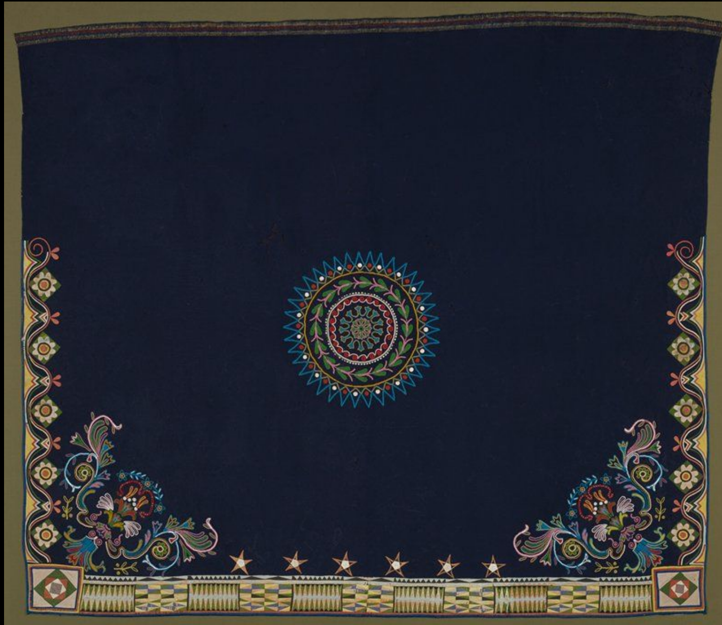
Anishinaabe (Ojibwe) or Dakhóta, United States, North America Dance Blanket, 1840–50, Wool, silk, beads; needlework The Robert J. Ulrich Works of Art Purchase Fund, 2007.1