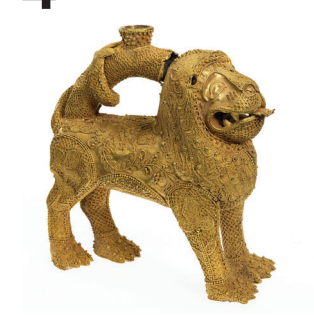
Gold lion statuette Hispano-Moorish Europe