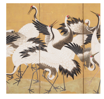
Flock of Cranes Ishida Yūtei