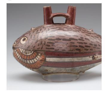
Vessel in the form of a fish Nazca, Peru