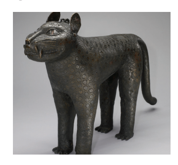
Water pitcher in the form of a leopard Edo, Nigeria