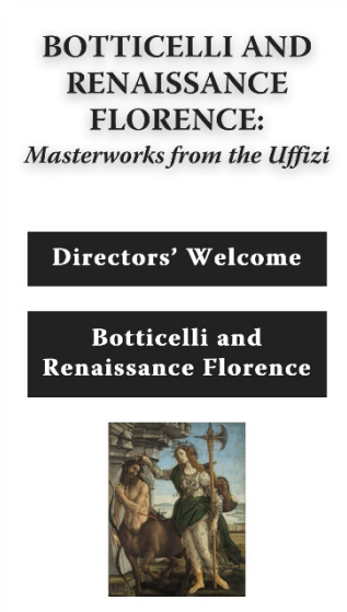
Home page/Stop list page