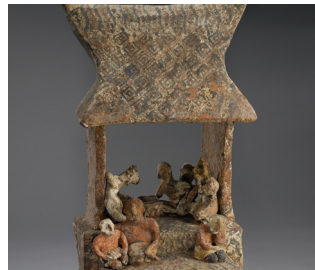
House group Nayarit, Mexico