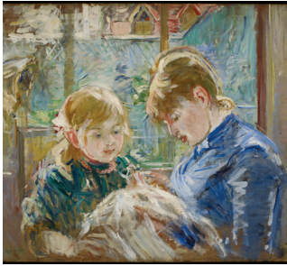
The Artist's Daughter, Julie, with Her Nanny Berthe Morisot