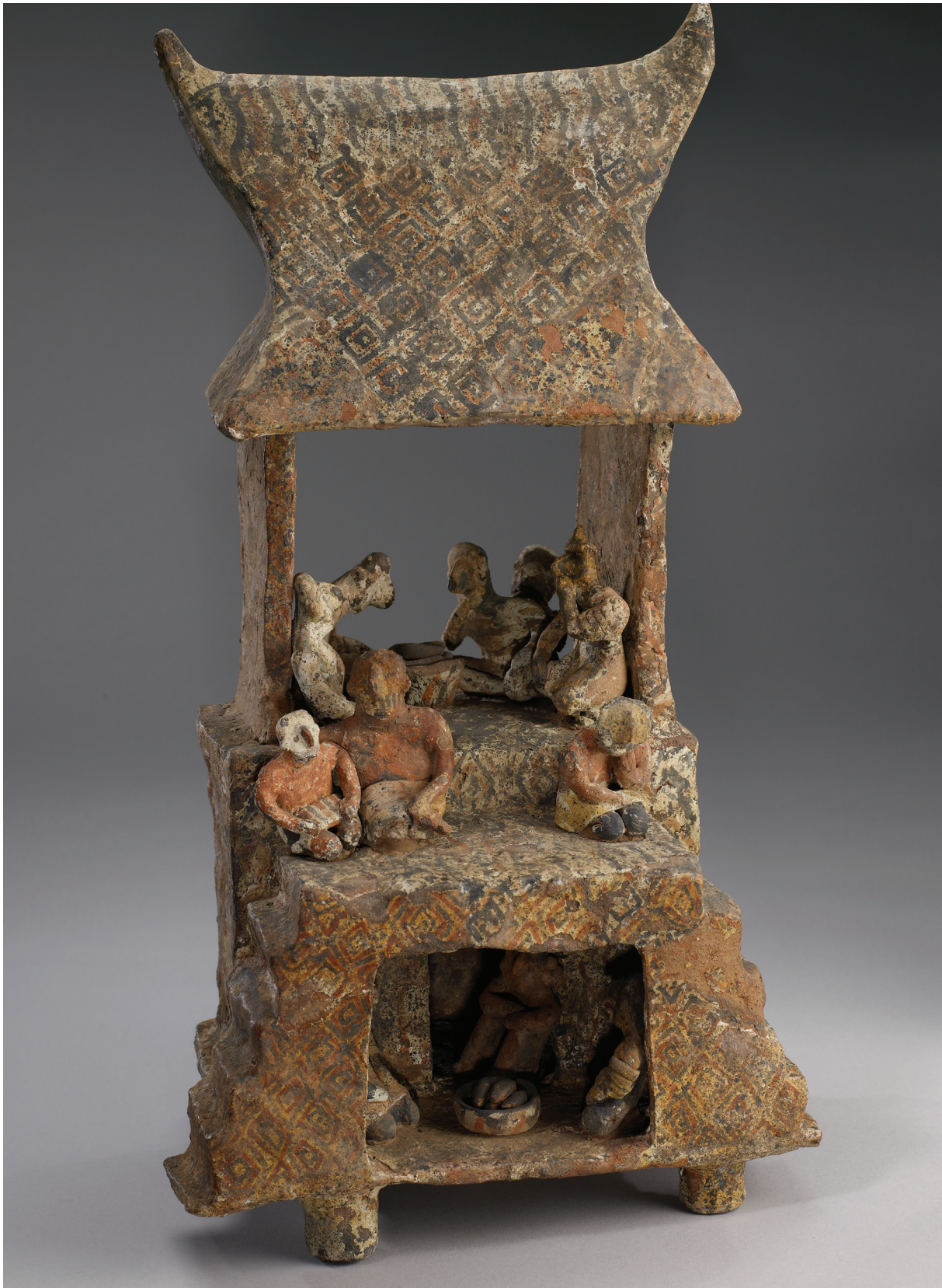
Nayarit, Mexico, Central America House group, 100–400 CE, clay, pigments The John R. Van Derlip Fund, 47.2.37 18 x 9 ¾ x 7 in. (45.7 x 24.8 x 17.8 cm)