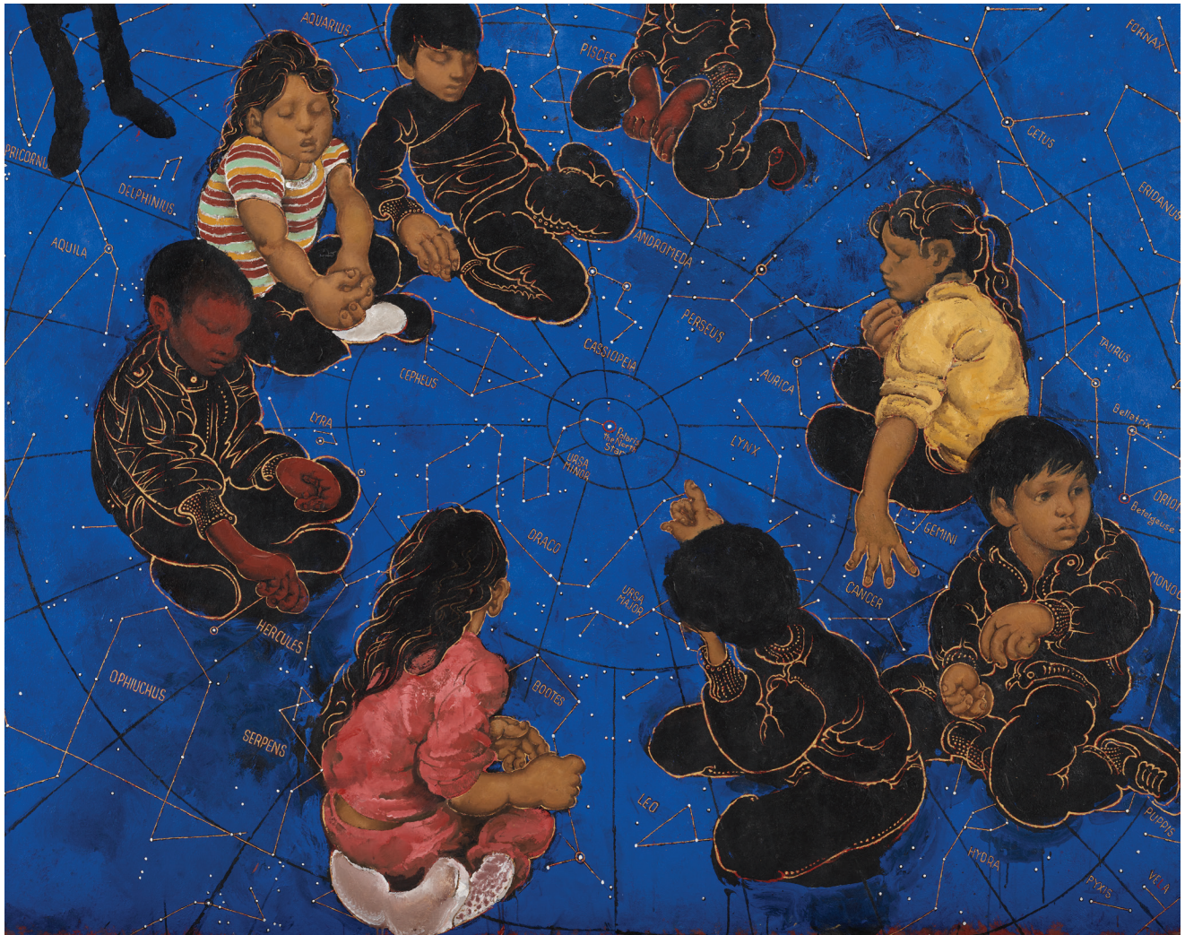
Martin Wong, United States, 1946–99 Polaris , 1987, Acrylic on canvas The P.D. McMillan Memorial Fund 2017.35 © Estate of Martin Wong 73 ½ × 92 ¼ × 1 ¼ in. (186.69 × 234.32 × 3.18 cm)