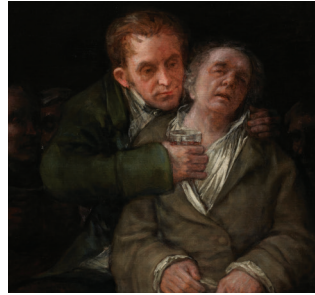
Self-portrait with Dr. Arrieta Francisco Goya