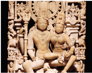
Uma-Mahaeshvara (Shiva's Family) Madya Pradesh, India