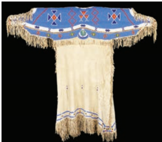
Woman's dress Lakota