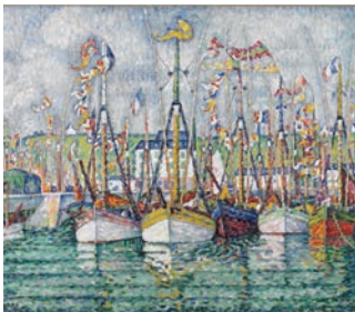
Blessing of the Tuna Fleet at Groix Paul Signac