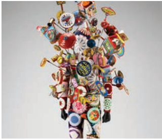
Soundsuit Nick Cave