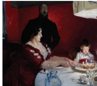
The Birthday Party John Singer Sargent