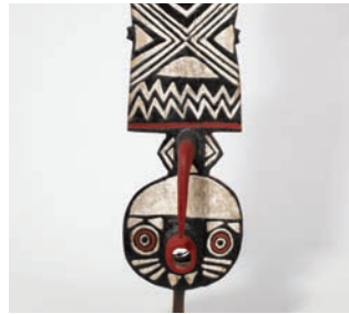
Plank mask Bwa, Burkina Faso