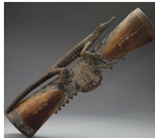
Hand drum ( Kundu ) latmul, Papua New Guinea