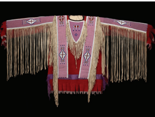
Shirt A'aninin (Gros Ventre)