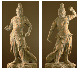
Vajra warriors Japan