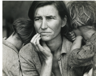
Migrant Mother Dorothea Lange