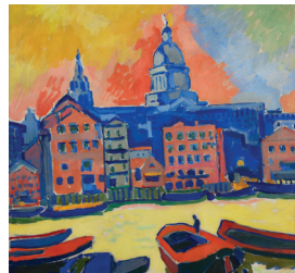
London: Saint Paul's Cathedral seen from the Thames André Derain