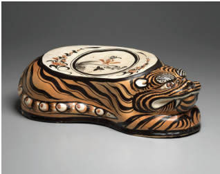
Tiger pillow China