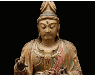
Seated Avalokiteshvara Bodhisattva (Guanyin) China