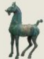
Eastern Han Dynasty