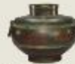
Warring States Period