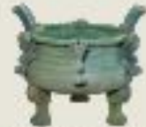
Spring and Autumn Period