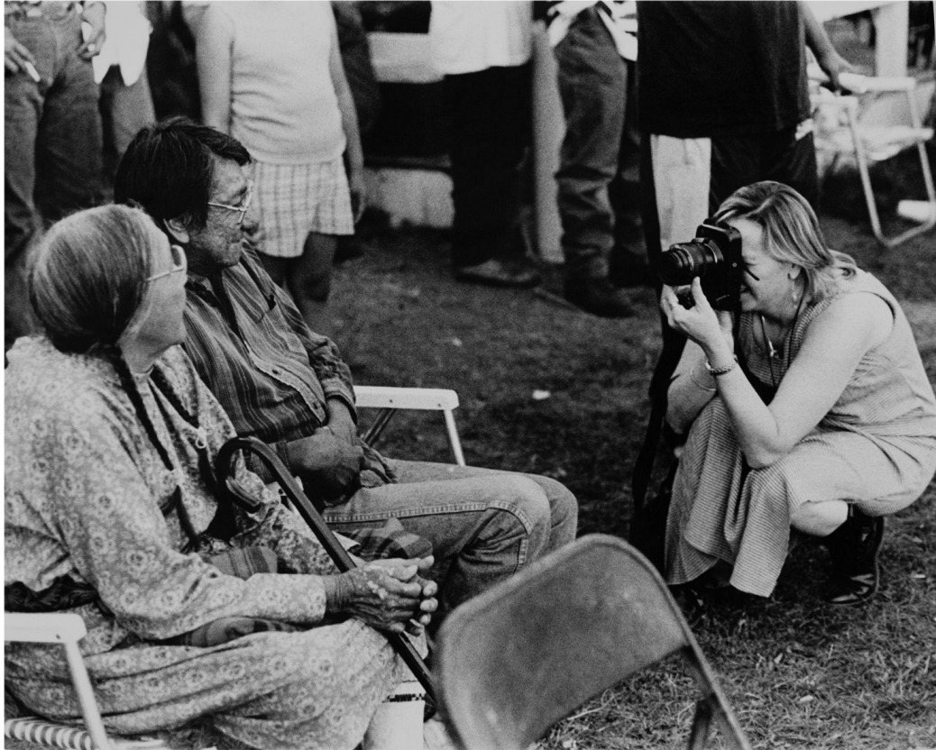
Zig Jackson (Rising Buffalo) [Sahnish (Arikara), Minitari (Hidatsa), Numakiki (Mandan), born 1957], Indian Photographing Tourist Photographing Indians , Crow Agency, Montana , 1991

Gelatin silver print Mount Holyoke College Art Museum, Purchase with the Madeleine Pinsof Plonsker (Class of 1962) Fund, 2018.8.2