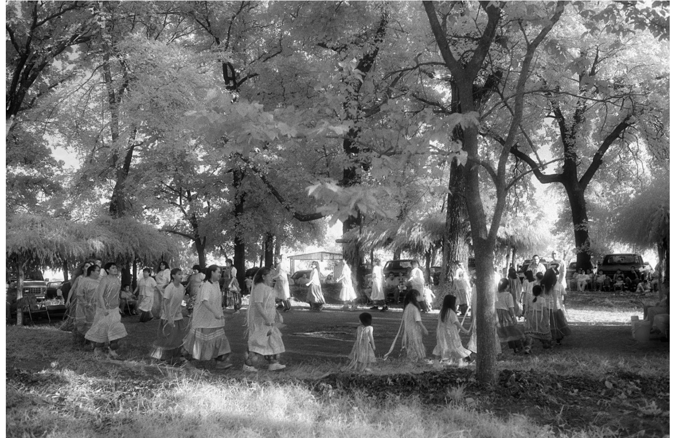
Thomas Fields (Muscogee Creek/Cherokee, born 1951), Dancing in the Sunlight , 1999 Digital black-and-white print on archival paper; originally shot on 35 mm infrared film, collection of the artist

Offerings of tobacco, sage, sweetgrass, and cedar will be present in the Native Reflection Room for visitors to place in baskets throughout the exhibition, or to take home with them. Offerings placed in baskets will be carefully handled following Dakota protocols. They will be gathered regularly and buried under the large oak tree in Target Park with a blessing and a song.