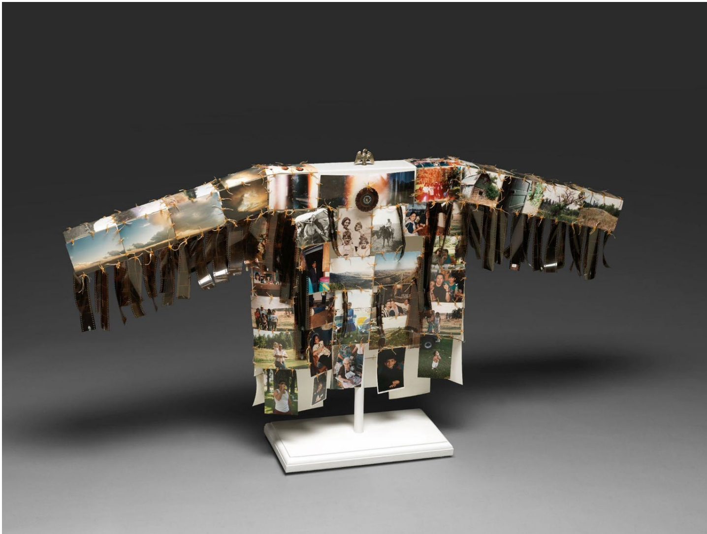
Bently Spang (Northern Cheyenne, born 1960) War Shirt #1 , 1998 From the series Modern War Mixed media Collection of Sandra P. Spang