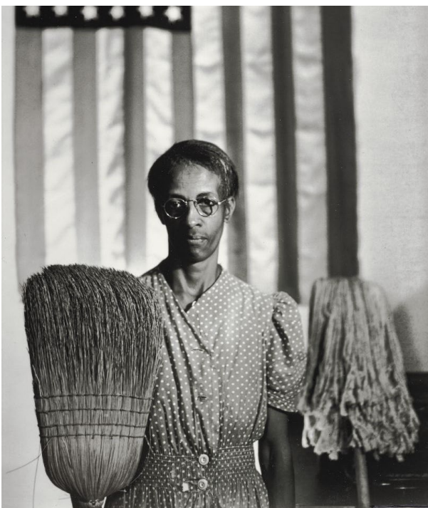
GALLERY 364 Gordon Parks, American Gothic , Washington, D.C., 1942

How might you describe the woman in this photograph?