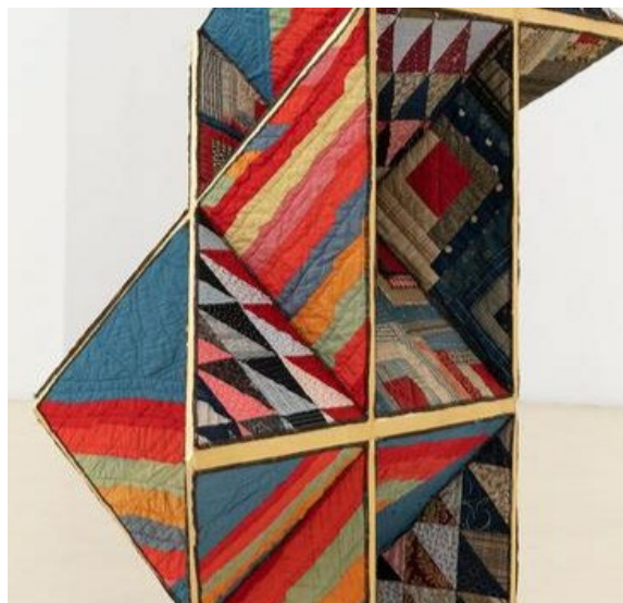
GENERAL MILLS LOBBY Sanford Biggers, Semaphore , 2019

Circle around the sculpture. What repeated patterns and colors do you see?