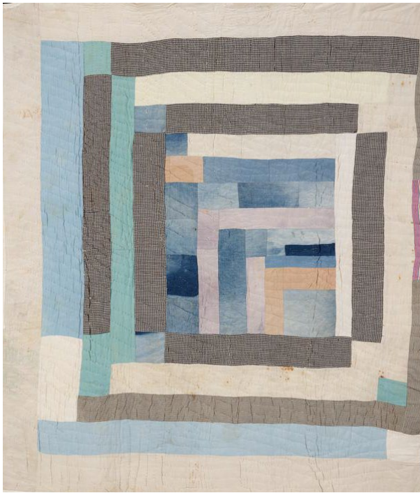
GALLERY 303 Nellie Mae Abrams, "Housetop" quilt, c. 1970

As you look at this quilt's worn surface, what questions come to mind?