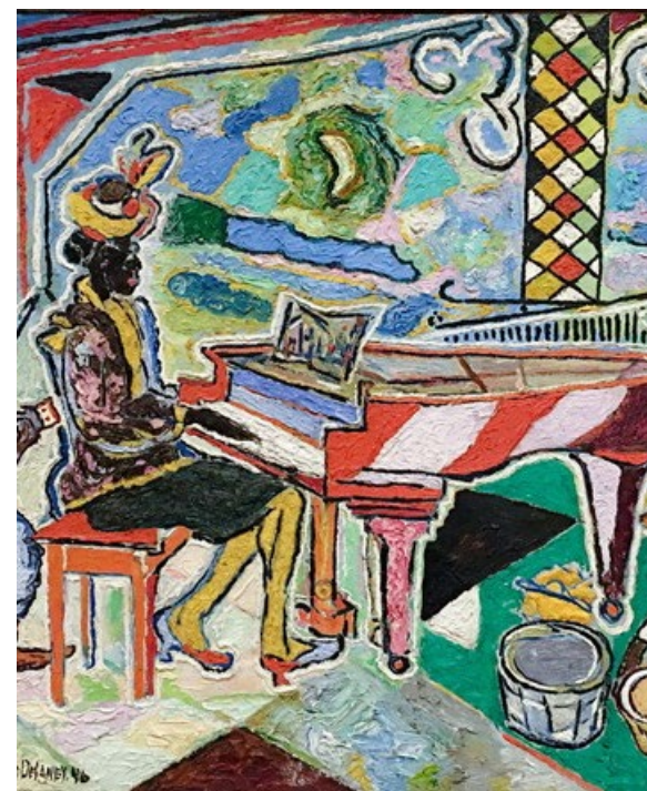
GALLERY 376 Beauford Delaney, Jazz Quartet , 1946, Private collection

James Phillips was deeply involved in movements to recognize and communicate Black and African diasporic identities and creativity through the arts. His Cosmic Connection , at more than 17 feet long, is a bursting, cacophonous, and rhythmic homage to visionary musician, composer, and music theorist John Coltrane. He created the painting during a residency at the Studio Museum in Harlem, as a backdrop to a memorial concert for Coltrane in New York. Imagining an uplifting visual counterpart to Coltrane’s music and soul, Phillips hit on light, explaining, “Sound is sound. I work with the visual manifestations of sound. The visual component to that would be light.”