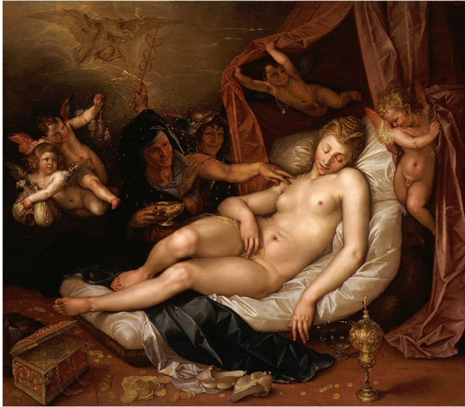
Hendrick Goltzius, Danae, 1603, oil on canvas, Los Angeles County Museum of Art M.84.191

1604 Karel van Mander publishes the Schilder-boeck (Book of Painting), with glowing biography of Goltzius