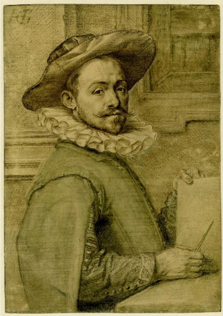
Self-portrait, c. 1589, Silverpoint with graphite, with grey and blue-grey wash, on yellow-prepared vellum, British Museum 1895,0915.1020