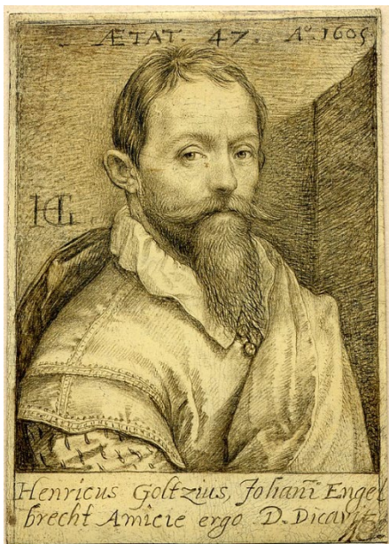
Hendrick Goltzius, Self Portrait, 1605, silverpoint on yellow-prepared vellum, British Museum 1854,1113.230

1604 Karel van Mander publishes the Schilder-boeck (Book of Painting), with glowing biography of Goltzius