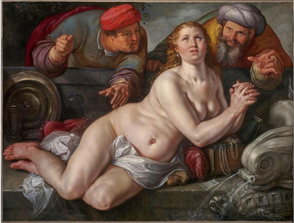
Henrick Goltzius, Susannah and the Elders , 1615, oil on canvas, Museum of Fine Arts, Boston 2000.974